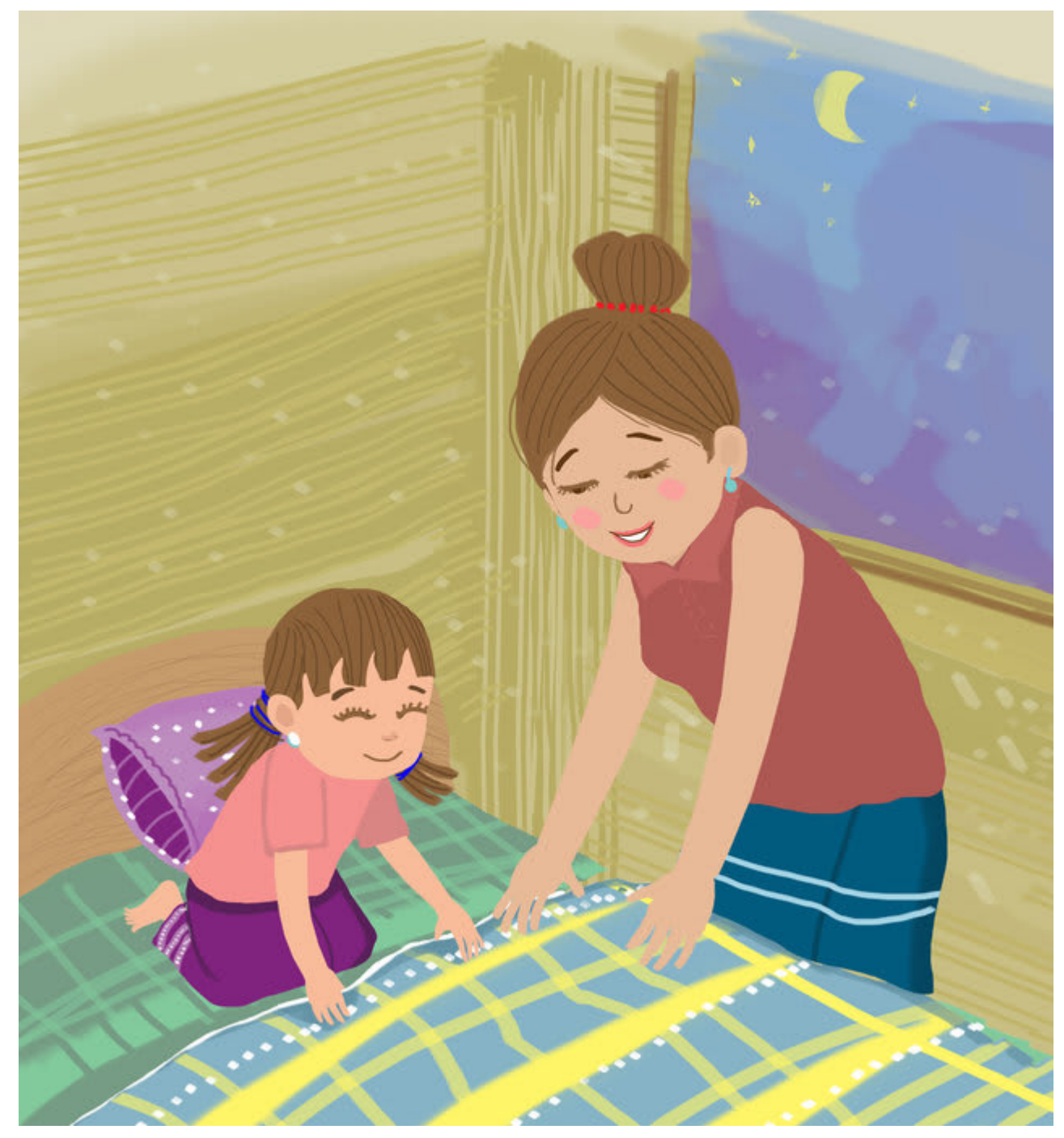
Sebelum tidur, ibu merapikan tempat tidurku. Aku belajar merapikannya juga.