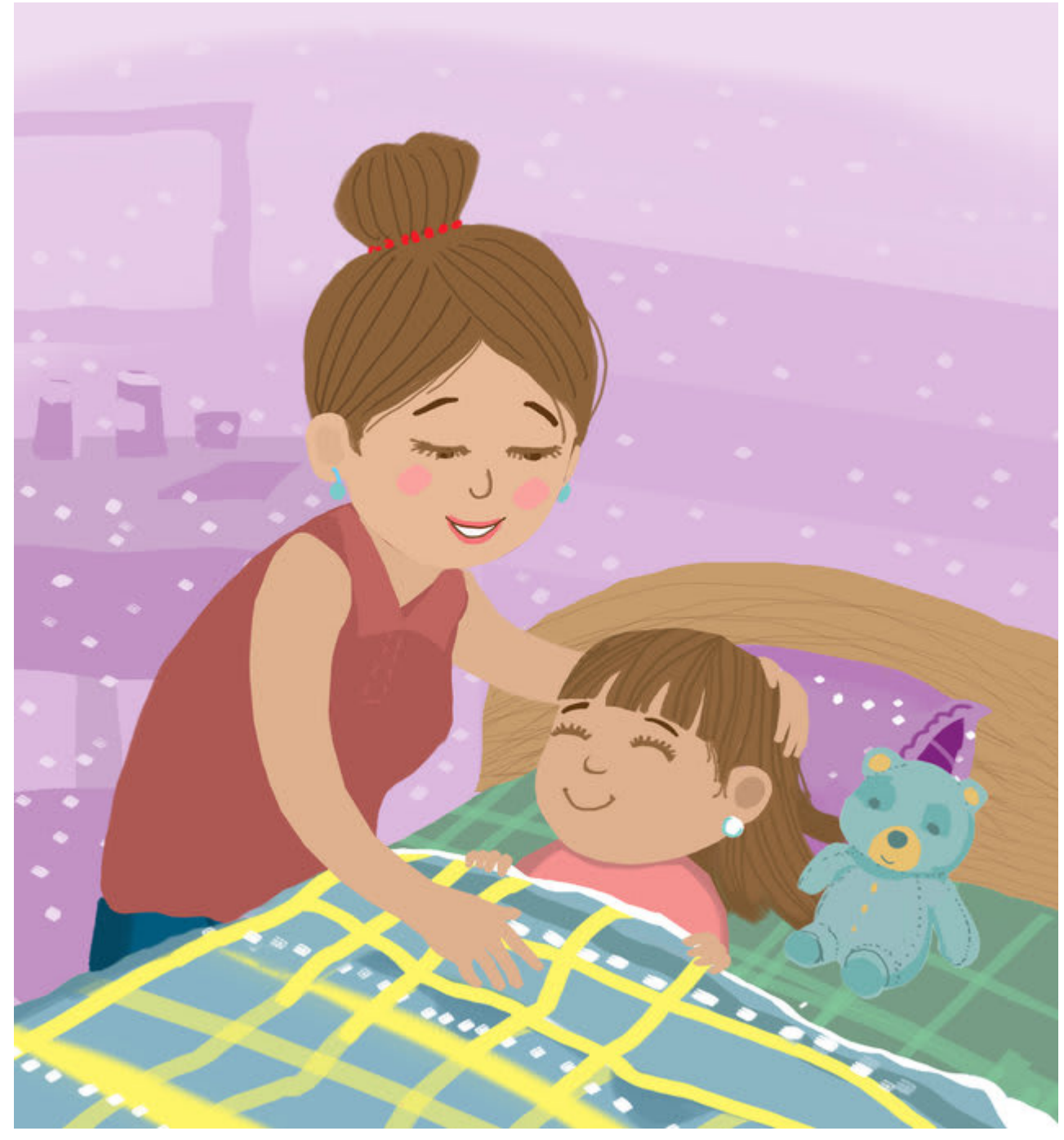
Ketika aku mengantuk, Ibu menyanyikanku lagu hingga aku tertidur.