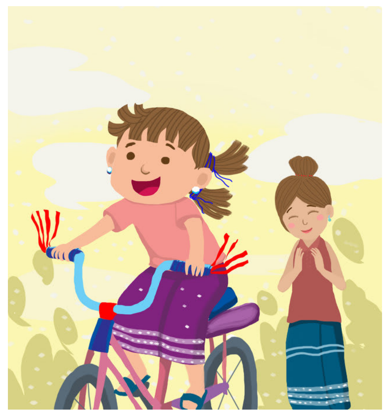
Saat aku bisa mengendarai sepeda, aku pun teriak senang, "Wiiih ...." Ibu tersenyum melihatku.