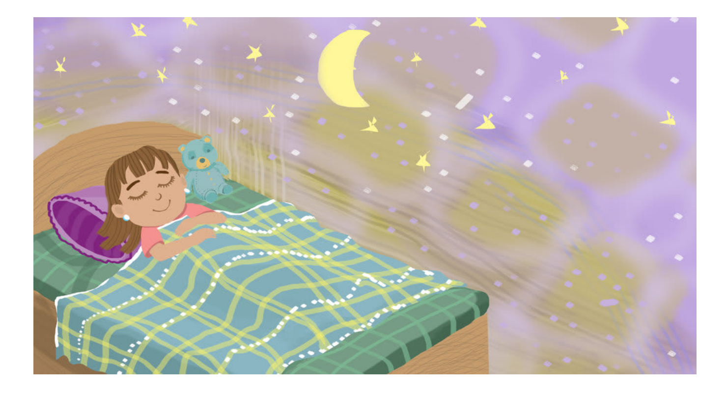
Aku sayaaang Ibu.