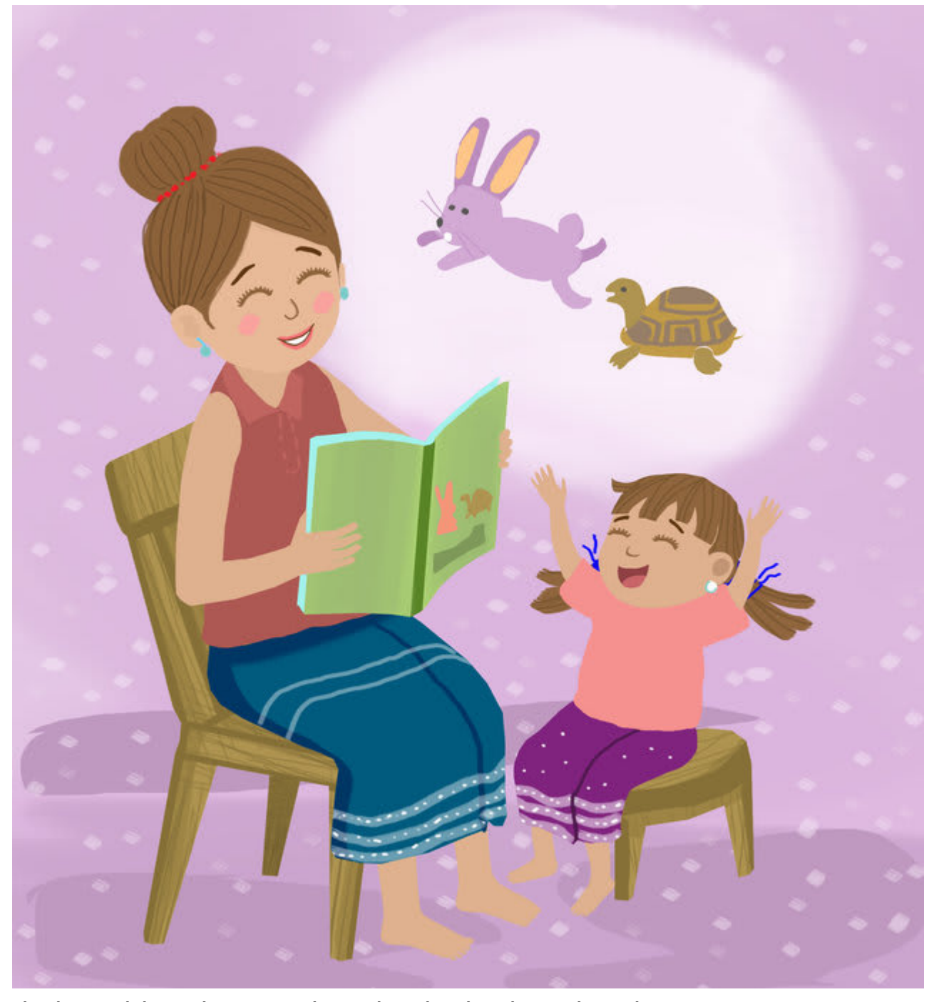
Sebelum tidur, Ibu membacakanku berbagai cerita.