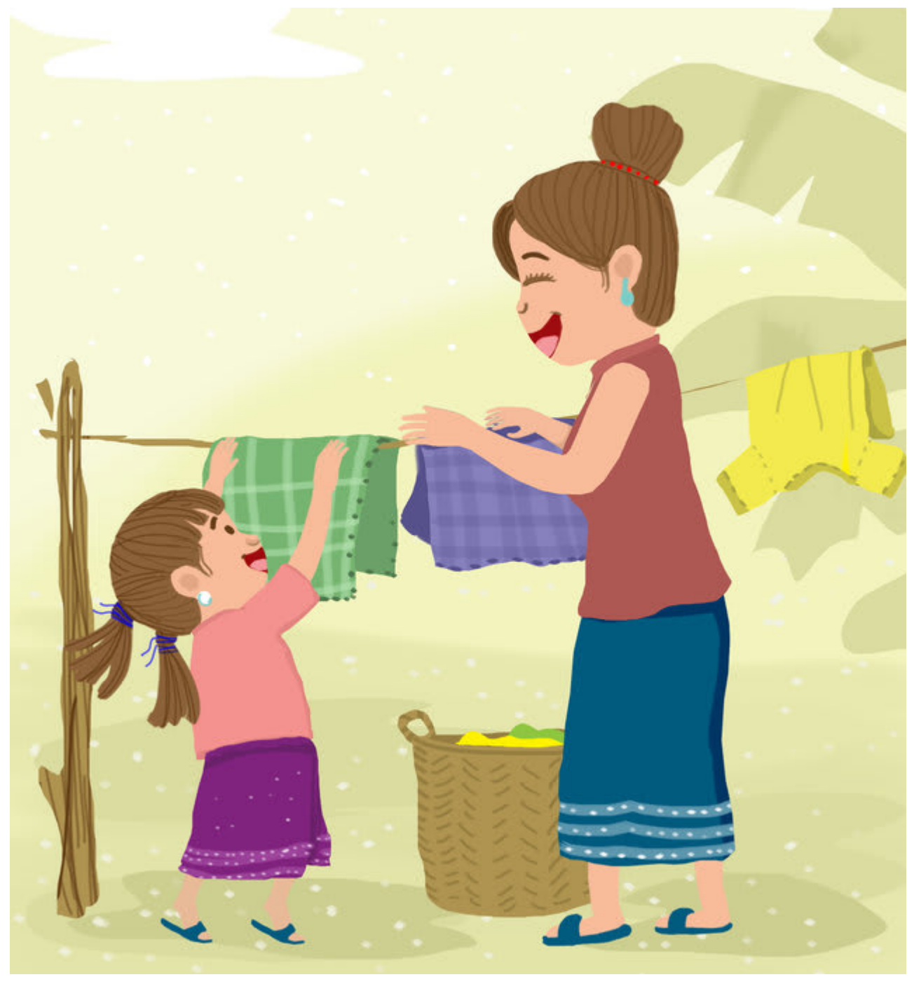
Saat Ibu menjemur pakaian, aku juga belajar menjemurnya.