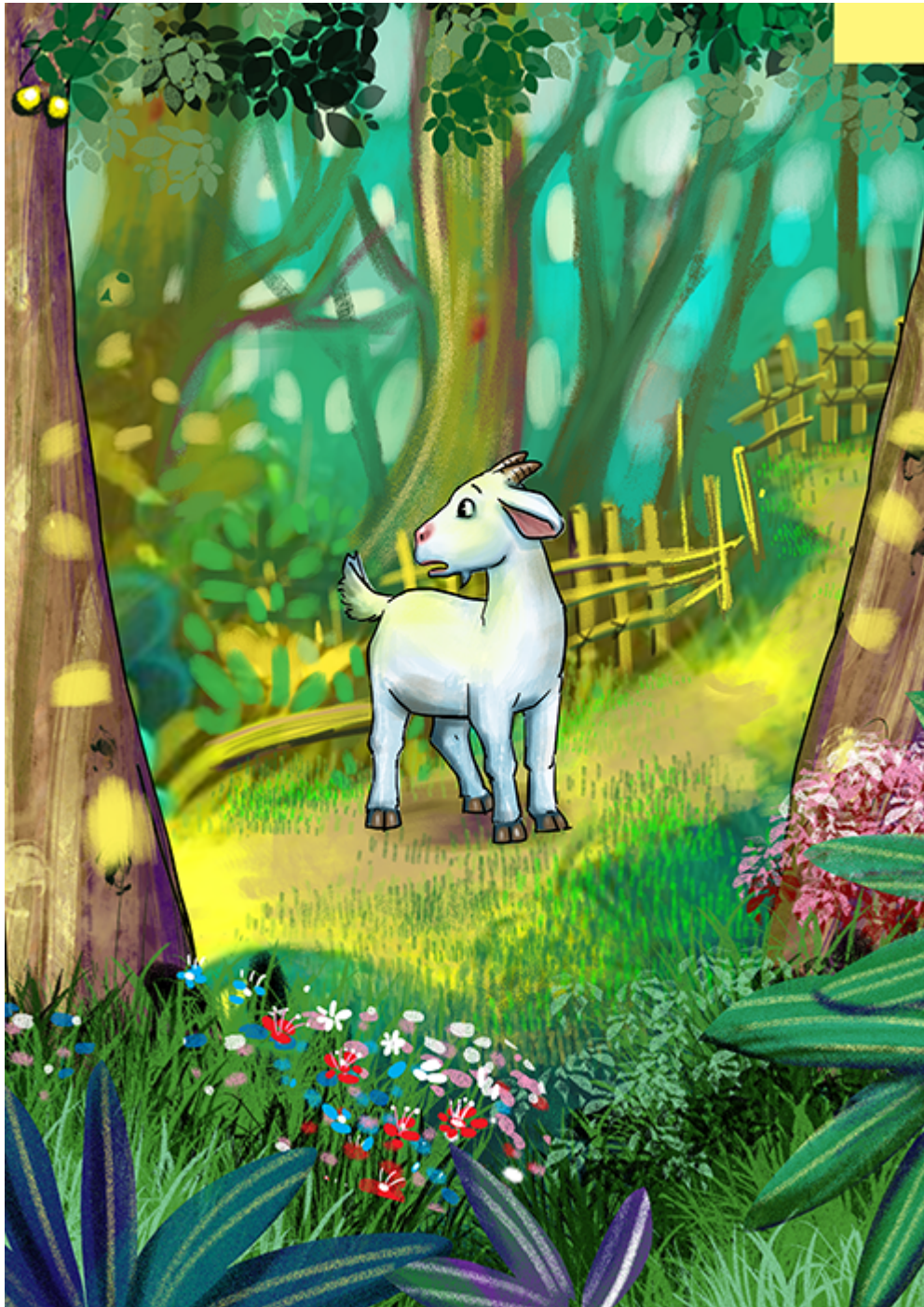
The Little Goat Kaithong Mavongsa