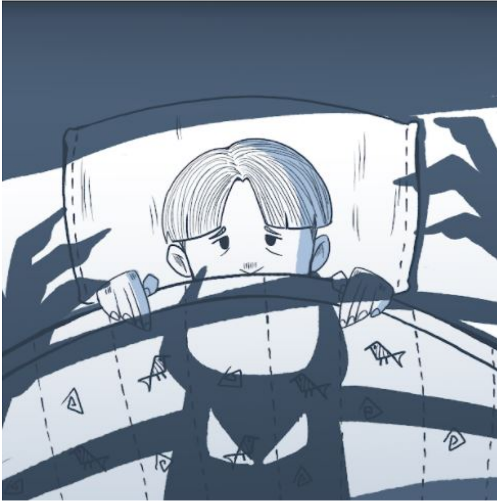
Is That a Ghost? Nurul Ambia Chowdhury