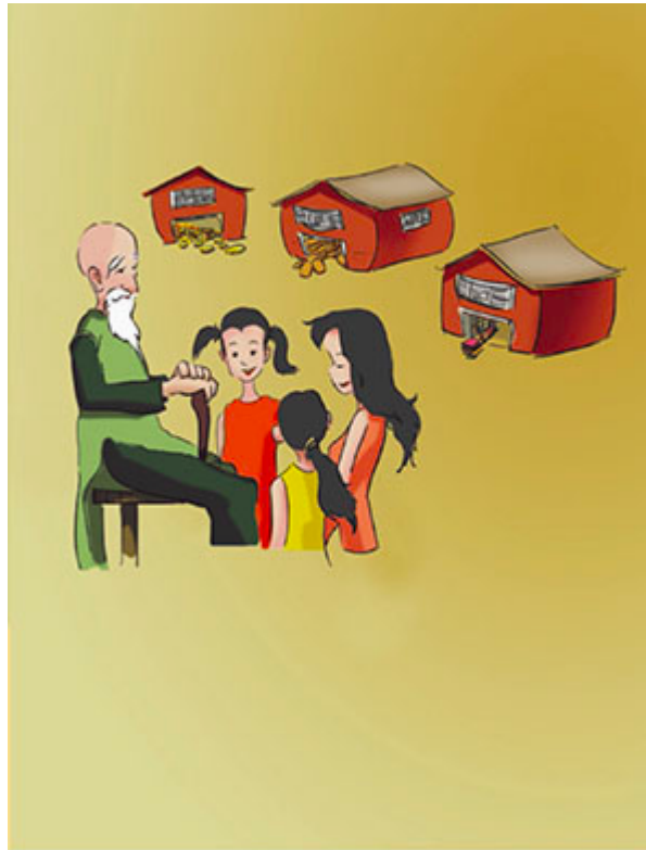
Three Gifts Wong Chew Wee