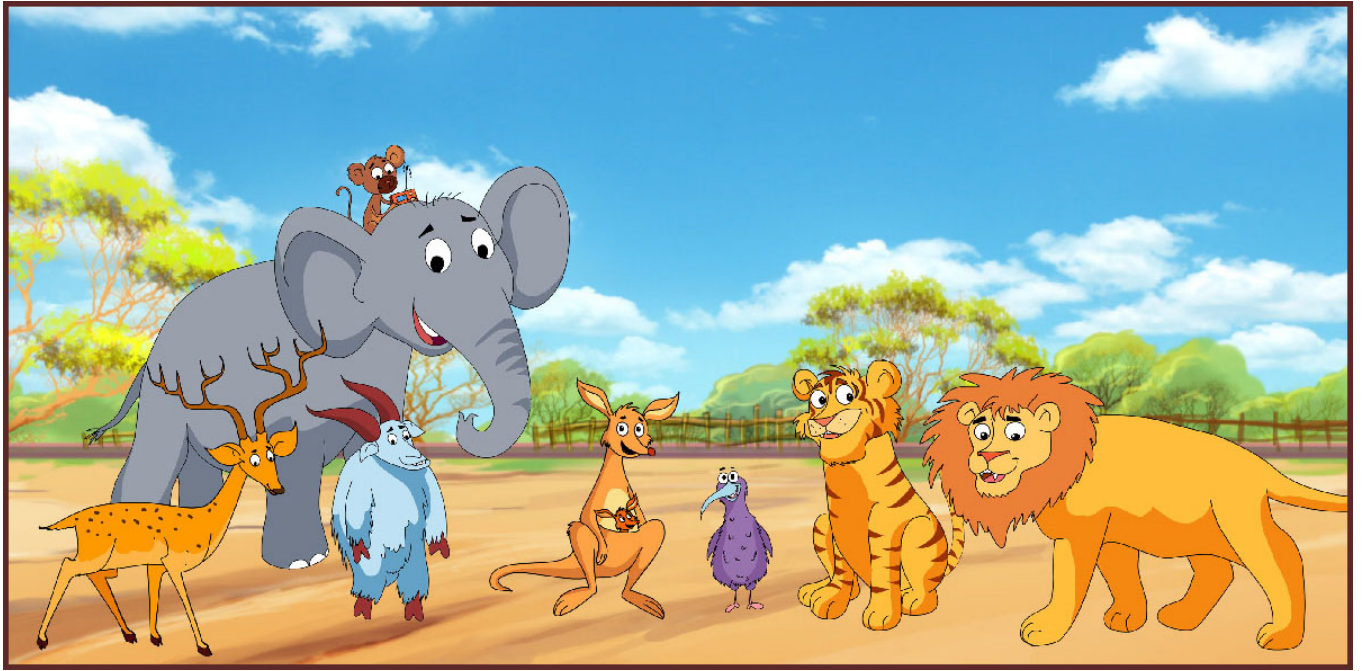
Cricket at the Zoo BookBox