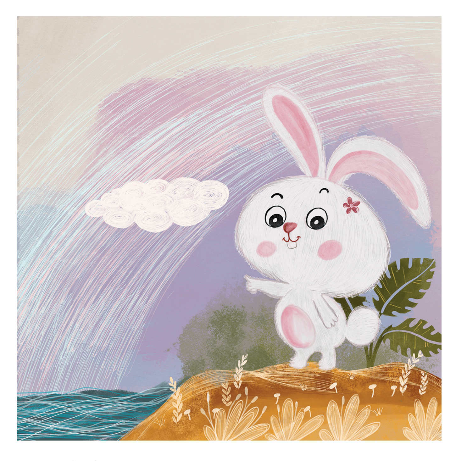
We Are Friends