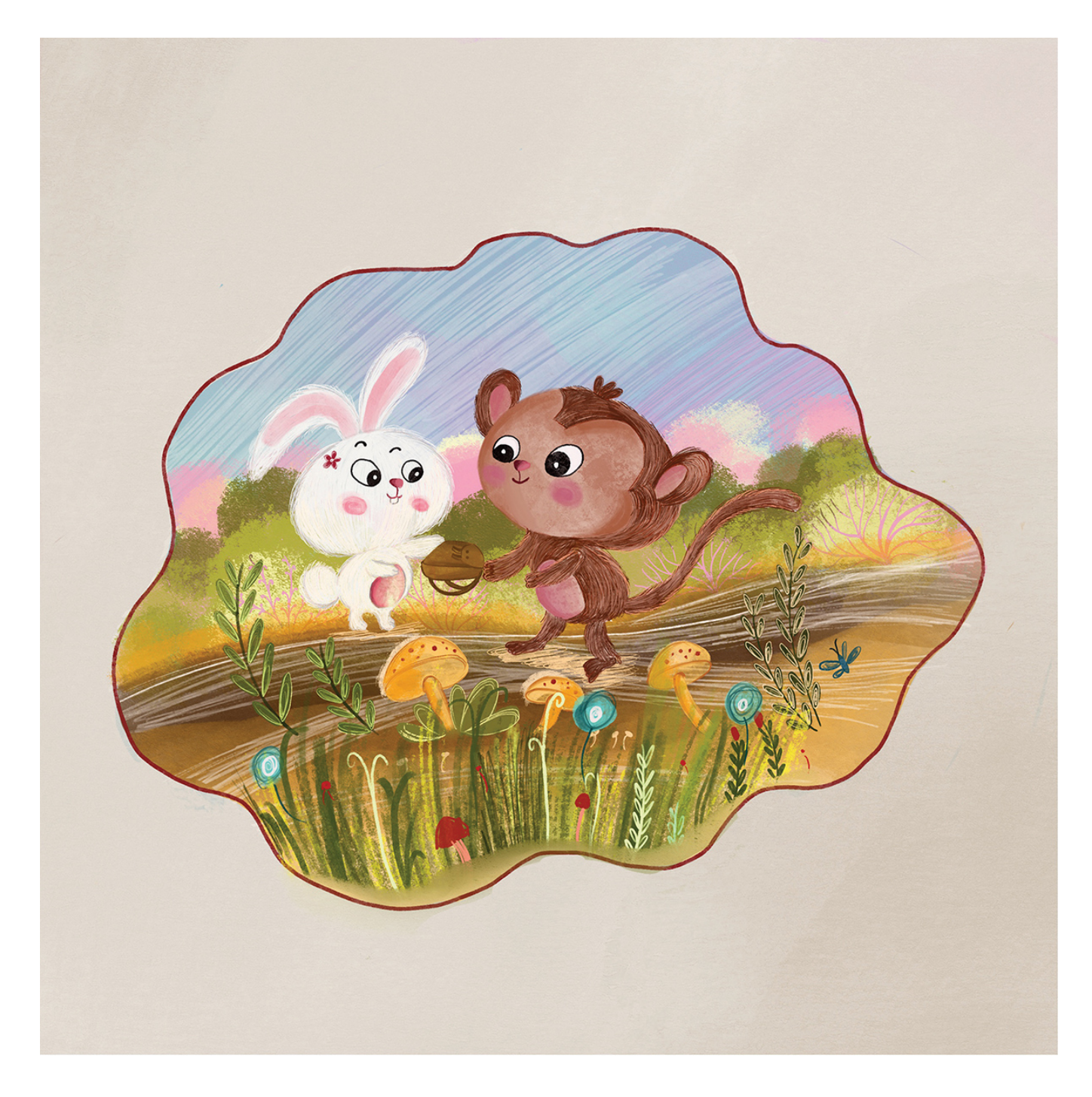
Little Rabbit was so surprised. Baby Monkey helped her even though Little Rabbit never talked to her.