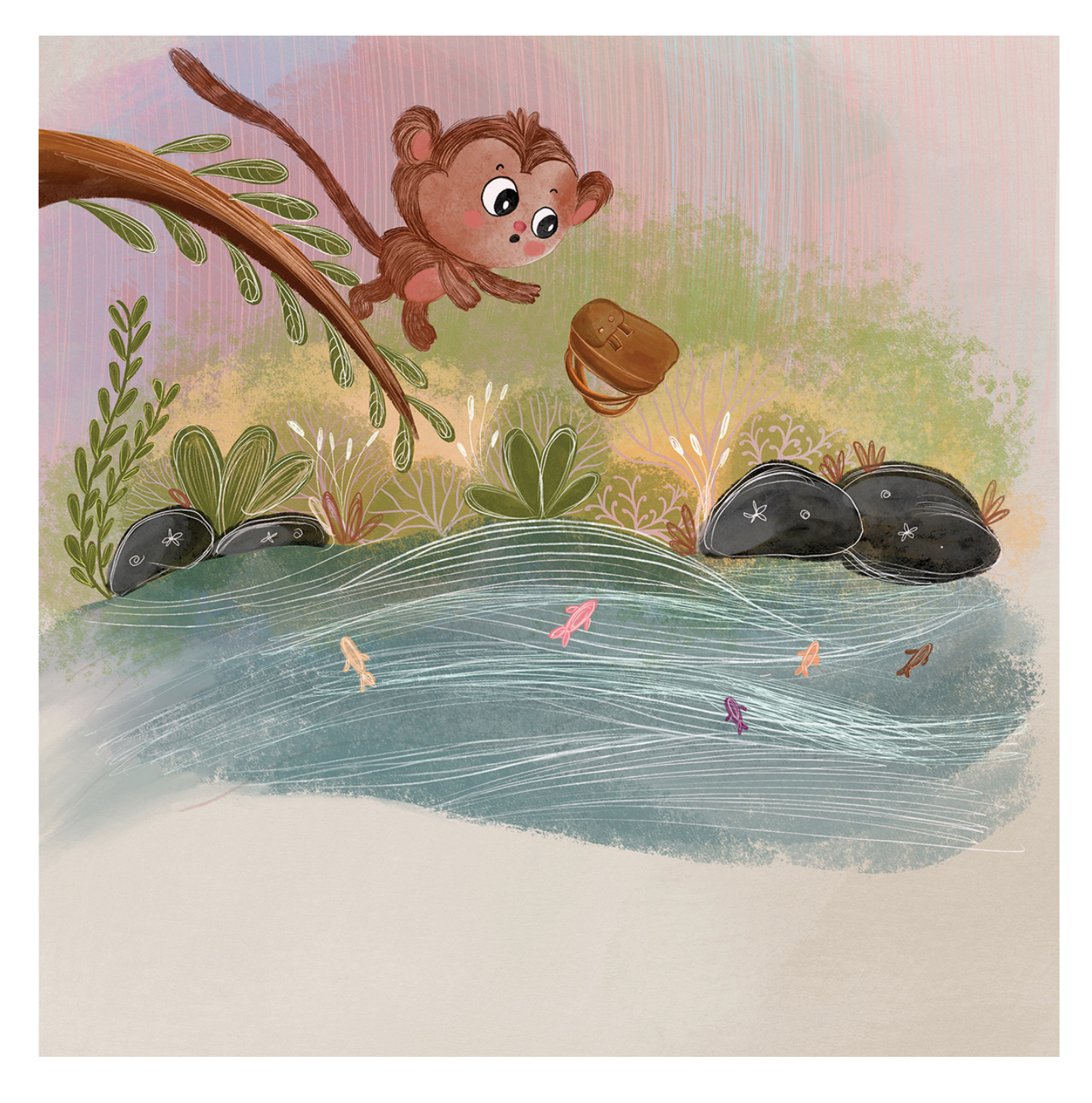
"Here, I caught your school bag that flew away when you fell into the creek," Baby Monkey said, handing Little Rabbit her school bag.