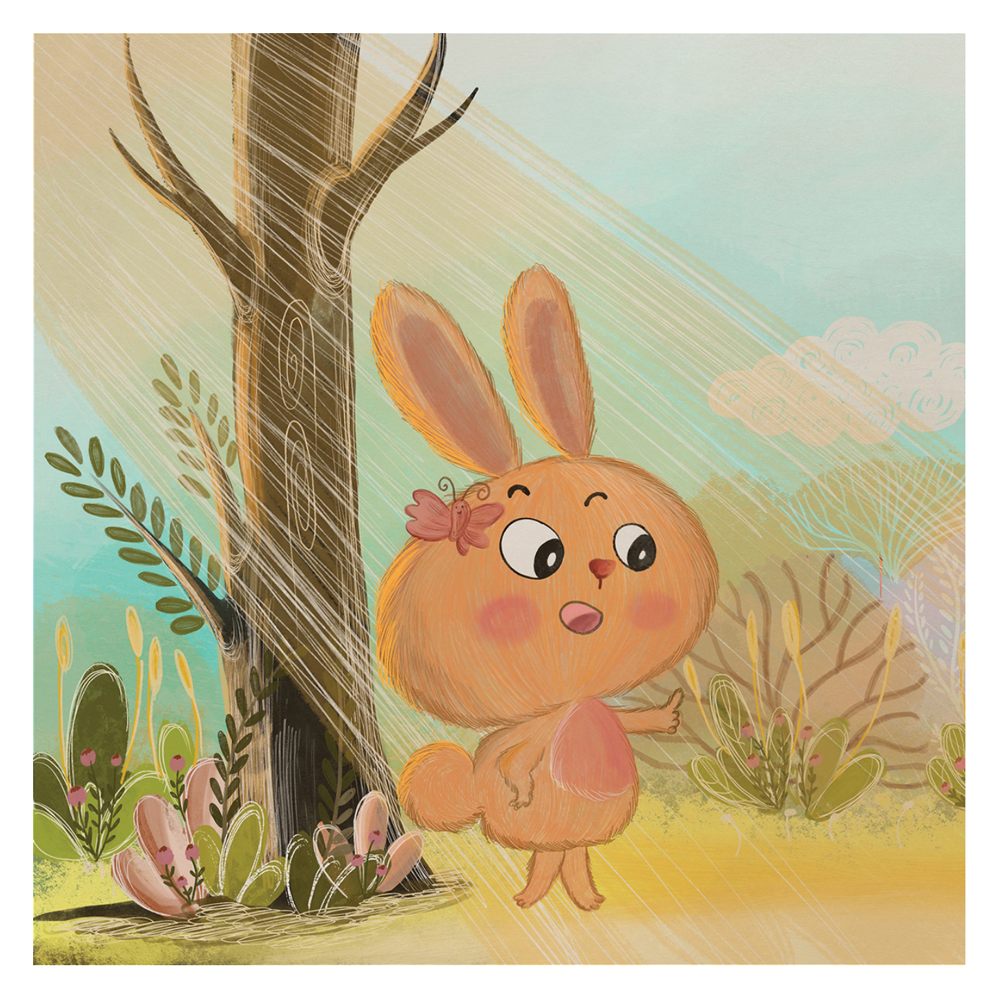
"Not at all. Her voice is annoying. It's really hard to even listen to her," Little Rabbit replied.