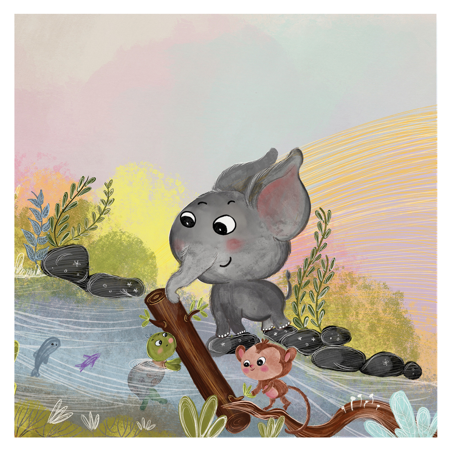
"I didn't even want to talk with you all in the past. But I was wrong, I do need friends. We can all help take care of each other." Little Rabbit told her new friends.