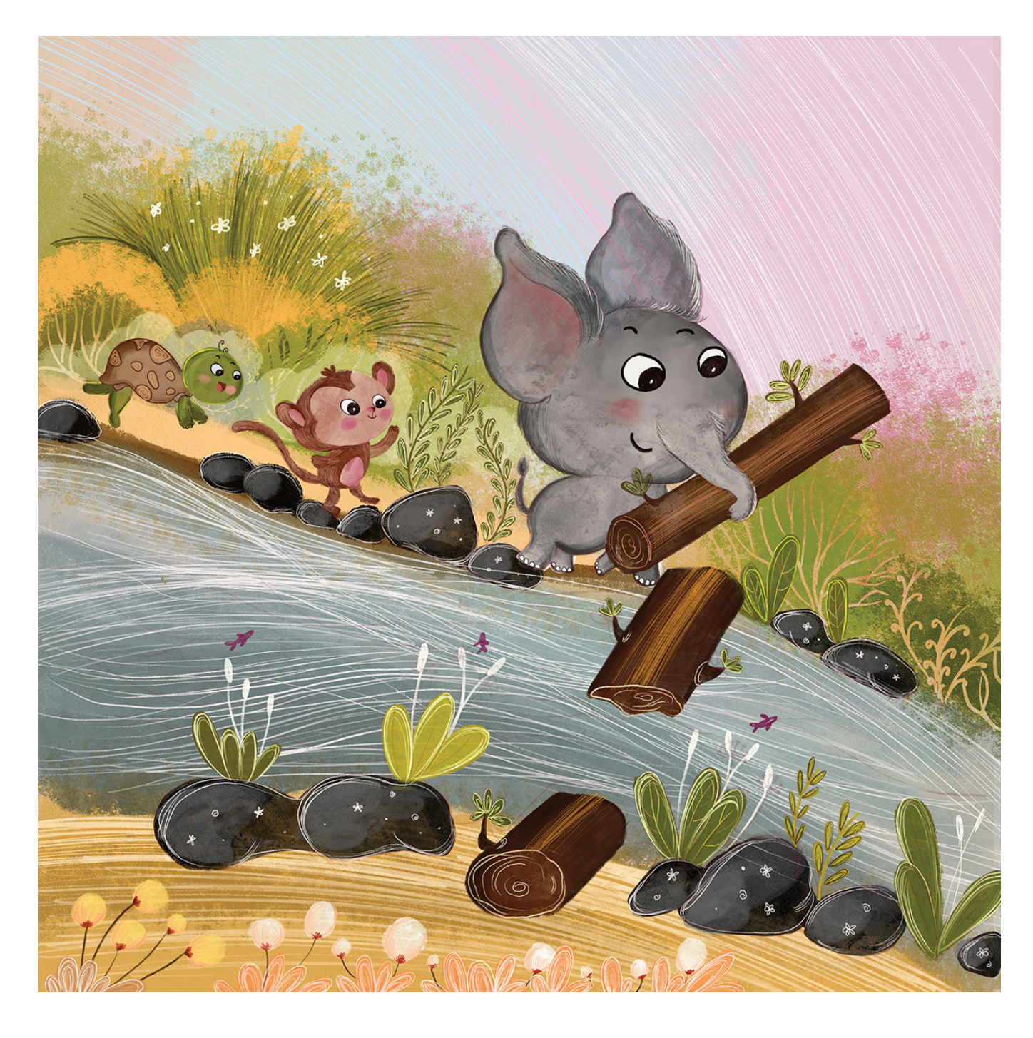
"Baby Elephant is large, which is what makes him very strong. From now on, I won't look down on him. He's my friend too," Little Rabbit thought.