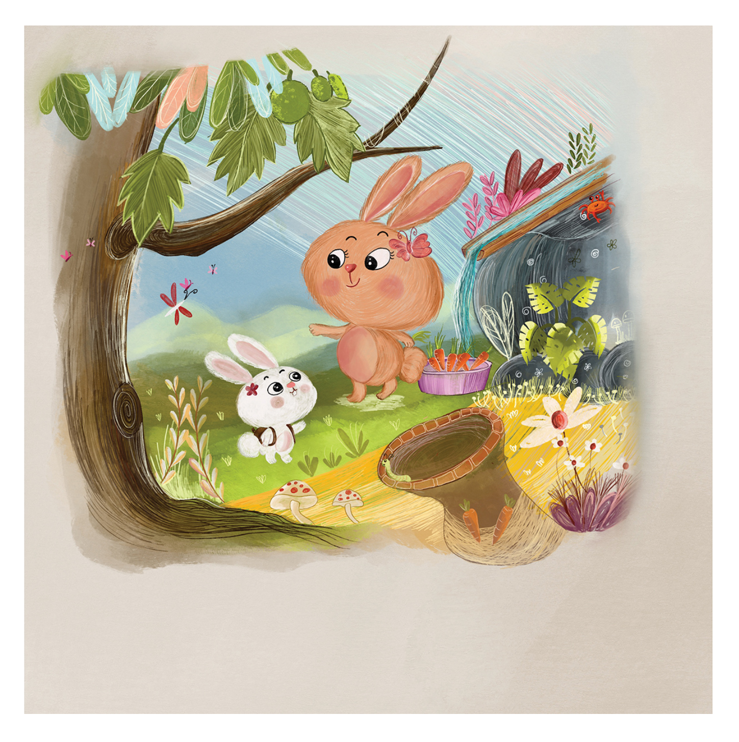
"Little Rabbit, isn't Baby Elephant your friend?" Mother Rabbit asked. "Oh, not at all. He is so large he can crush me under one foot. I don't like him at all," Little Rabbit said, making a face.