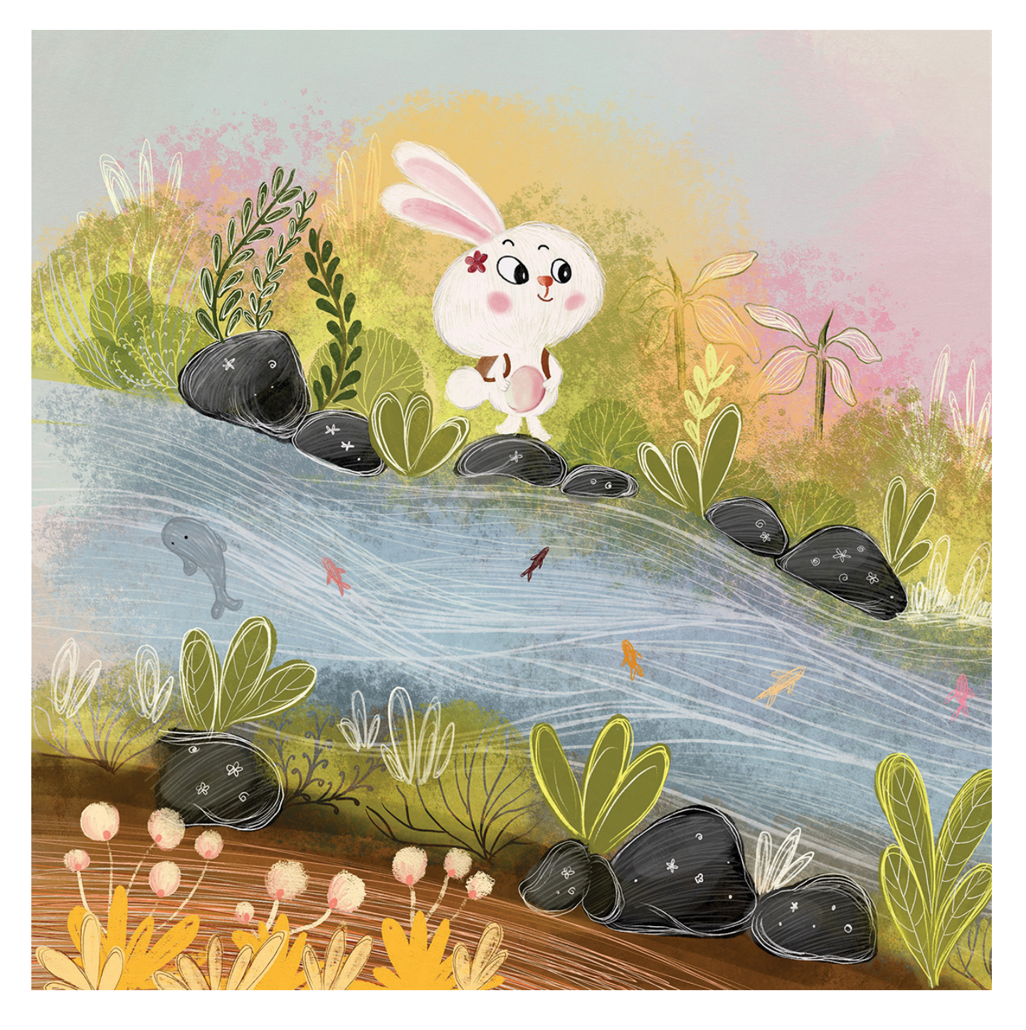
Now, Little Rabbit knew she needed friends, and she hoped she could be theirs.