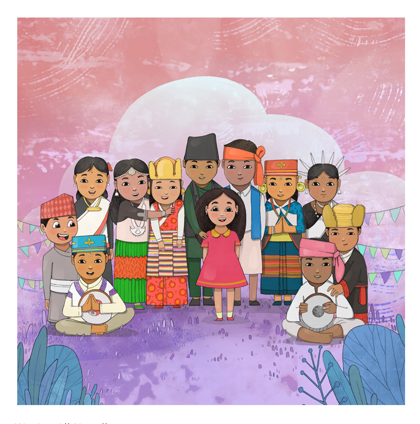
We Are All Nepali Anuradha