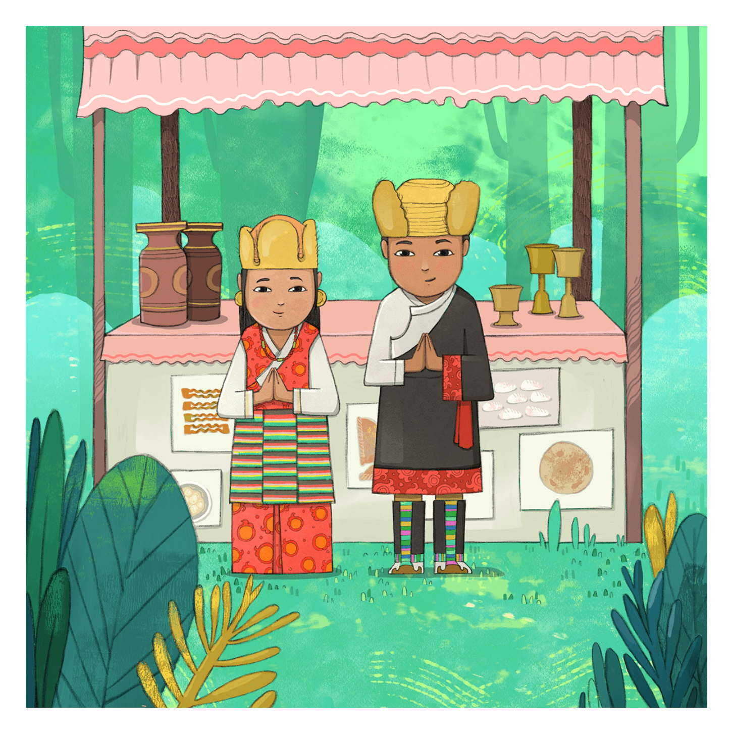
"Tashi Dalek! We are Sherpas. We celebrate Lhosar."