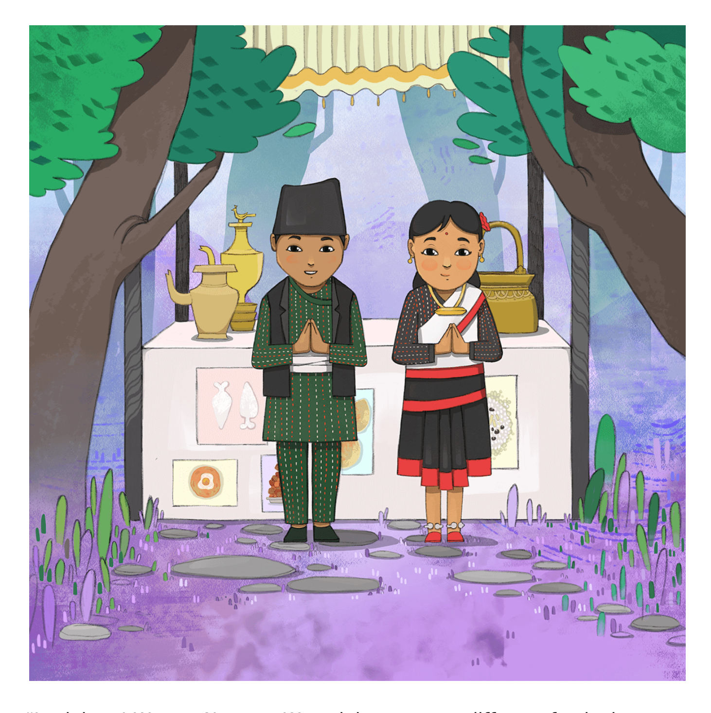
"Jwajalapa! We are Newars. We celebrate many different festivals. Yomari Punhi is one of them."