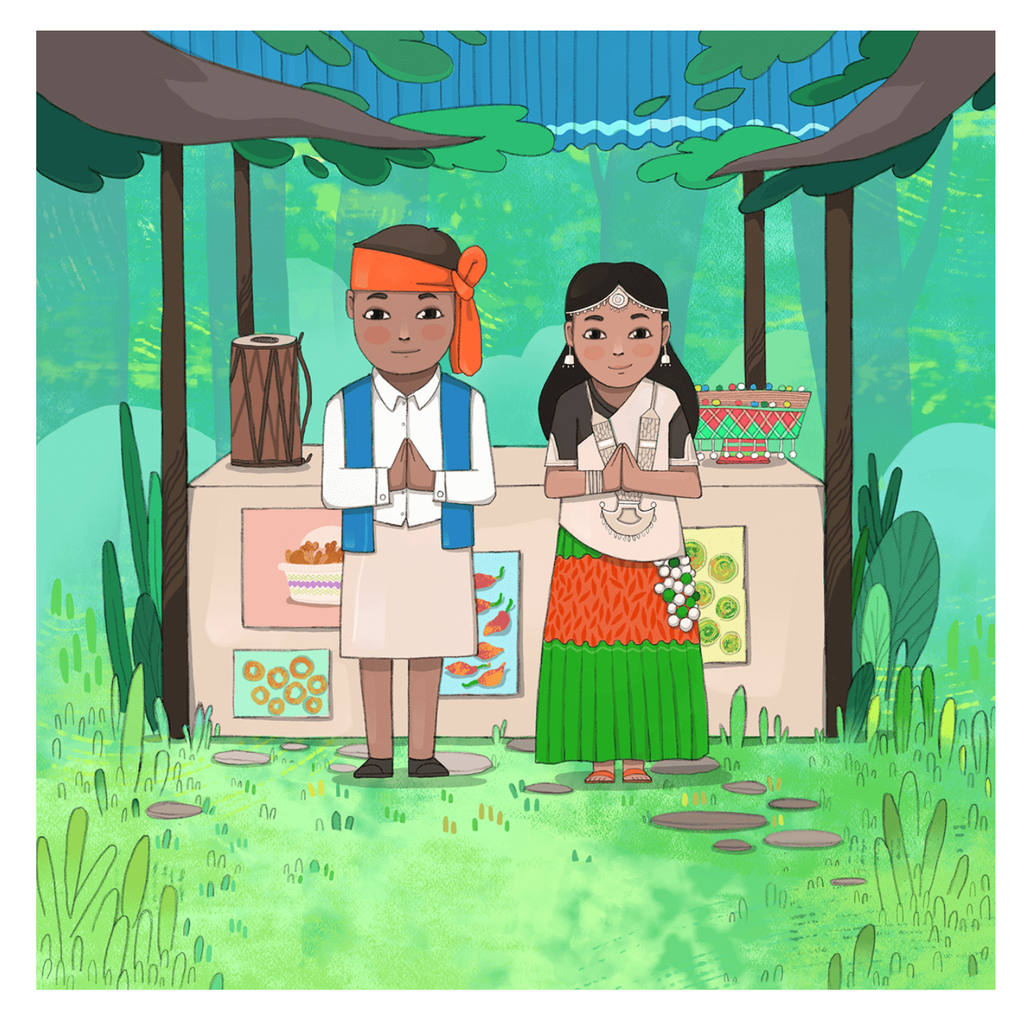
"Pranam! We are Maithils. We also celebrate many different festivals. Chhath is one of them."