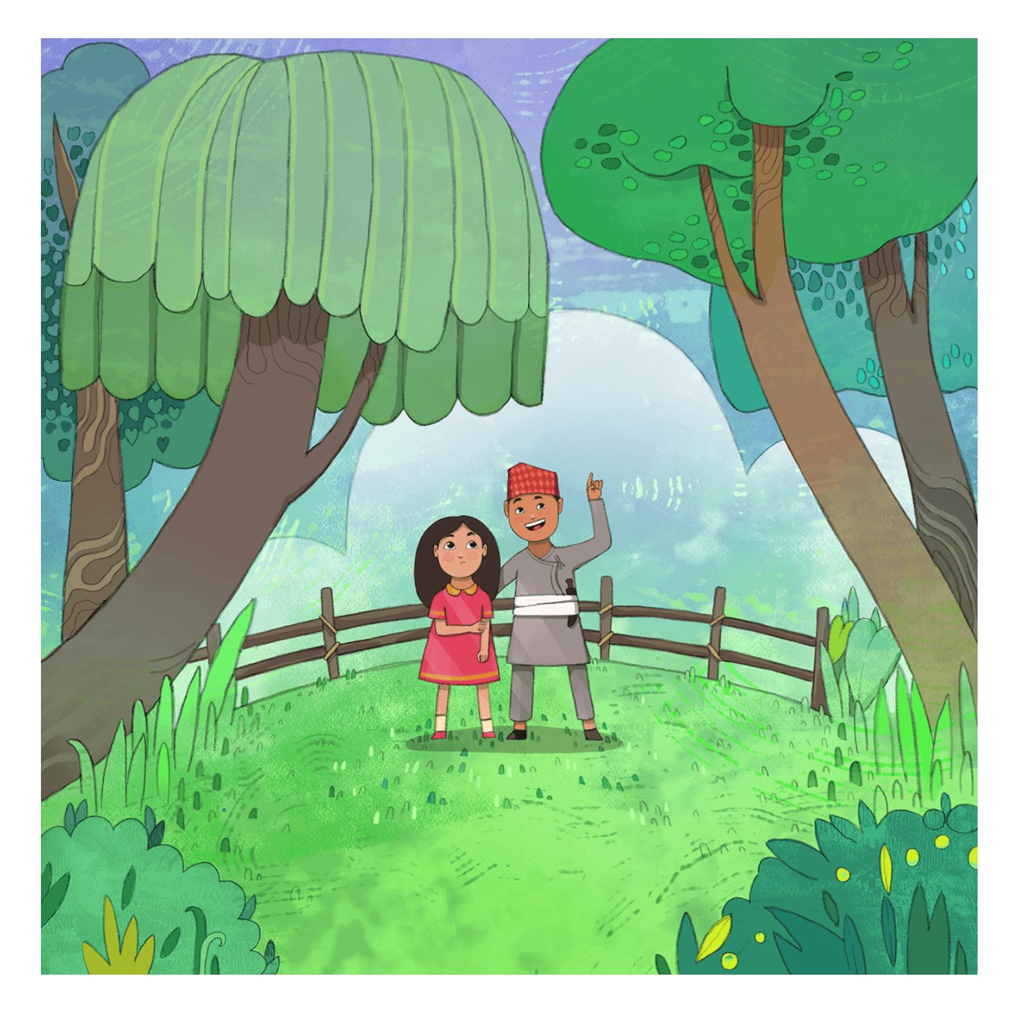
"Would it be good if everybody looked the same? Imagine if all the flowers, animals, trees, and birds looked alike. Just think of it." said Aliza's brother.