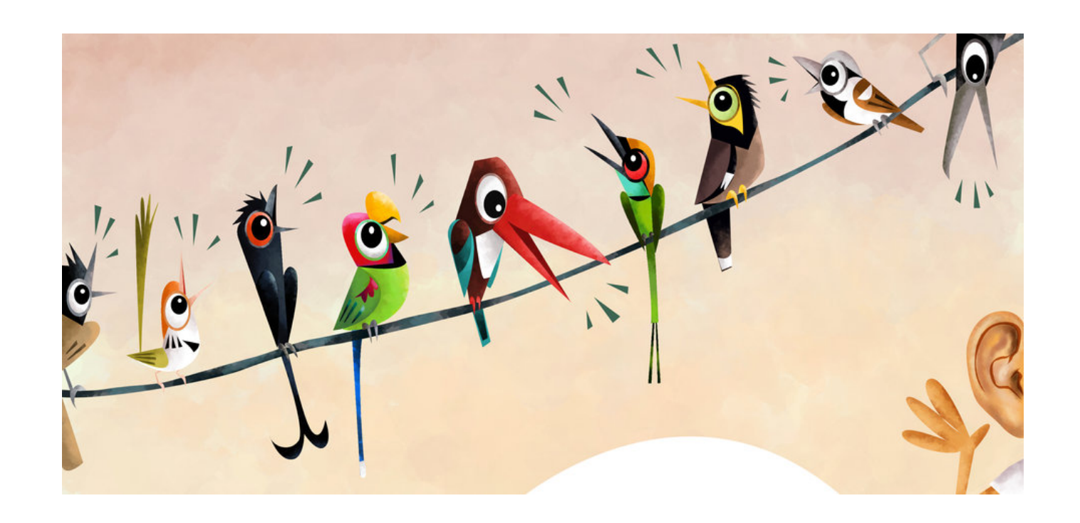
Did You Hear?

Listen carefully and you will find that birds have a lot to say.