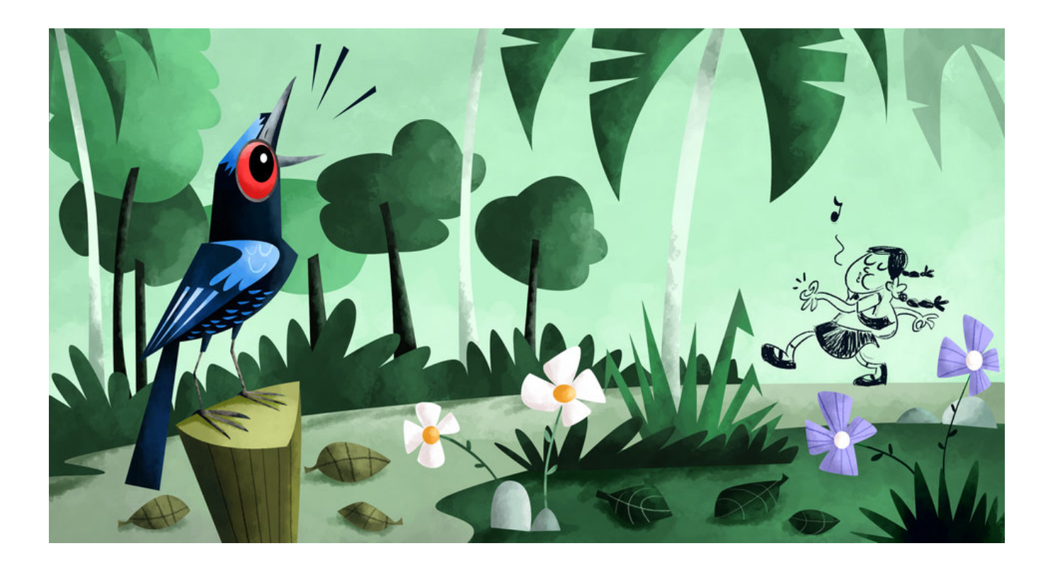
FHWEE! FHWEE! The Malabar whistling thrush whistles like a happy child. FHWEE! FHWEE!