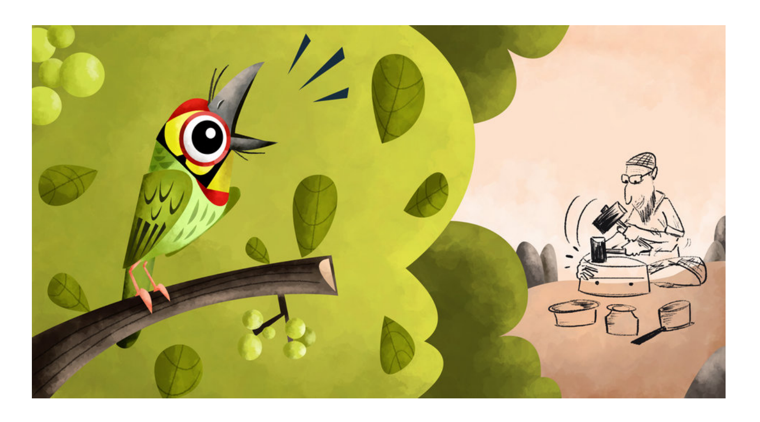
PUK! PUK! PUK! The coppersmith barbet sounds like a hammer striking metal. PUK! PUK! PUK!