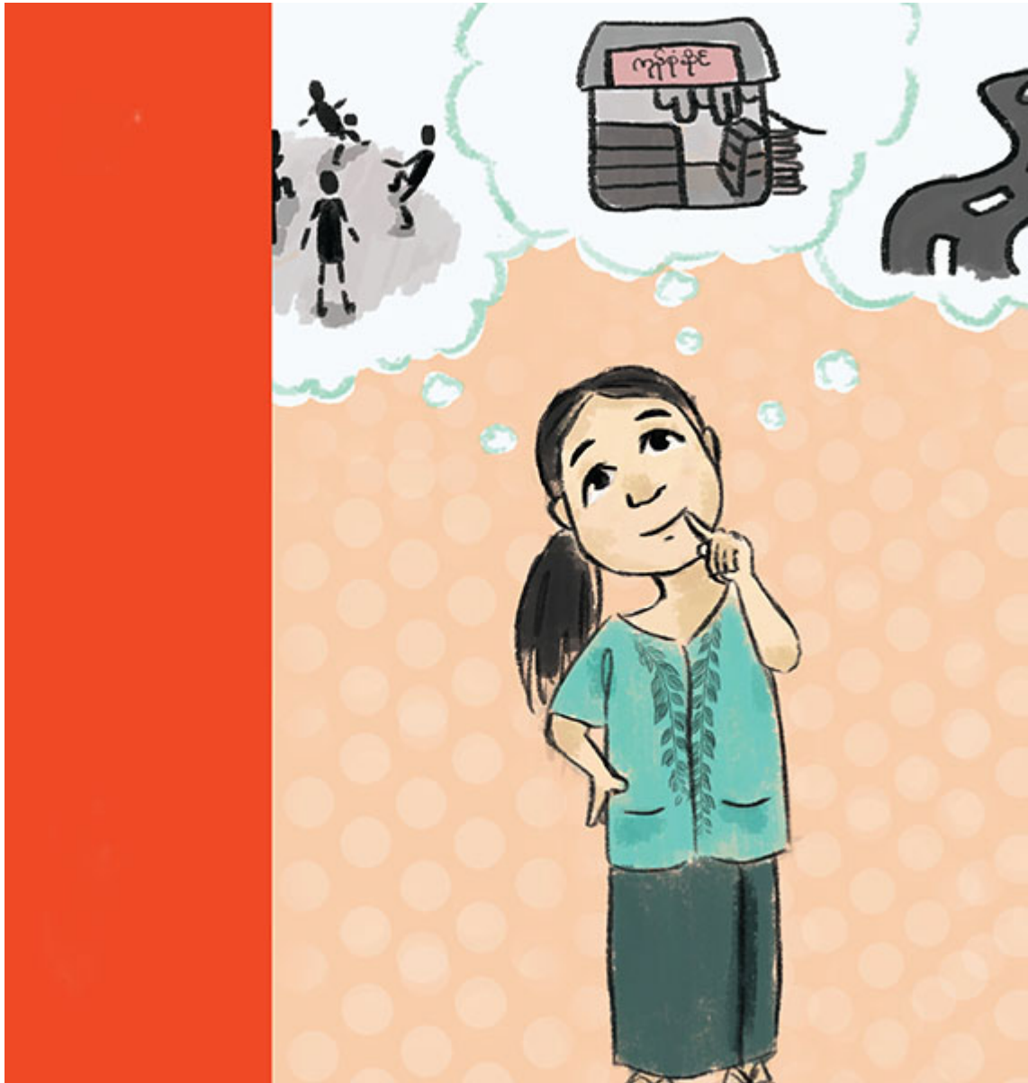
The Village Leader Alyson Curro