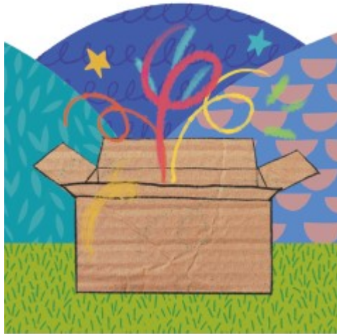
The Box Tania Kliphuis