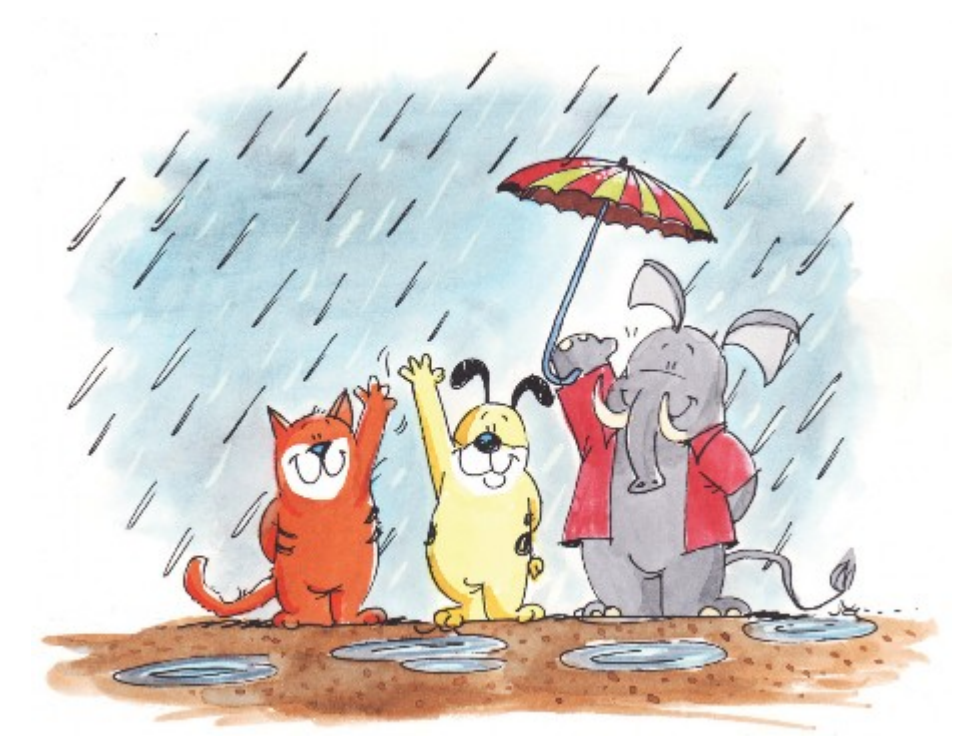
Bye-bye, Cat. Bye-bye, Dog. Bye-bye, Elephant.