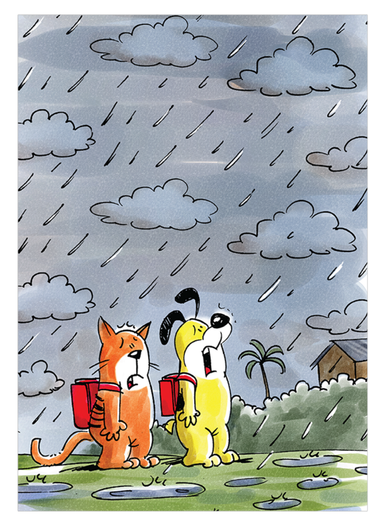
Cat & Dog and the Rain