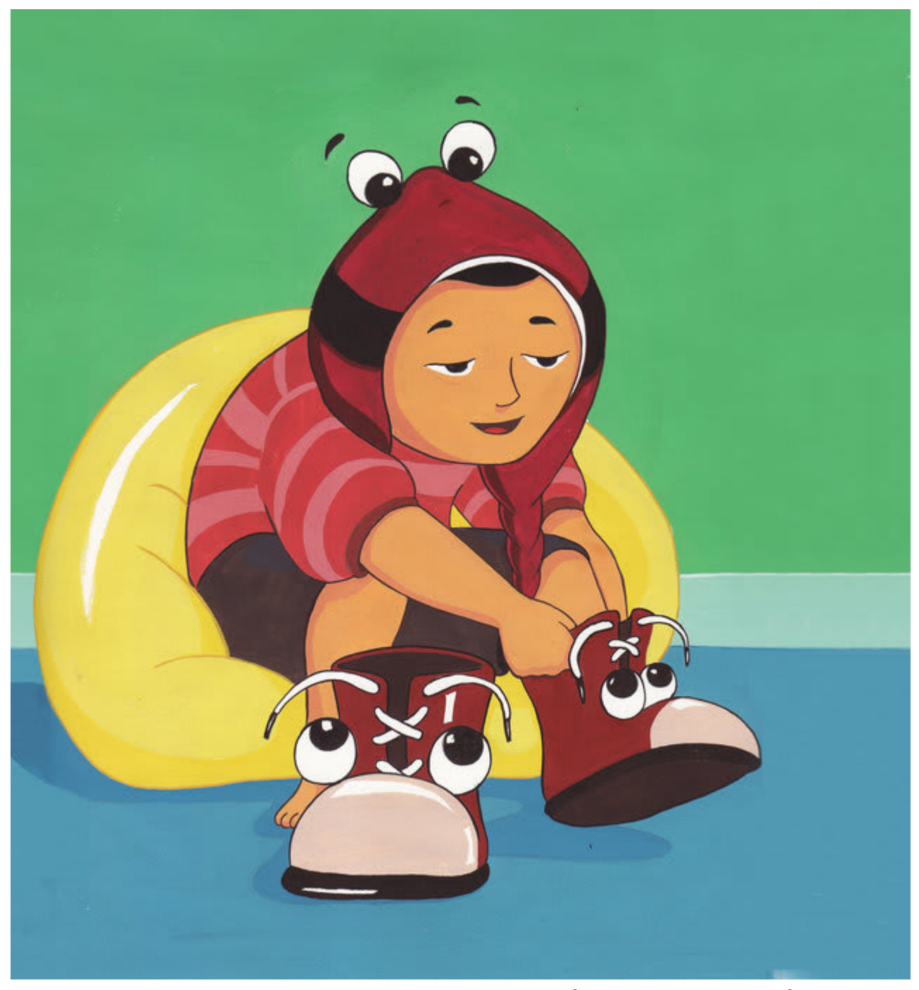
Og til sidst, min ven Sko, som passer godt på mine fødder, så de er sikre og varme.