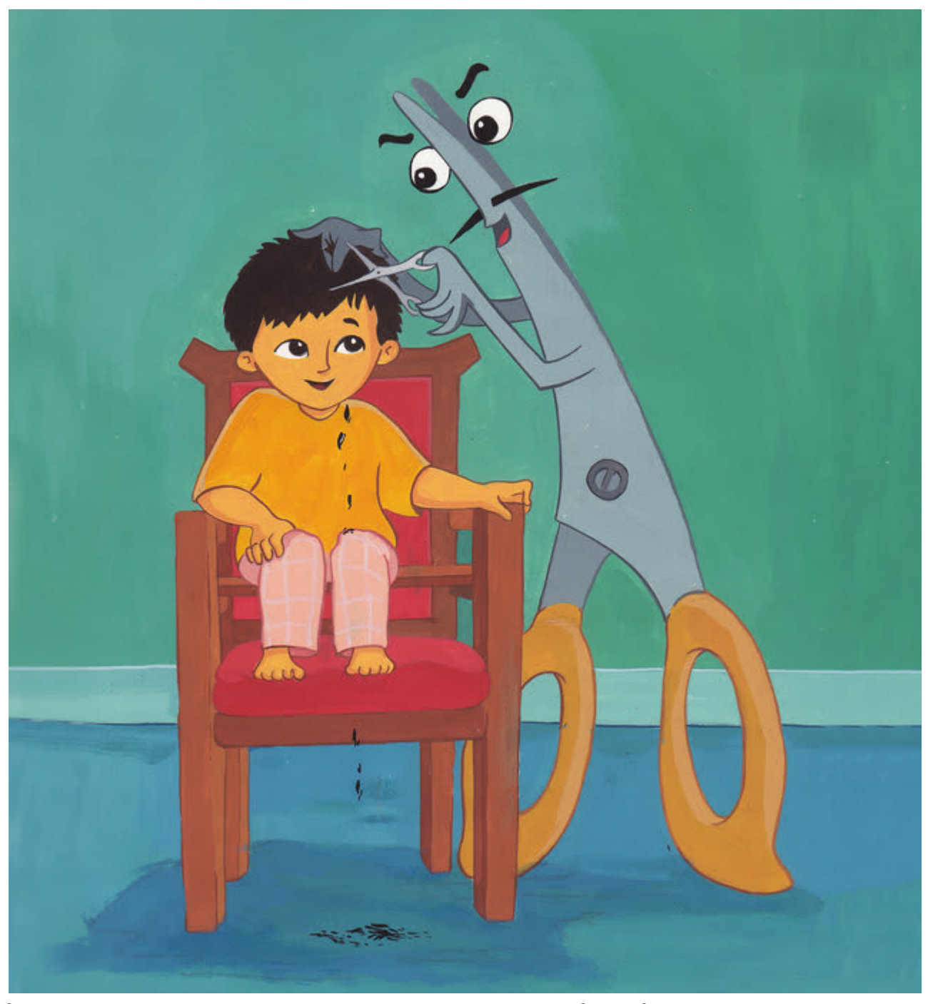
Så kommer min ven Saks, som klipper mit hår, når det er blevet for langt.