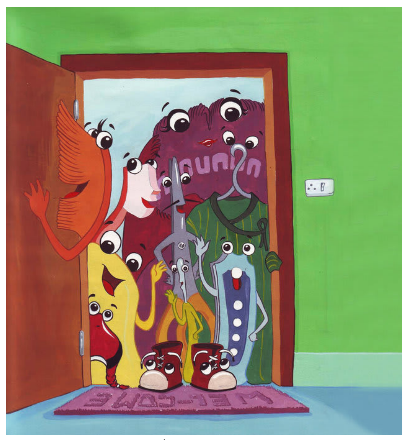
Mine ti venner er der altid, når jeg har brug for dem. Jeg elsker mine ti venner.