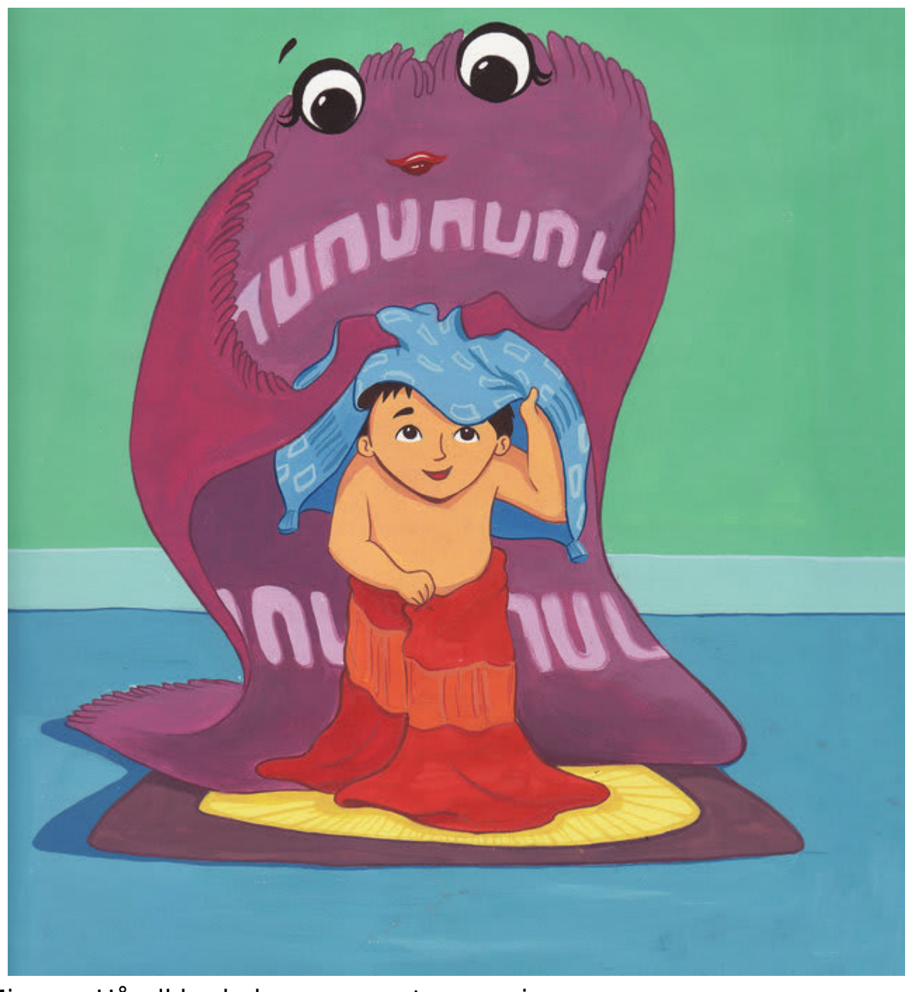
Min ven Håndklæde kommer og tørrer mig.