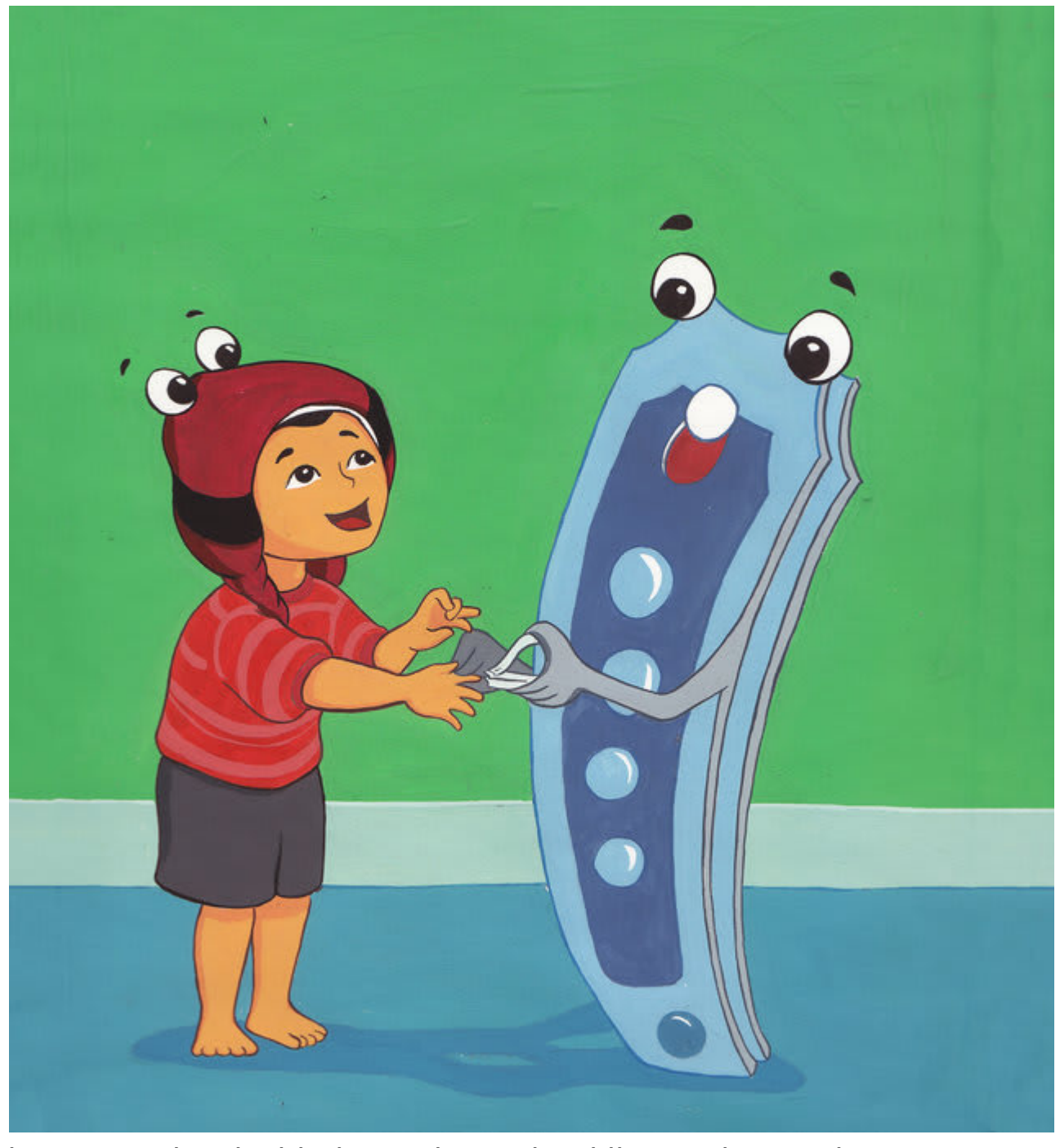
Min ven Neglesaks hjælper mig med at klippe mine negle.