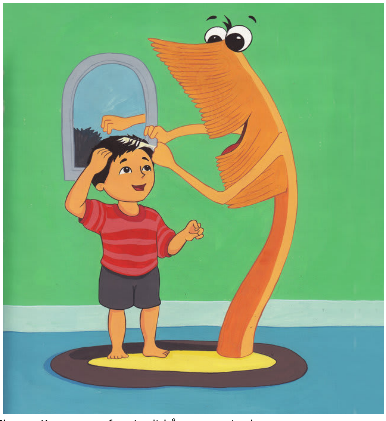
Min ven Kam sørger for at mit hår ser pænt ud.