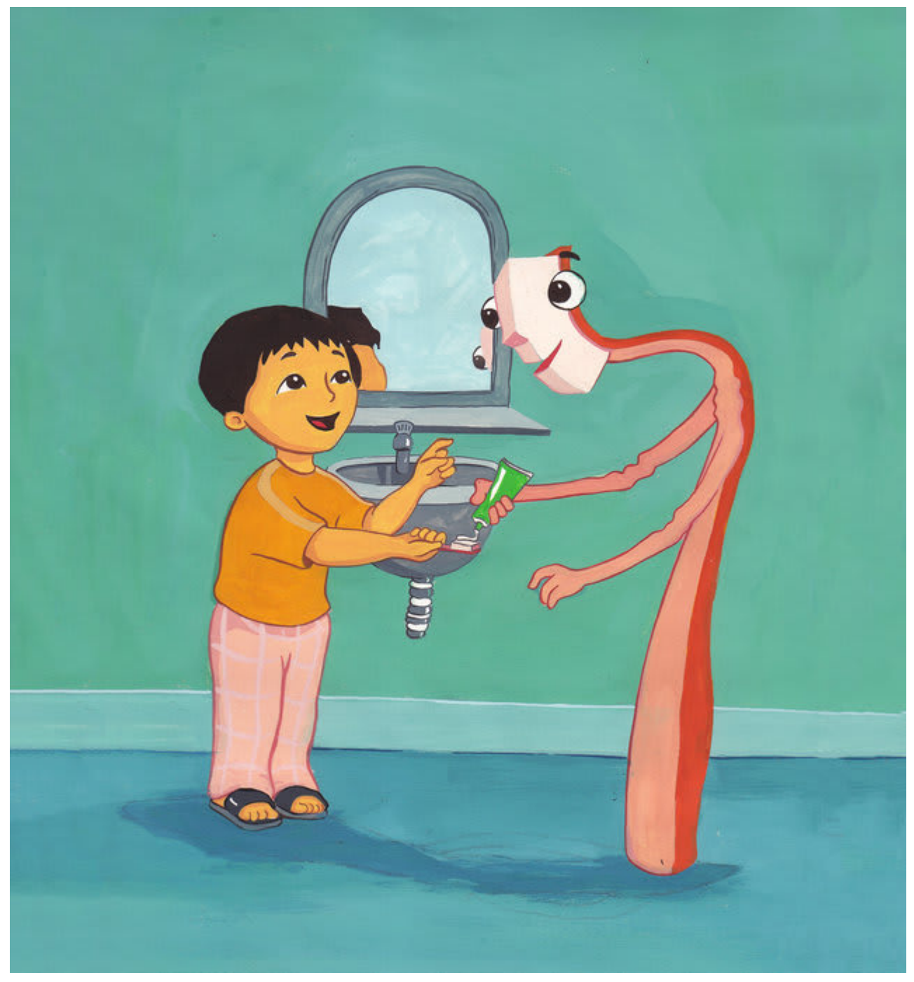
Jeg har ti venner, som hjælper mig med at blive klar om morgenen. Først min ven Tandbørste, som børster mine tænder og holder dem rene.