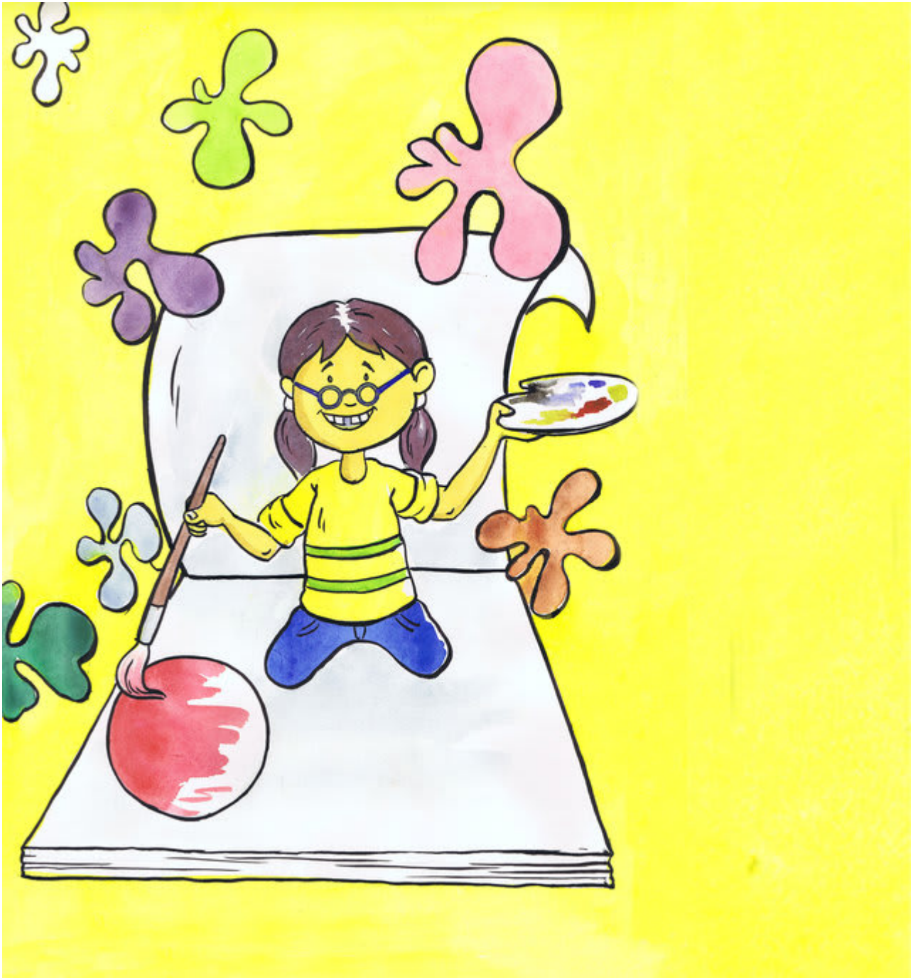
Rajani begynder at male.