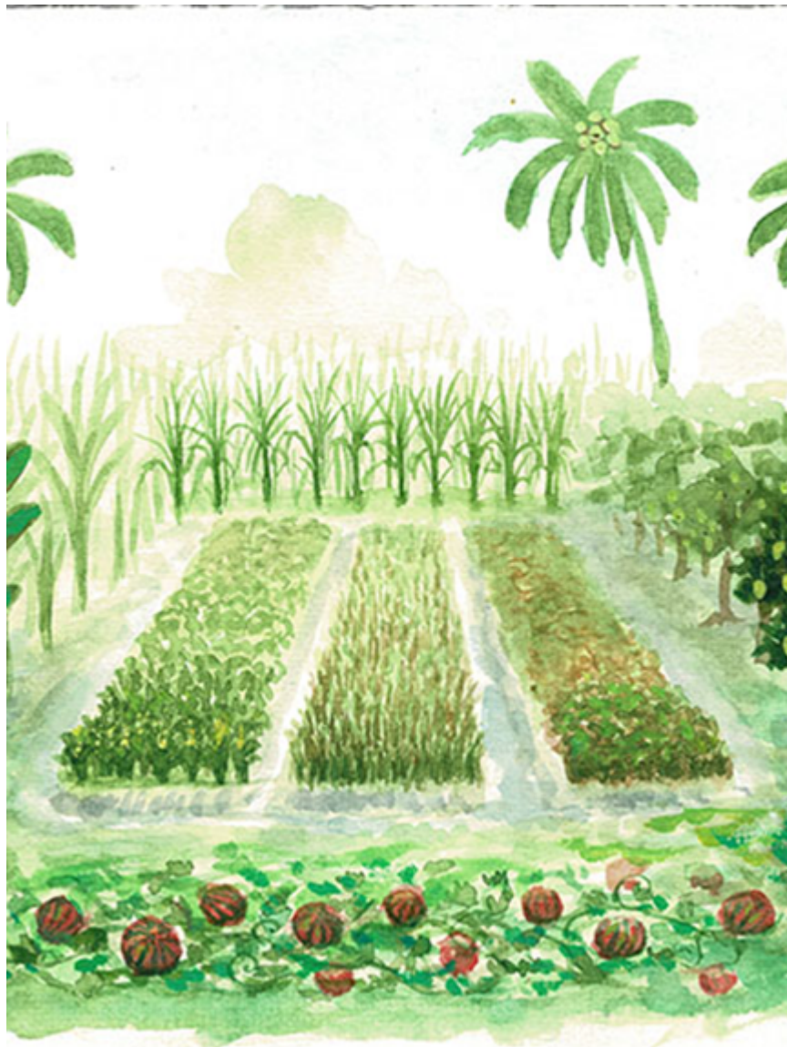
Fruits and Vegetables ນ. ສຸກພະຈັນ ໄຊເສນາ