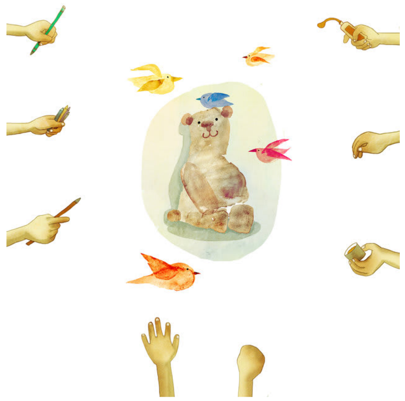
Tèo êmuh: - Adôk k[ah sa boh [atô mdia\ng drei nao ]hưn ju\m dar war hlô mnơ\ng. Mâo hlei pô ]ia\ng ]ih rup ho\ng kâo mơ\?