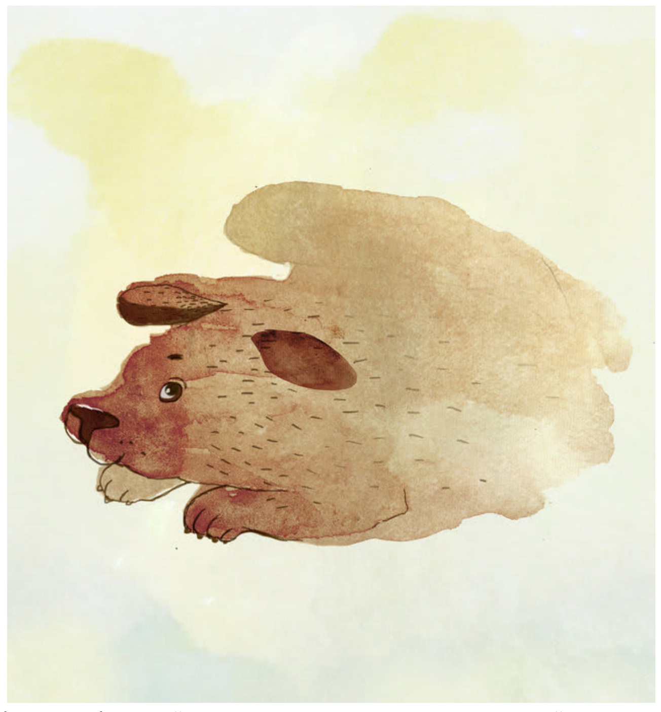
Tèo tlao [u\` leh anăn tak thia\m du\m bi ad^t gru ju\ju\. Dlăng dih! Anăn jing sa drei êđai asâo siam s^n!