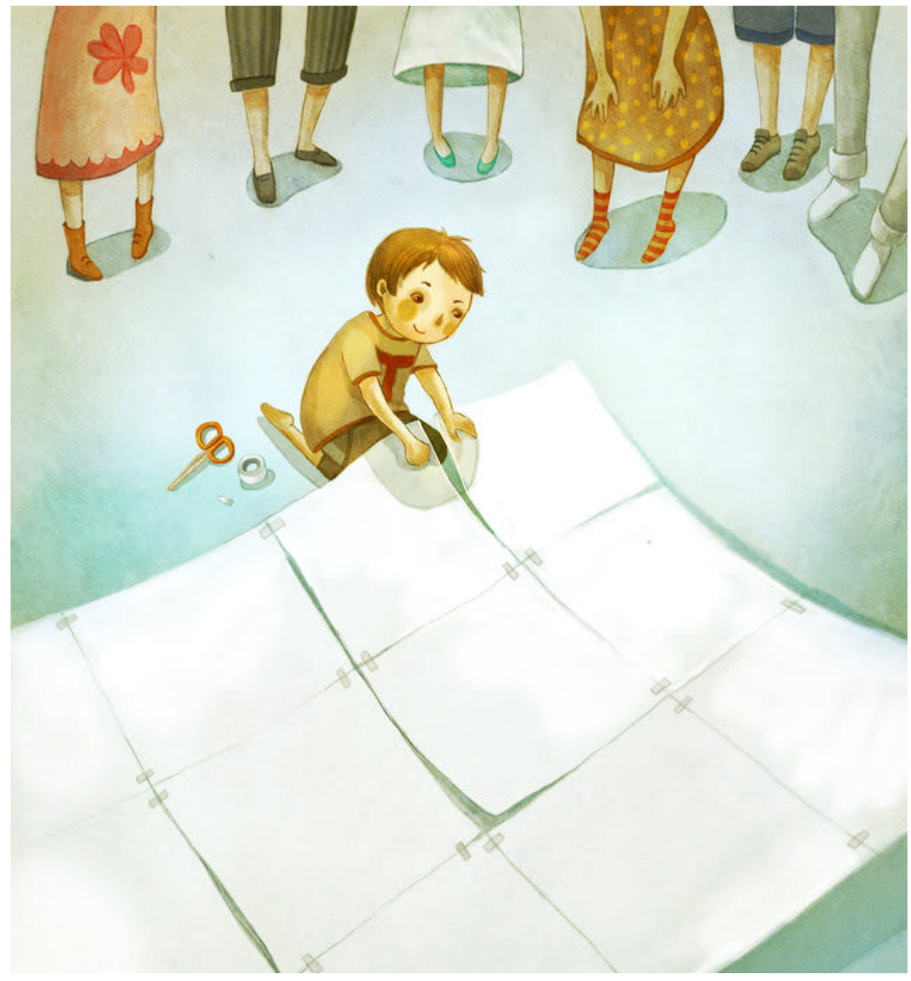
Tèo bi m^n [uh klei ]ih rup!