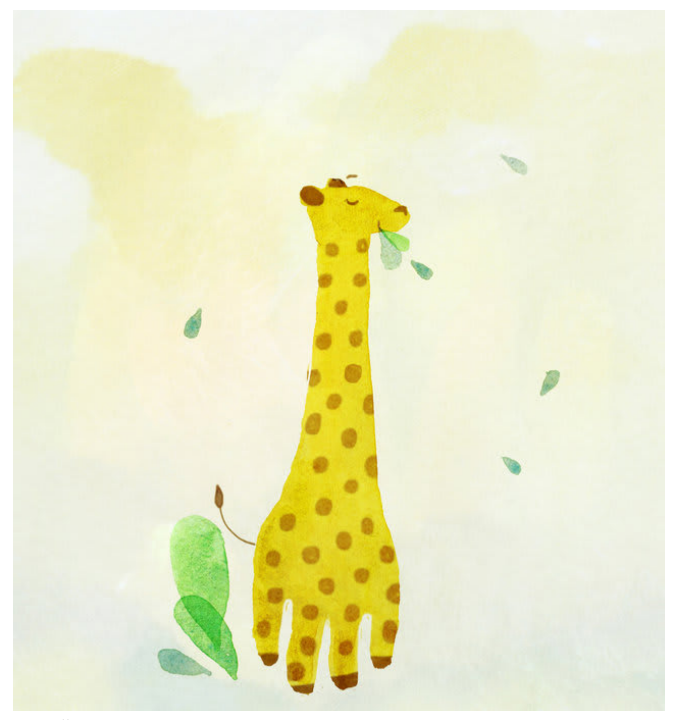
Leh anăn tak thia\m du\m bi ad^t gru hrah hrah. Dlăng dih, sa drei r^ răn kkuê dlông!