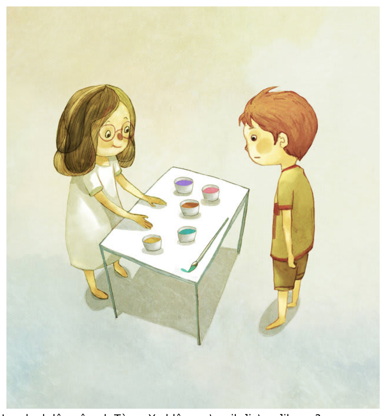
Hoa duah lông êmuh Tèo: - Ya hlô mnơ\ng ih ]ia\ng ]ih rup? Tèo la]: - Kâo ]ia\ng ]ih rup jih jang hlô mnơ\ng!