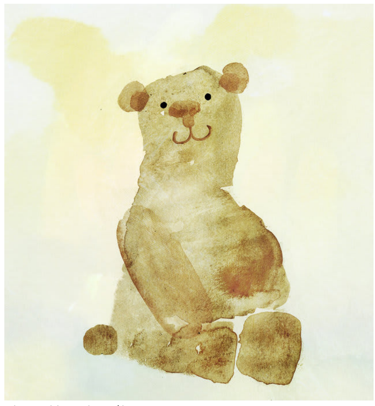
Go\lo\tur thia\m du\m êlan. Tloh ênoh êdi! Sa drei kgâo siam s^n!