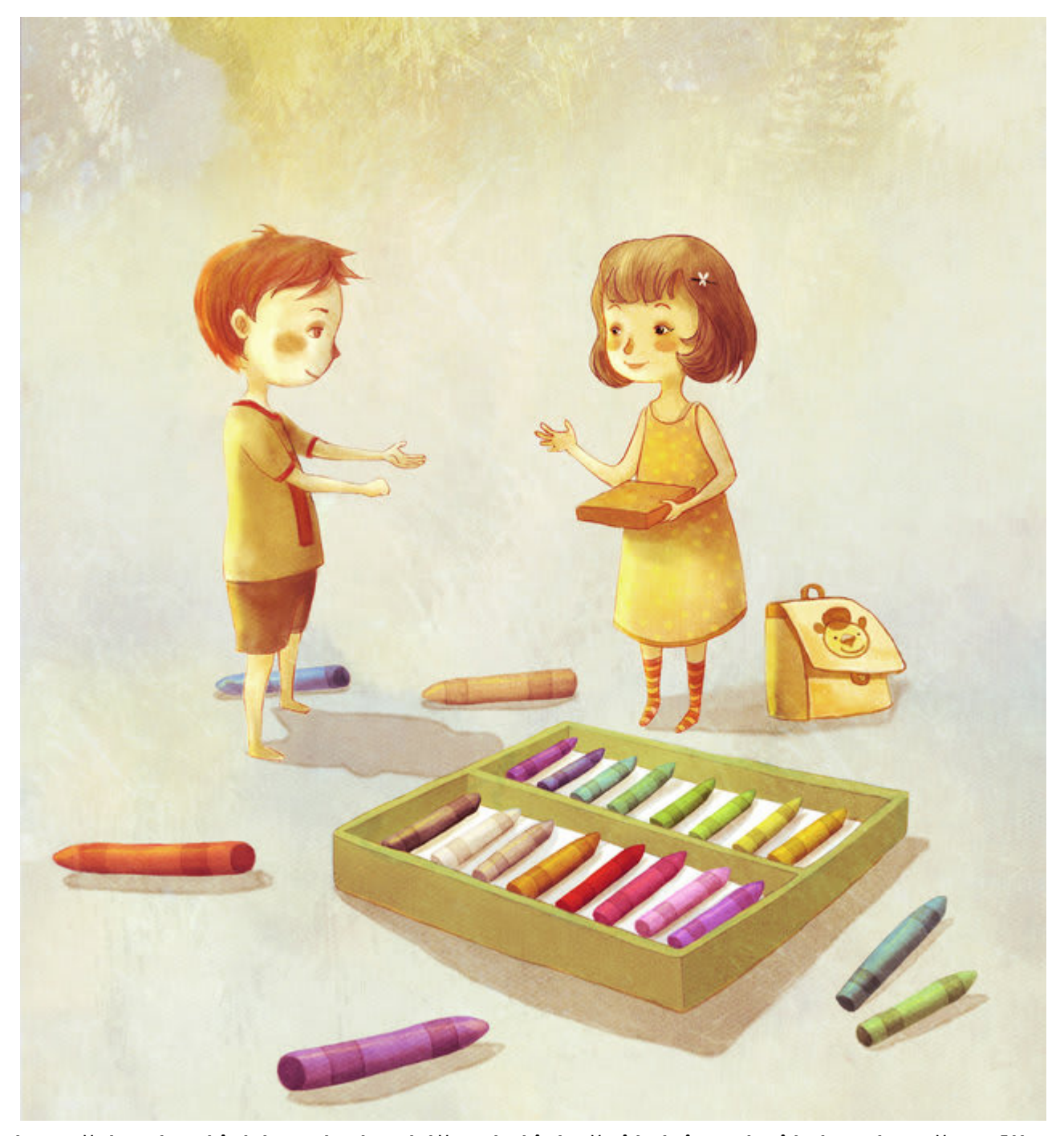
Bin mă hruh giê hl^n kulơr hlăm kdô hră êjai êmuh êjai: - Ih srăng ]ih rup ho\ng