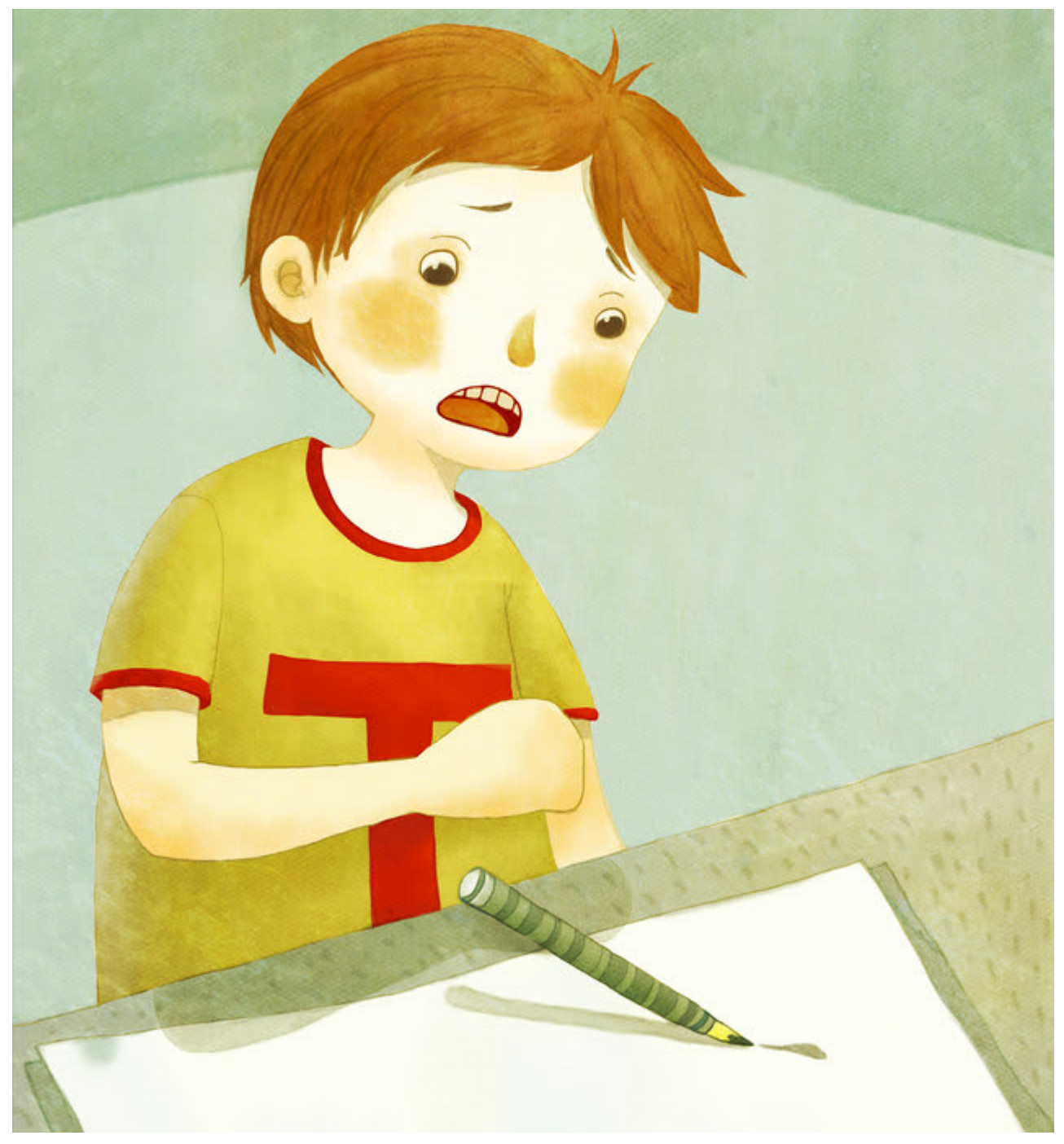
{ia\dah Tèo amâo thâo djă giê knih ho\ng kngan hnua\kyua dah plă kngan anei amâo mâo kđiêng ôh. Giê knih ]ih rup kpluôt nanao yơh.