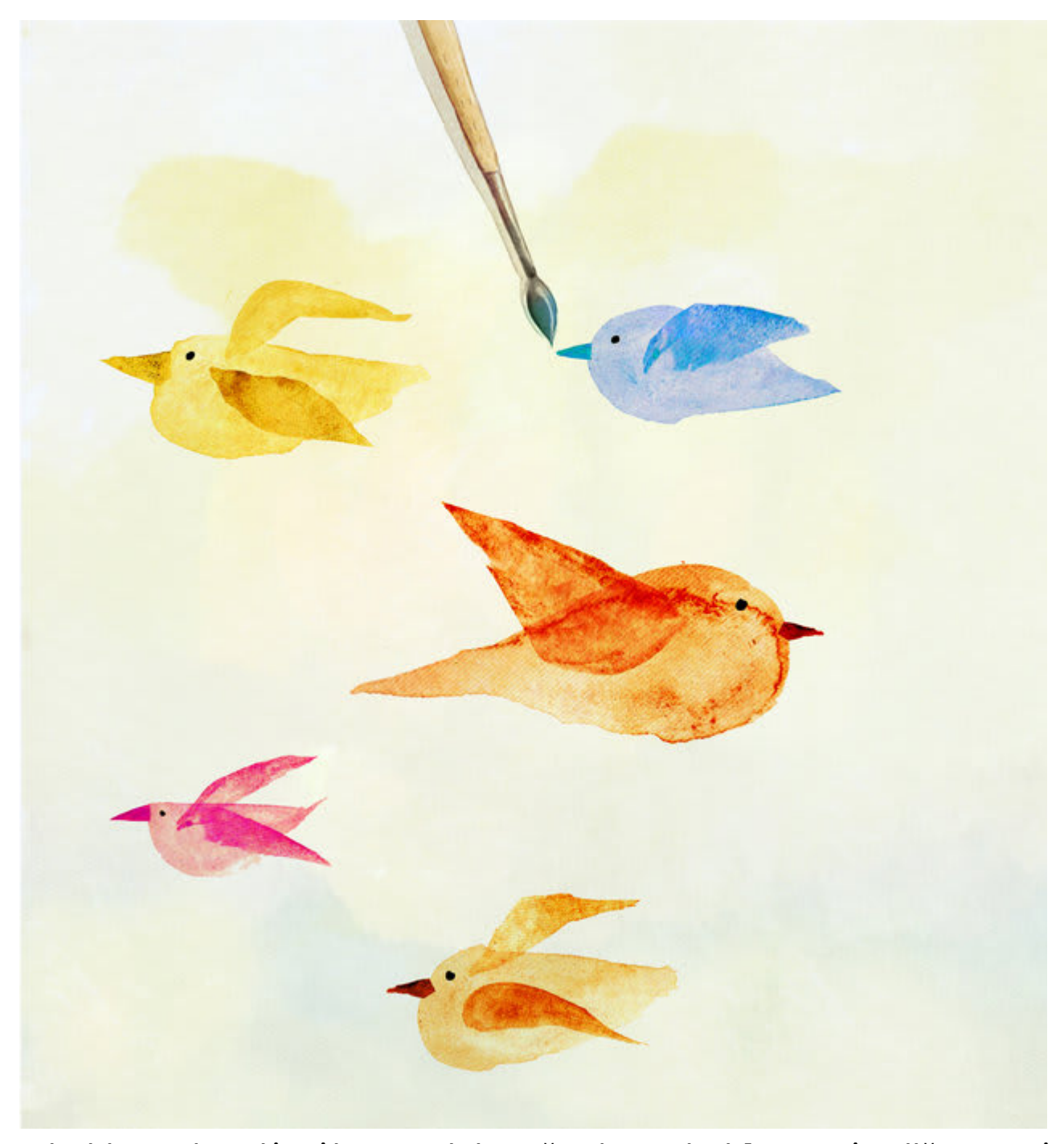
Tuak thia\m dua tlâo êlan rup leh anăn du\m drei ]^m mâo djăp mta êa bi kbrui êdah hlăm m'ar.