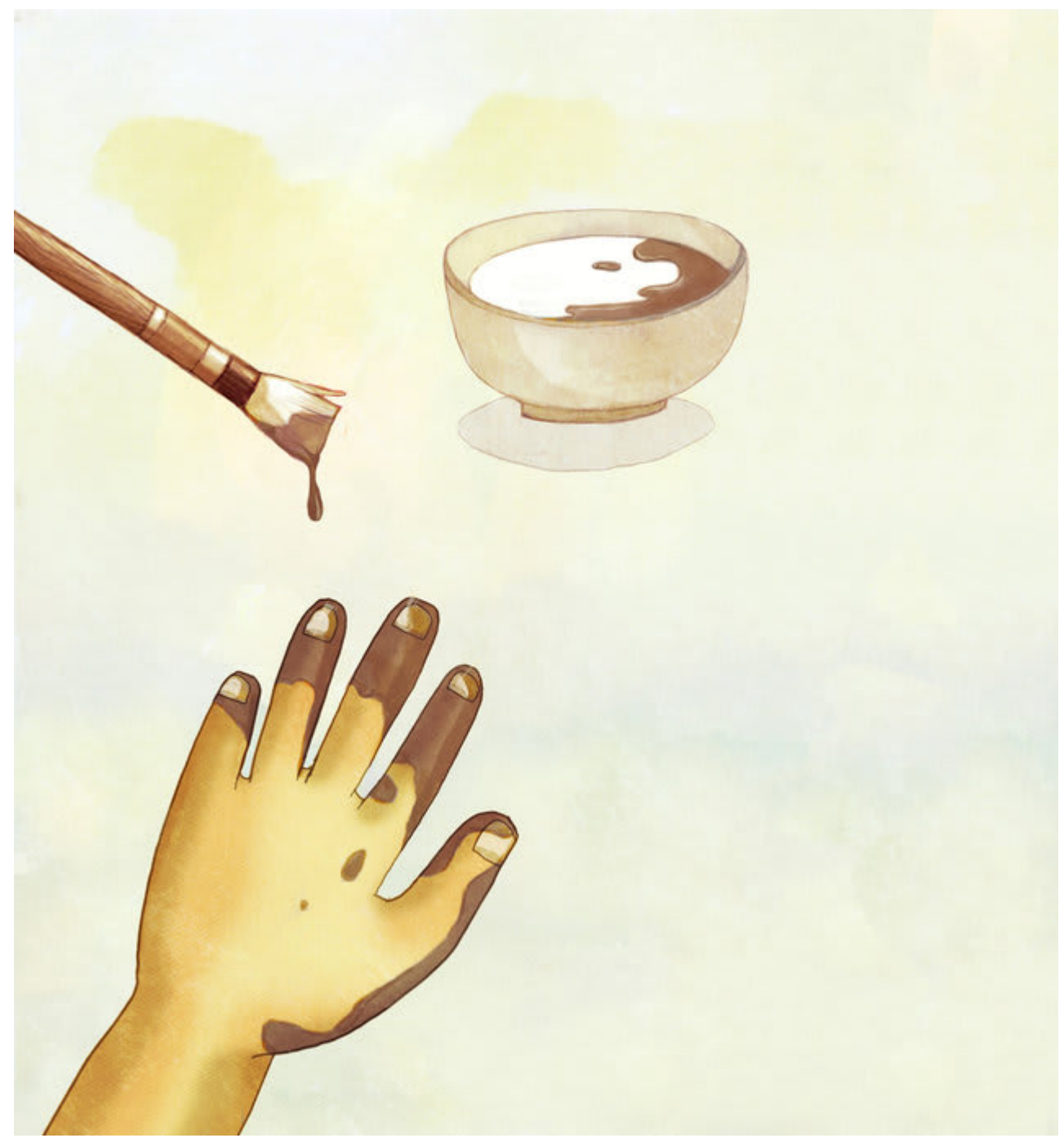
Tèo mmia êa ju\ju\ti kngan. Tèo tlao kh^k kh^k: - Ară anei kâo srăng ]ih rup kngan!