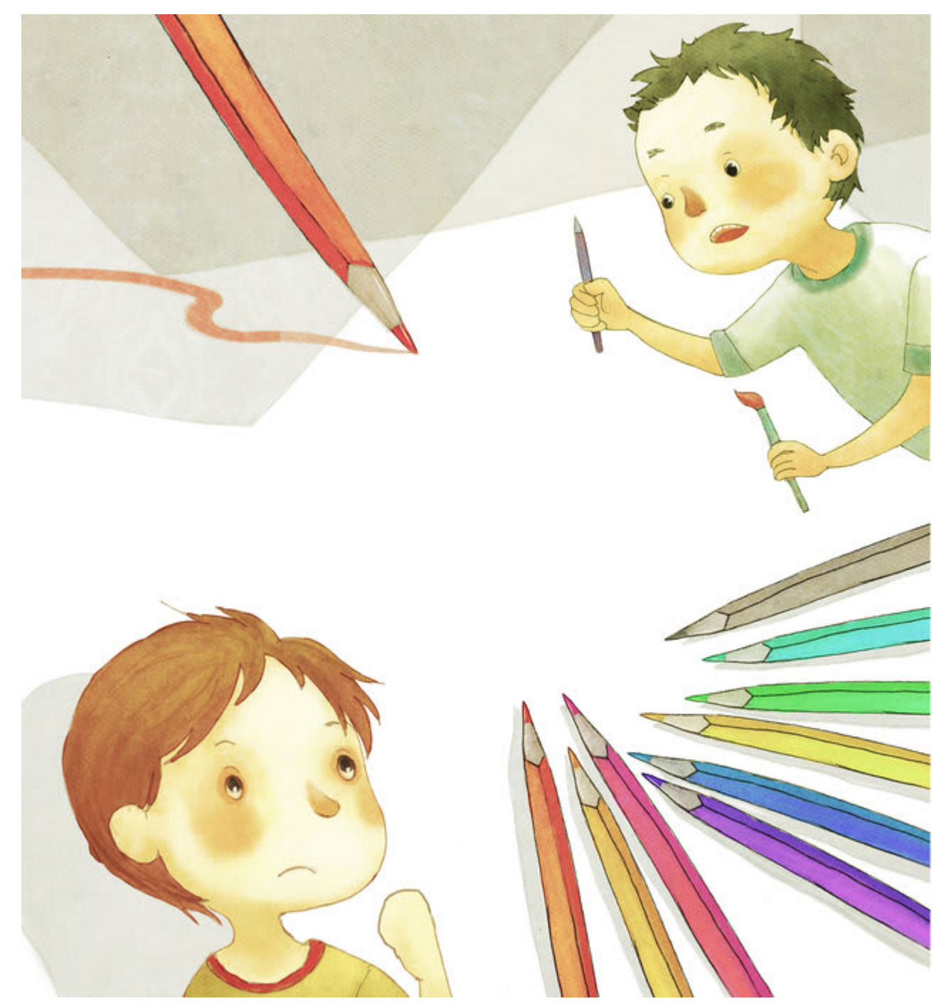
Tí ]ur giê kmrak êjai êmuh Tèo êjai: - Ih srăng ]ih rup ho\ng giê knih amâo dah ho\ng giê kmrak?