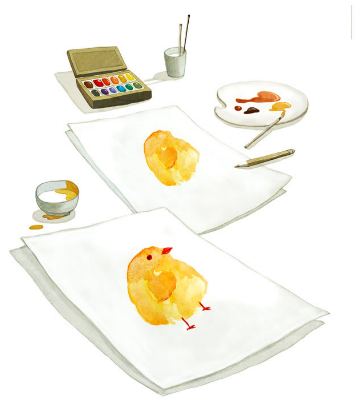
Tèo alah alan amâo lo\]ia\ng ngă. {ia\dah, go\dlăng [uh rup ]h^r ]hua\r hlăm plă kngan. Êa kulor hlăm kngan go\]ia\ng mse\ho\ng sa drei mnu\êđai!