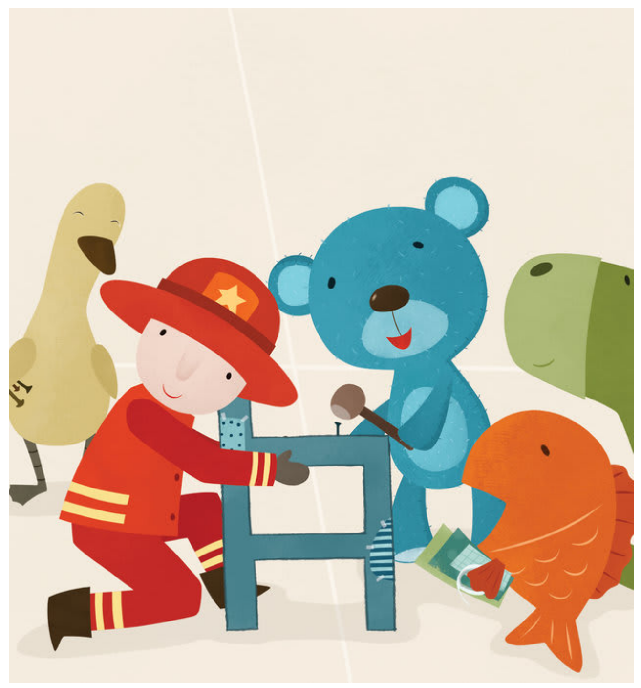
Xâuk kangz, hluôr tơưl tưz tsuv tuô tuôs! Cxuô lênhx qir têl laov lil tsêr cơưv, khu trôngx taos cha taol shông cơưv yaz.