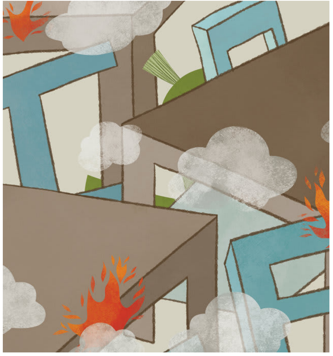
Xâuk kangz, tuz traos puv iz tul cu tưr xêv njuôz shangz tơưv hâur chêx luz trôngx tsênhv cuz hnhaz.