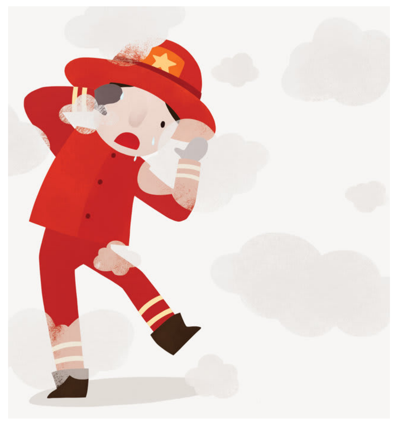
Xangr tak muôx lênhx tưs tsênhv tsuv chinhz nyei, tuz traos seiz đhâu păng nqu haz hu đraor: - Puôk muôx lênhx tưs nhaoz hâur cao?