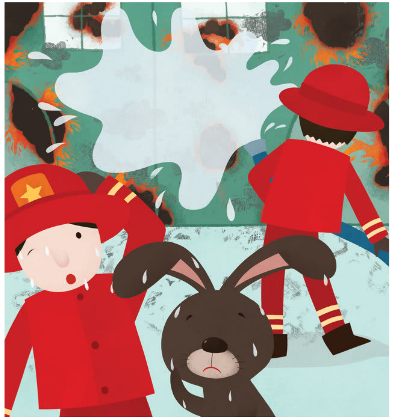
Xâuk kangz hluôr tơưl tưz tsuv tuô tuôs.

- A aaaaaaaaaa! Muôx suôz đraor đangz tsi nir?