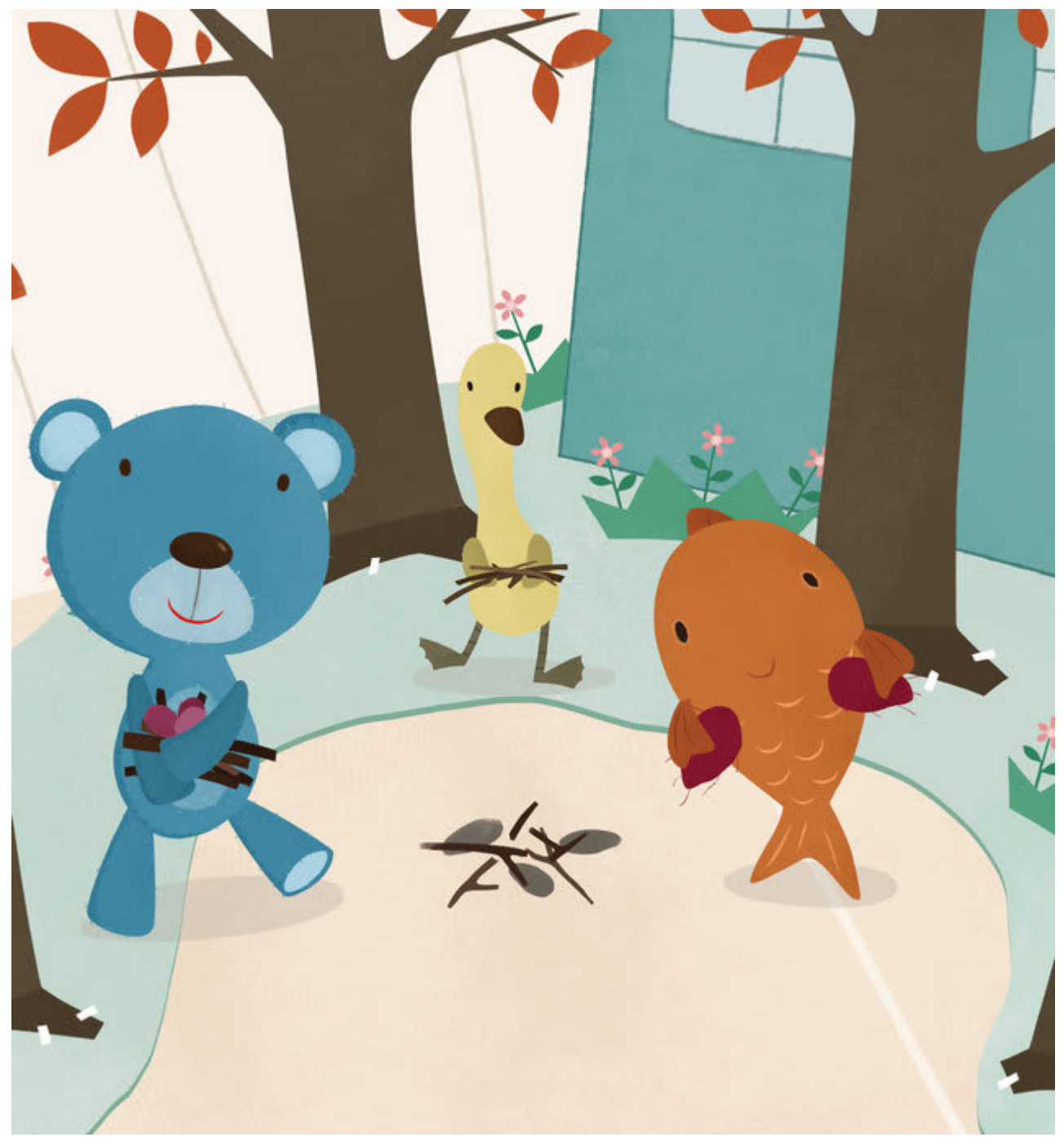
Iz hnuz kreir, đeik Teddy, uk Duck haz njêl Fish chaox kaok laz môngl yăngr puôv tsêr cơưv chi cha naox su.