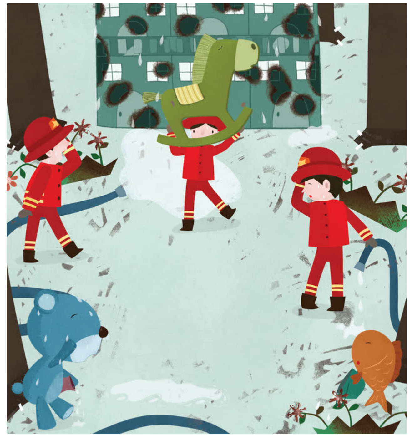
Lâul Nênhl tưx zôngv uô si tsuv zôngz lơưv viv grôl trâus păng nqu. Tuz traos tuô hluôr tơưl muôz iz đeiv qaox ntuz bus tru lâul Nênhl haz chaox lâul tơưv đrâu.