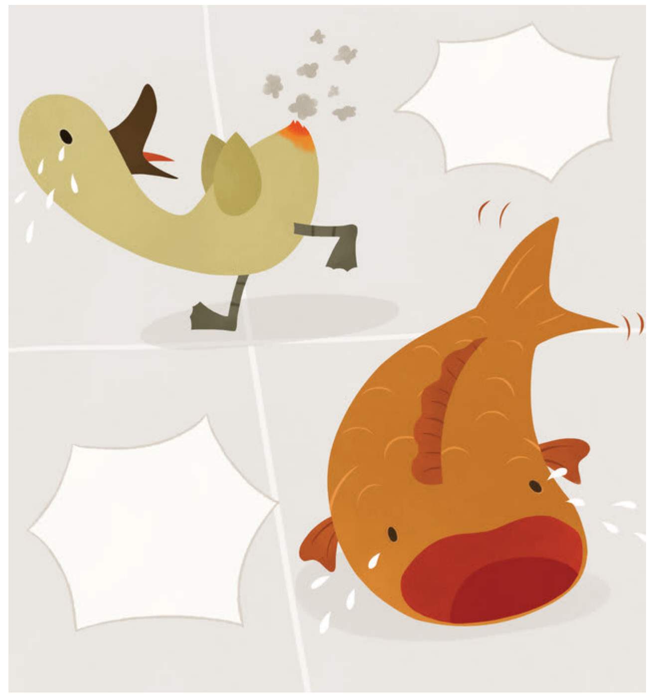
- Tsêr cơưv tsênhv tsuv cuz hnhaz! - Njêl chaoz Fish kư đraor. Uk chaoz tâu nyei kư: - Cuôx cuôx, cu li cu tưr tưz tsênhv tsuv cuz lơưv lak!