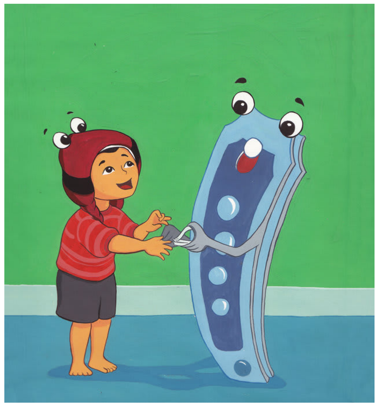
Aơ jêng ba\l nka\p nheh ti, pa\ng kơl gâp nka\p nheh ti ăn gleh jêh ri ueh djhep.