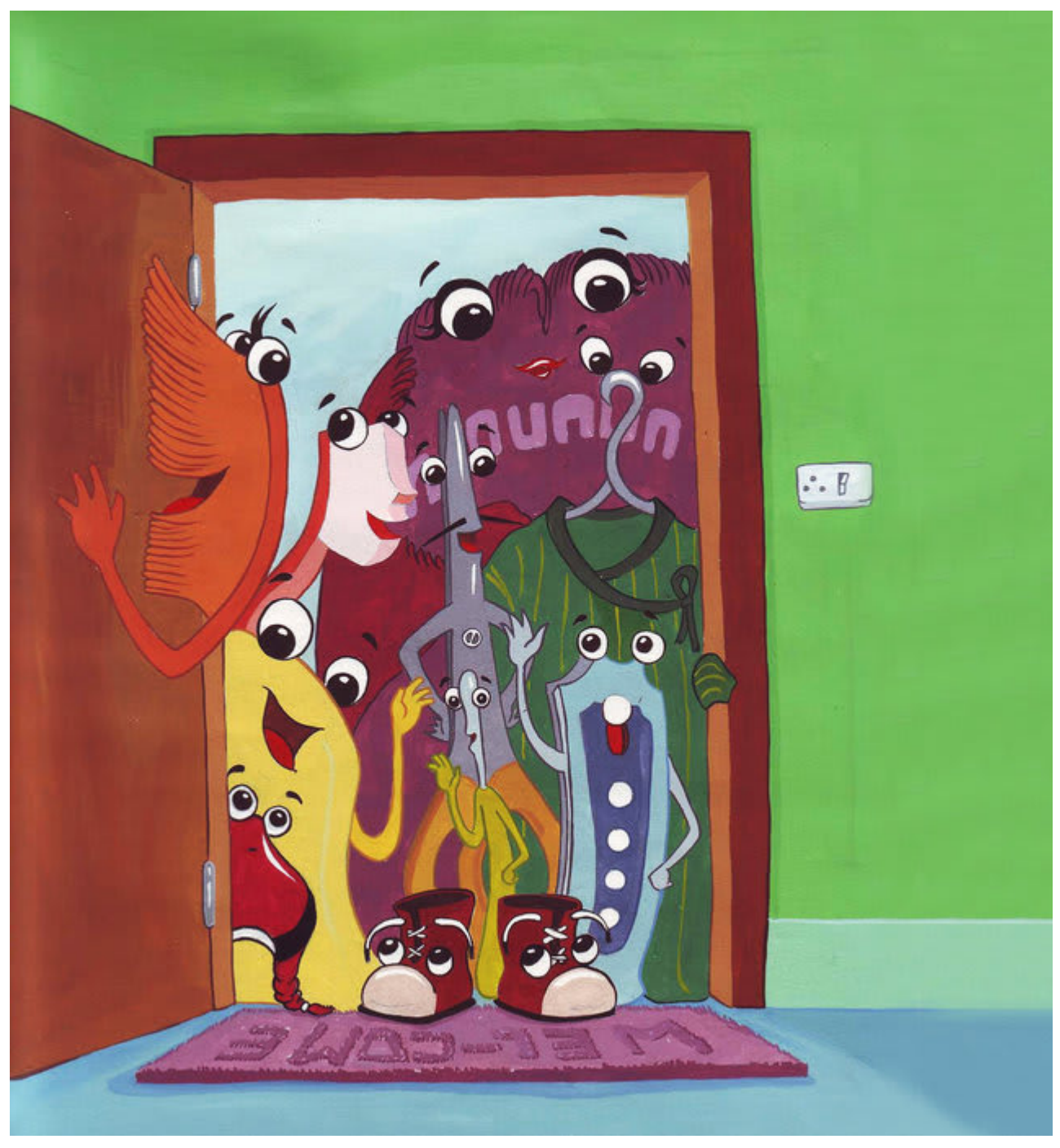
D^ng le\j^t ba\l rơm mro kêng gâp lah gâp u\ch. Gâp ro\ng le\ba\l âk ngăn.