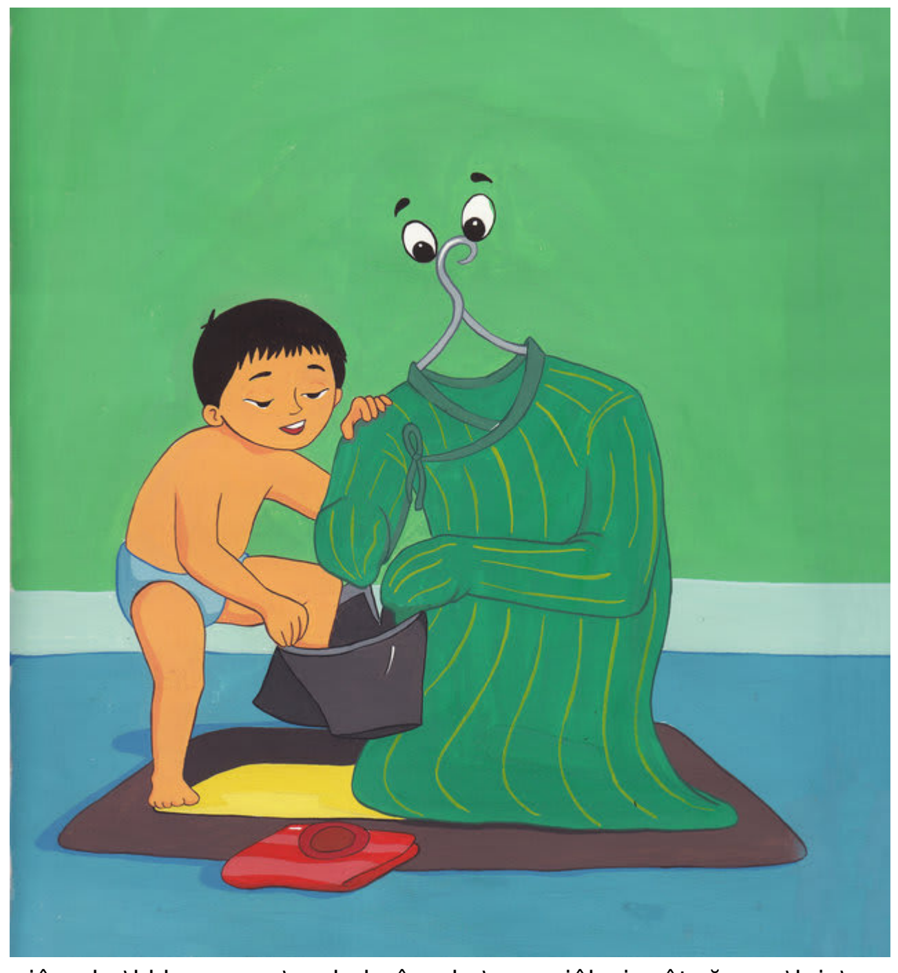
Aơ jêng ba\l kho ao, pa\ng kơl gập nku\m an jêh ri mật răm sa\k ja\n