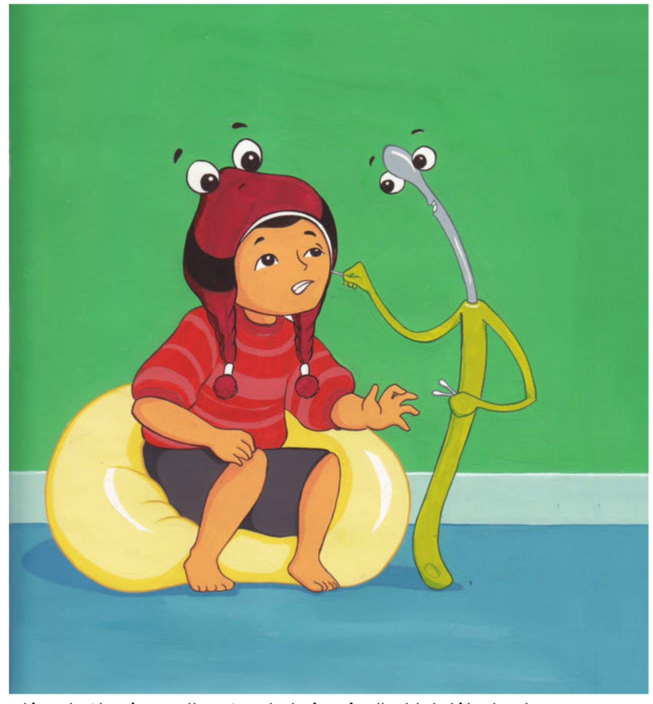
Aơ jêng ba\l mâng mli, pa\ng kơl tôr gâp ăn kloh jêh ri sơh rsơn.