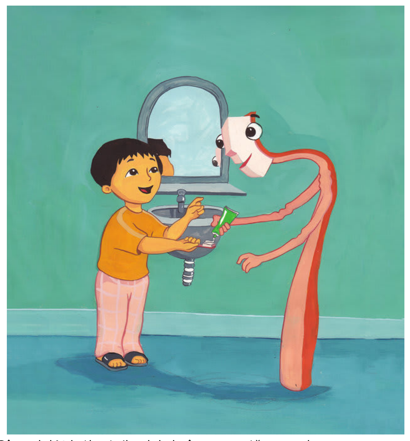
Gâp geh j^t ba\l gu\n'hanh kơl gâp rơm rna\ăn nar mhe. Ntơm saơm jêng ba\l [rôih tho sêk. Kơl sêk gâp ăn nglang.