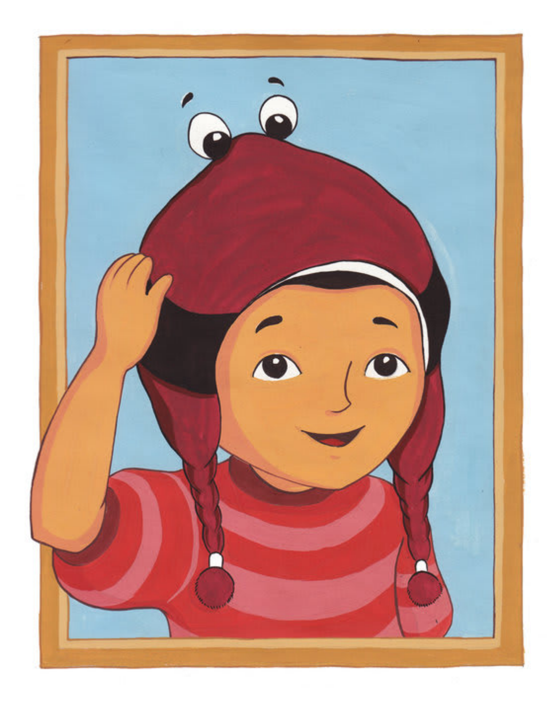
Jêh nây đo\ng jêng ba\l môp, pa\ng mât bôk gâp ăn răm lah trôk ji ka\t.