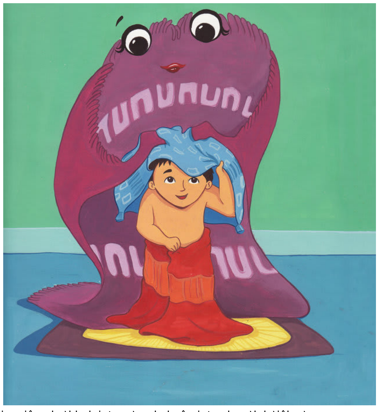
Bi aơ jêng ba\l bok jut, pa\ng kơl gâp jut sơh sa\k le\jêh u\m.