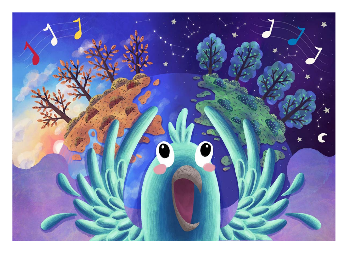
"Fly, fly, to the south we fly. To places warm and cozy. Fly, fly, fly in the sky. To the... to the.....sunset you'll see." To the right? To the left? Which one is it? Little Canary can't remember.