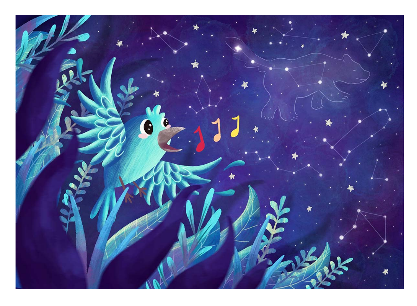
Little Canary flaps his wings as hard as he can. He's sure he'll catch up with his flock!