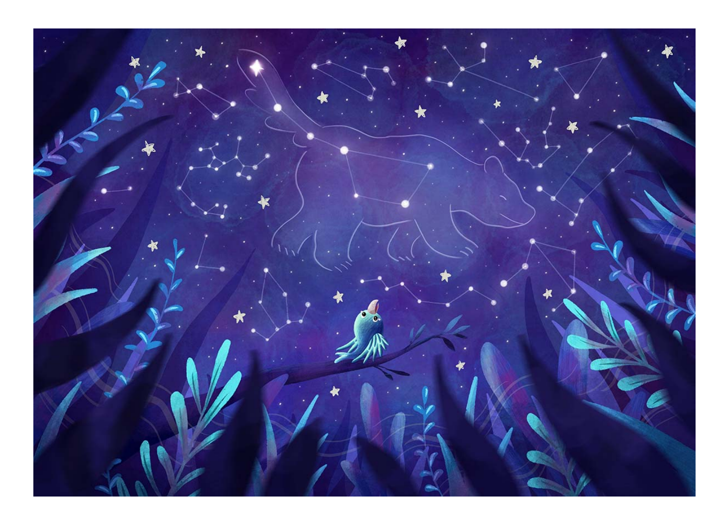
Oh, it's only the wind. But what is that past the leaves? It's the Little Bear! Now, all he has to do is to fly away from the end of its tail.