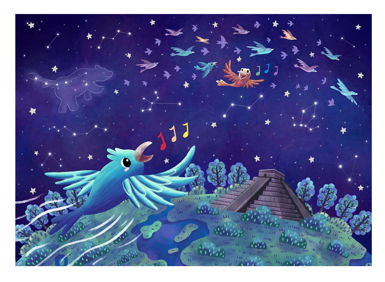
Listen! That chirping sounds familiar. It's his flock!