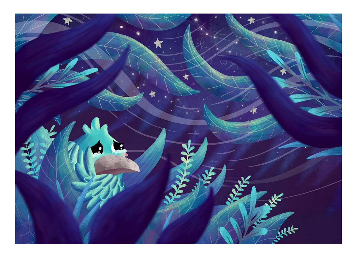
Maybe it's warmer among the leaves. Just then, he hears a rustle just above him. What is it? Is it the wind? Another bird? Or ... a snake?