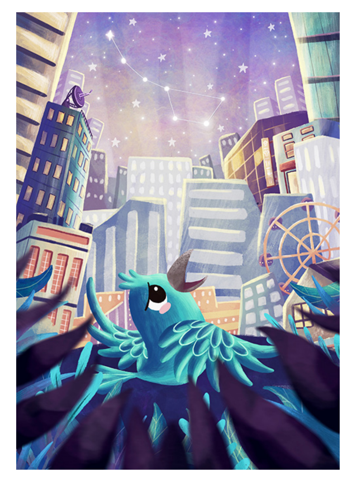
Which Way is South?

It's Little Canary's first time migrating south with his flock. He needs to stay close and follow his mother's lead. But on the way, he finds himself all alone. How will he find his way south? Will he ever see his family