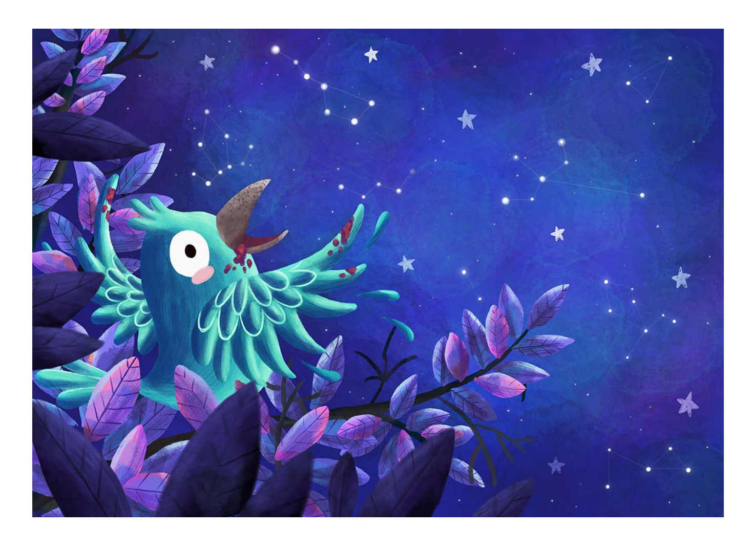
Little Canary eats until he feels full. Then, he looks up ....Oh no, where is his flock? How will he catch up? The song Mother taught him! He must try to remember it.