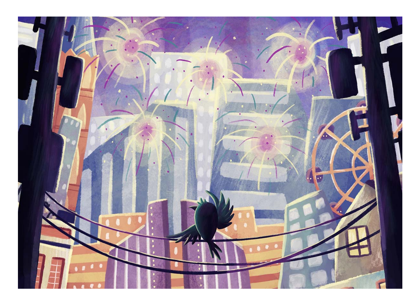
But, oh... the glare! Little Canary can't see the Little Bear. He can't see anything in the sky!