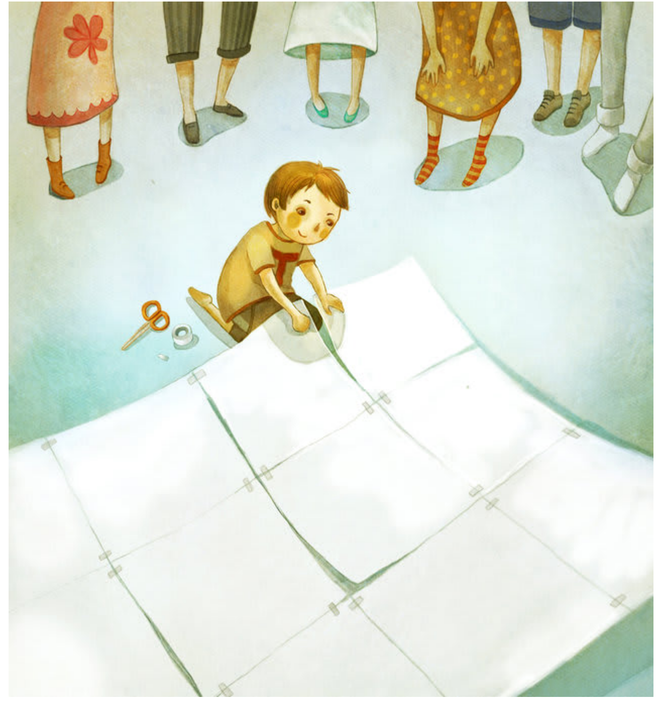
etV JIN {g& ooc yd* uk o&UN!