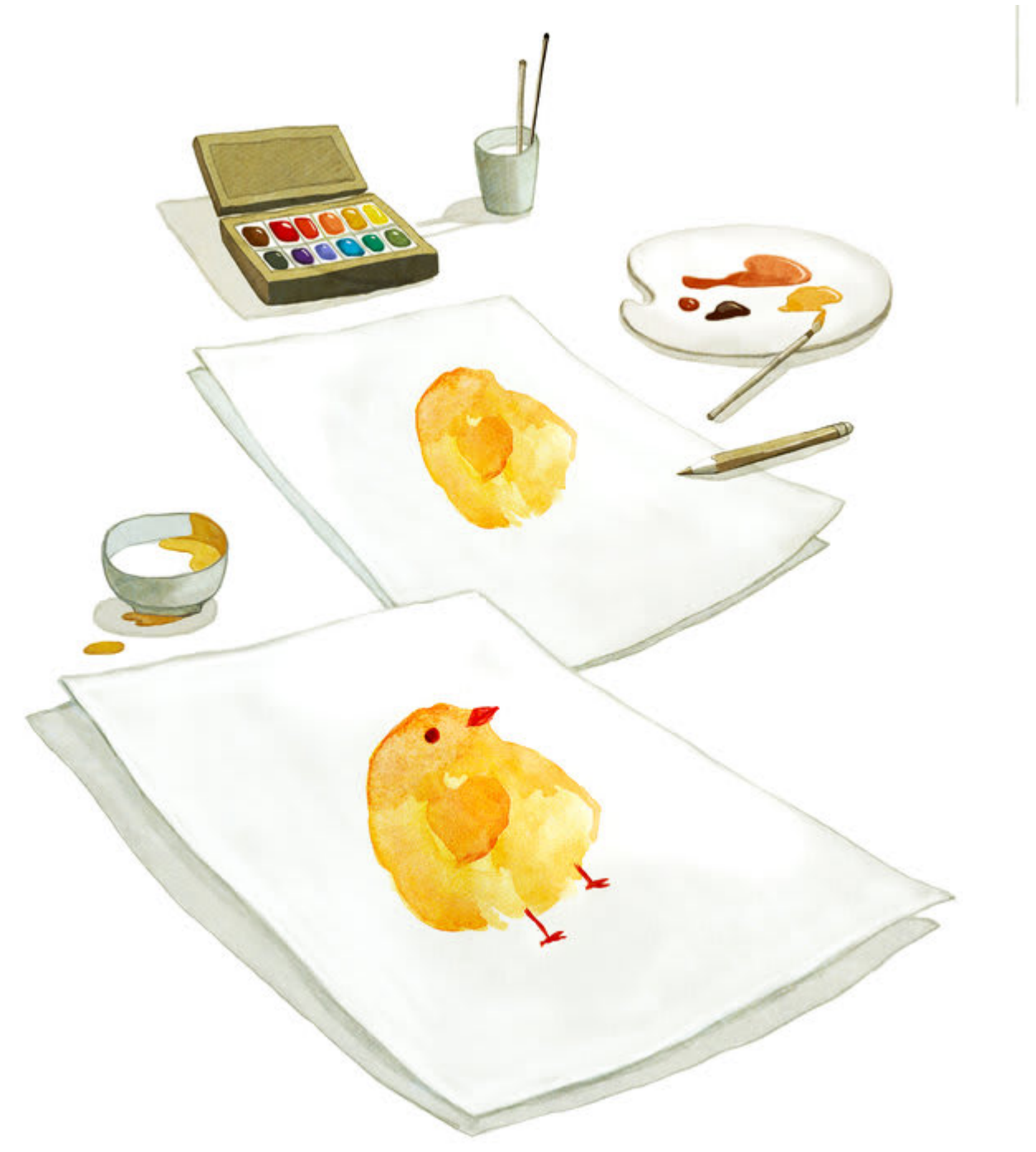
etV Eb&a #Jd yd* Apd Eb& #H&G eo& VaG Ix. {L Eb&a eL x}G M$ eL #hN h&uN Q eL eo& h> uj& n*}G ooG UM M$. PUG ix uj& ooG UM M$ epc h&uN <t yc& N*oJ.