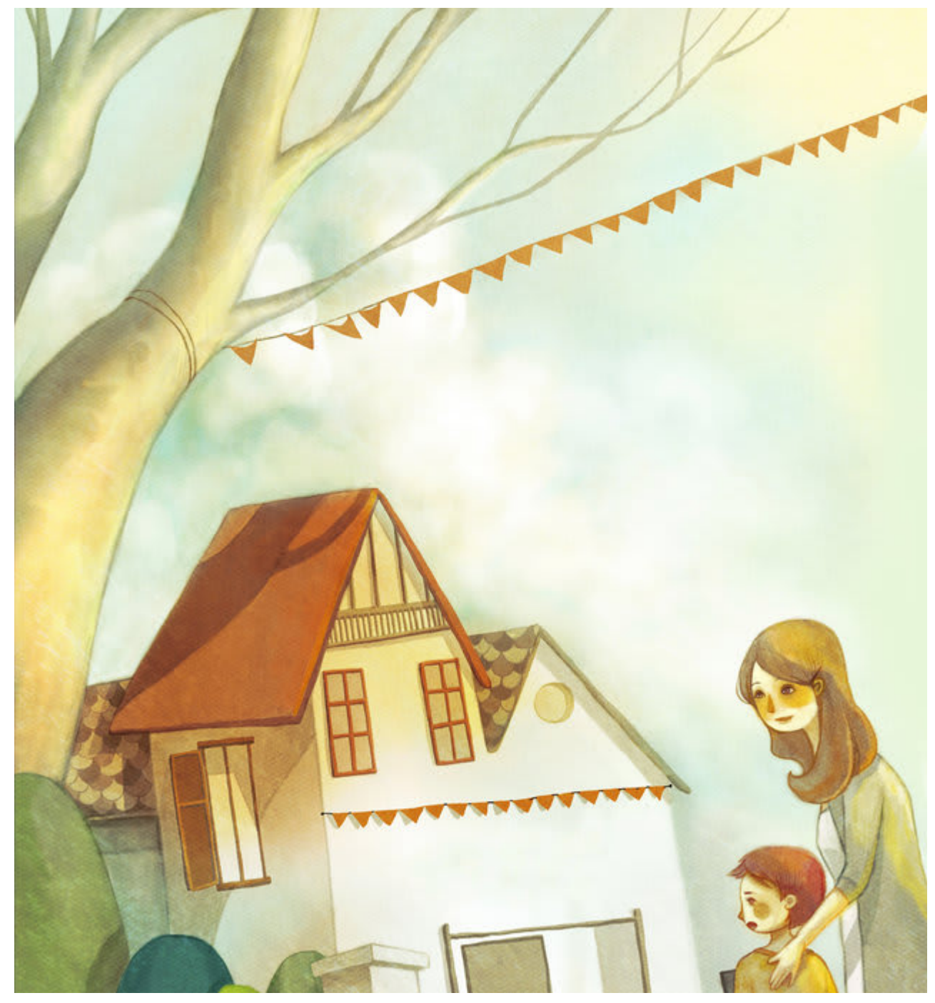
\#OM Yh^* etV yp eob n^* G EHN v$ h&Va koG #I&c N*oJ.