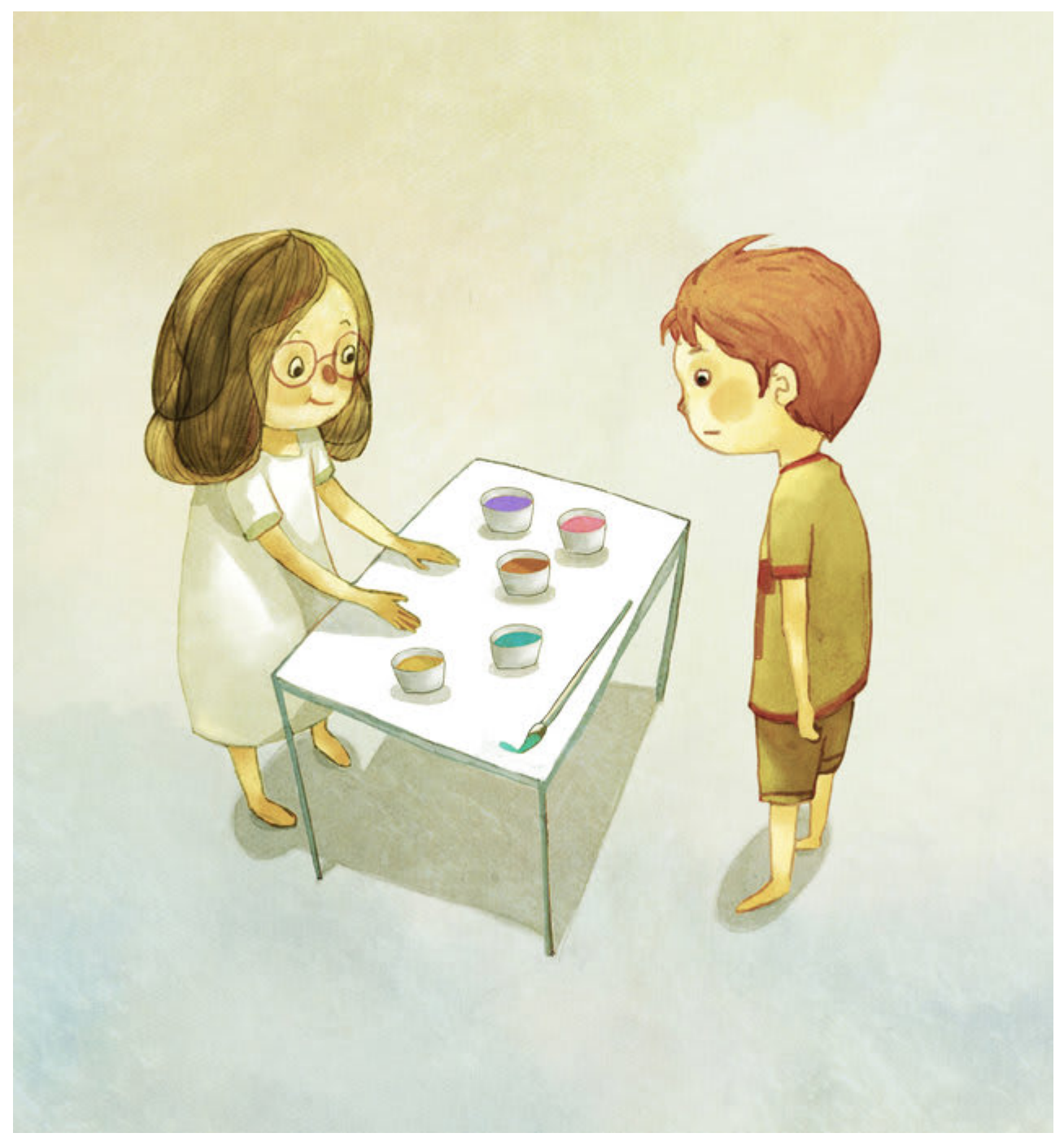
hVa waM etV: - MUG eo& kIN h&uN < t x G #L? etV V&a: - c$ eo& kIN <math>h&uN #TG c&a #md < t x d.