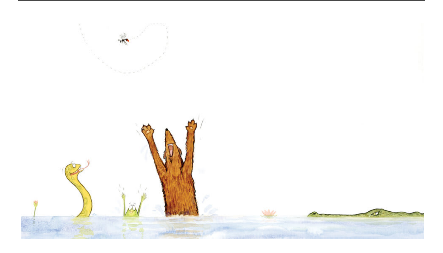
#TG c&a <Md P*oM c$ V&a: yd* J*oN <t [t& AN. <t lh* {g&:- yK* uc p}d yd* MUG eL*V...