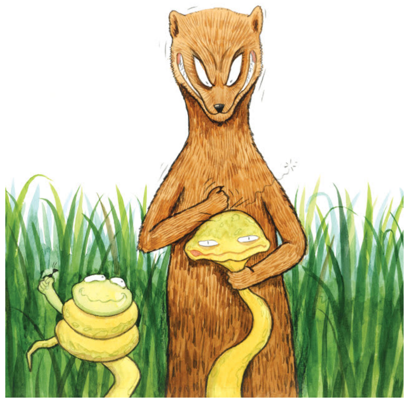
yK* uc p}d yd* MUG eL*V! - <t ma V&a.</li>MUG Eb&a j*aN o&a? - <t uG V&a.</li>