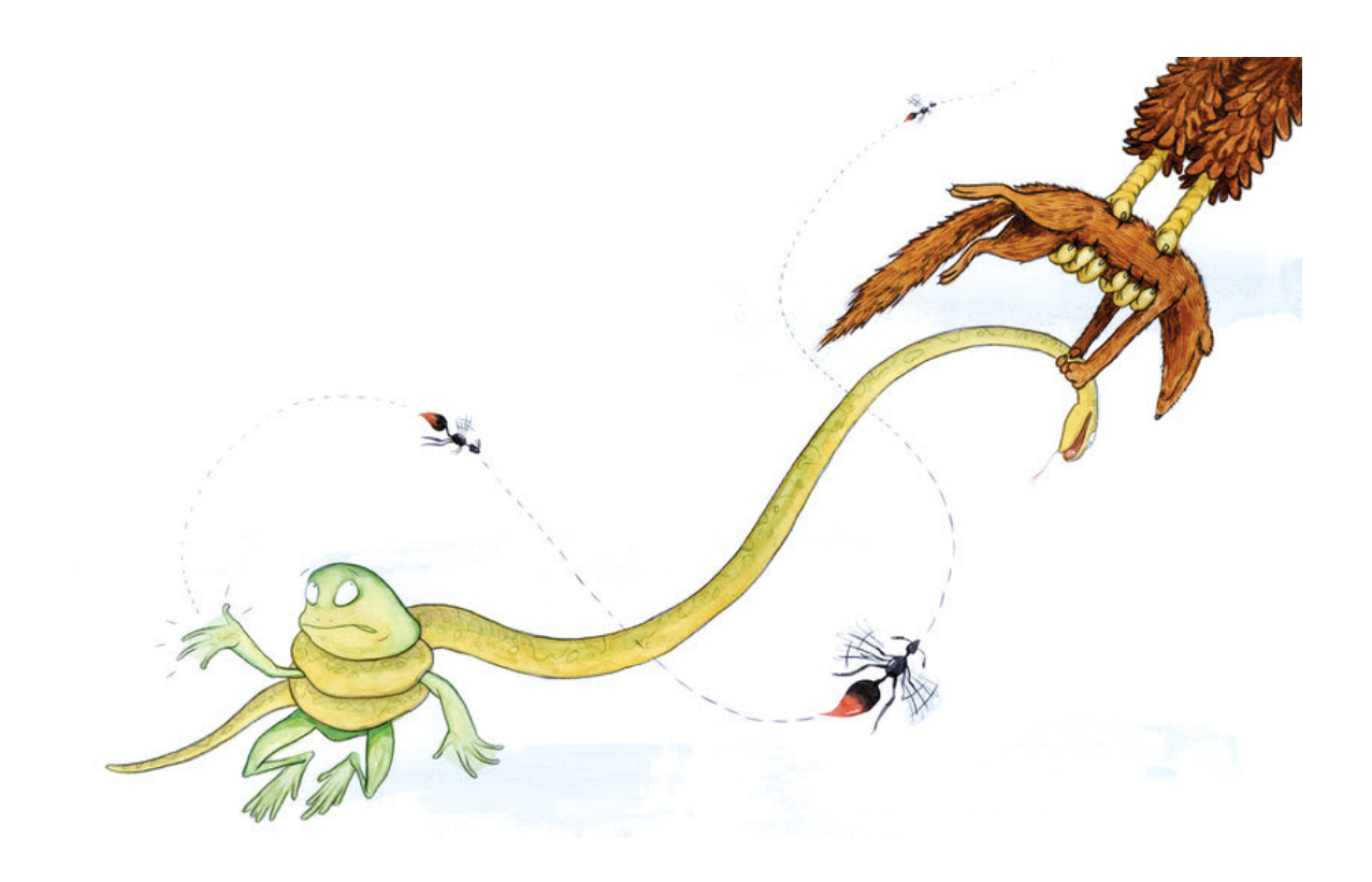
<t <cb p&oJ <t [t& ooc.