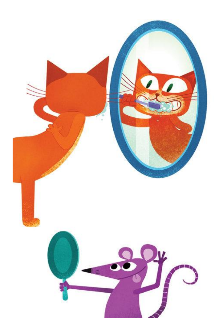
y-]$ h# \pS p'J w)1 \a@1 = oA w$1 yr&A