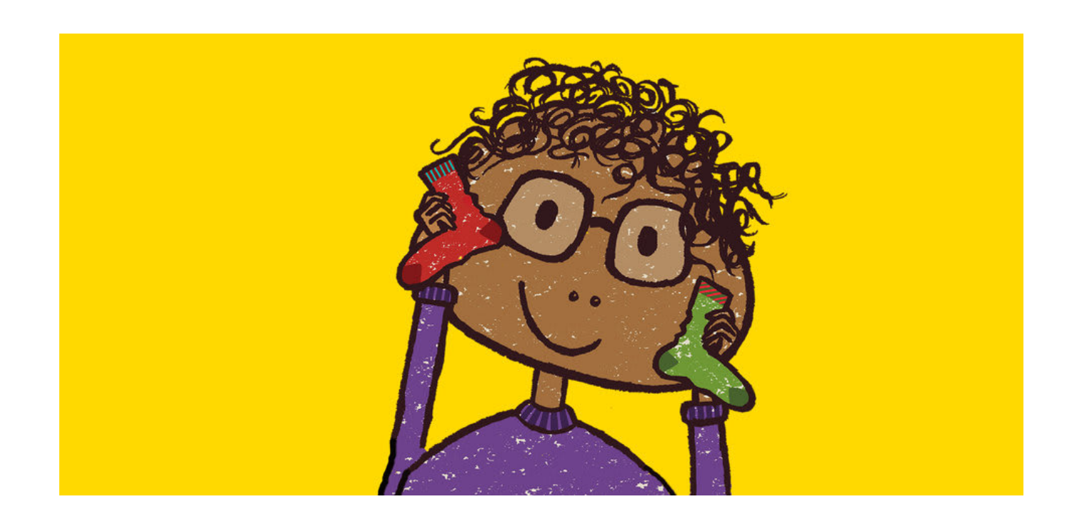
-p! w)1 /;&! n=a

Anu :r%N w)1 /;&! n=a x~R :e&P zN .r*# y/=n \pS -u~@1 p(1 nw~A ;-'^csO :e&P /;&! n=aB {^ /;S sRX :=y^A nkY Anu c1 \c&A :e&P-p! {F /;&! n=a a)A c1 =r .YN -u~@1 fA :~^ /u&1 :(A {#B :]&N .r*# Anu /&^ \wS -r$ -p! {F /;&! n=a a)A w\r%A \pS 'SH