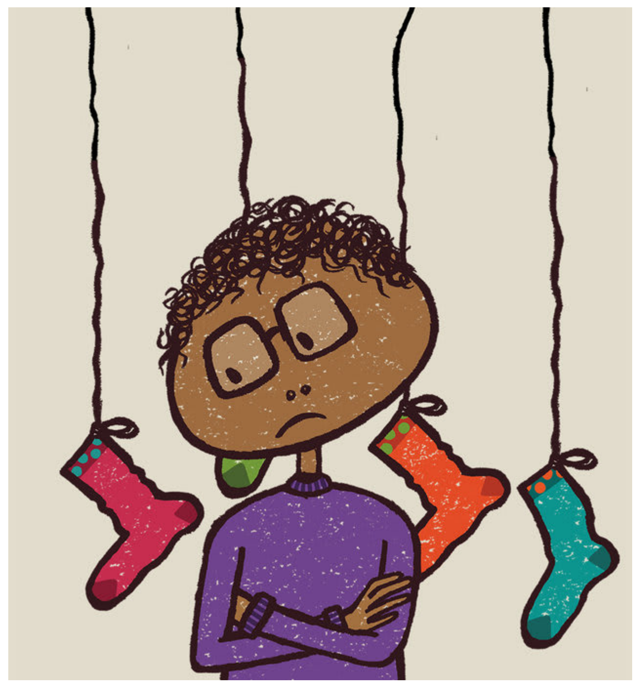
Anu :r%N -p! w)1 /;&! n=a :~^ wK c1 \pSB y%R .A .AX :=y^A /iN :e&P k&^ ny*^ \c&A uaRB