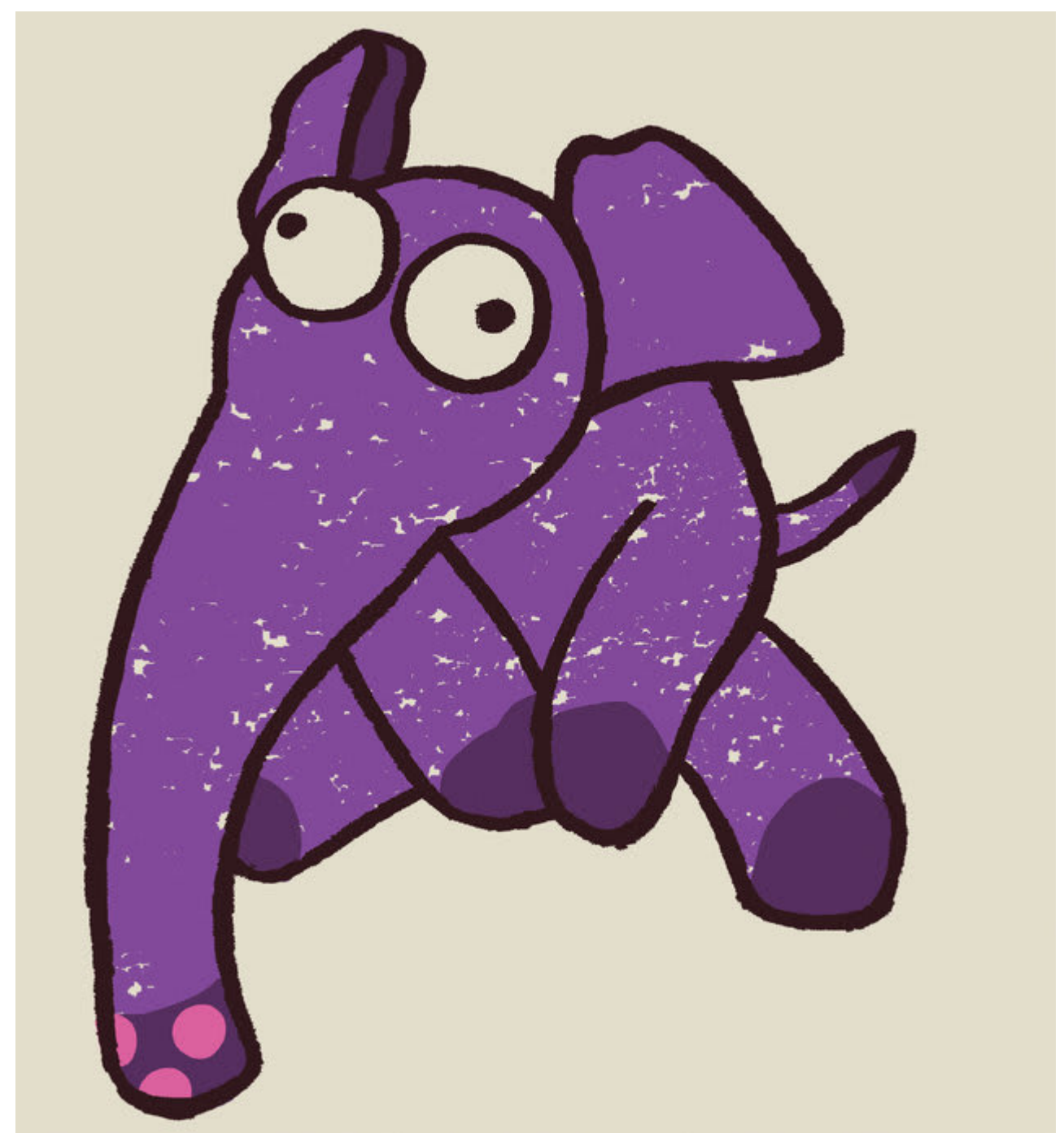
/;S /pSX =r .YN -nA /&^ \c&A nan(AB {^ p'J -p! w)1 /;&! n=a c1 =r .YN i@1 \o@1 -i~I {^ \pS '%y*^RV