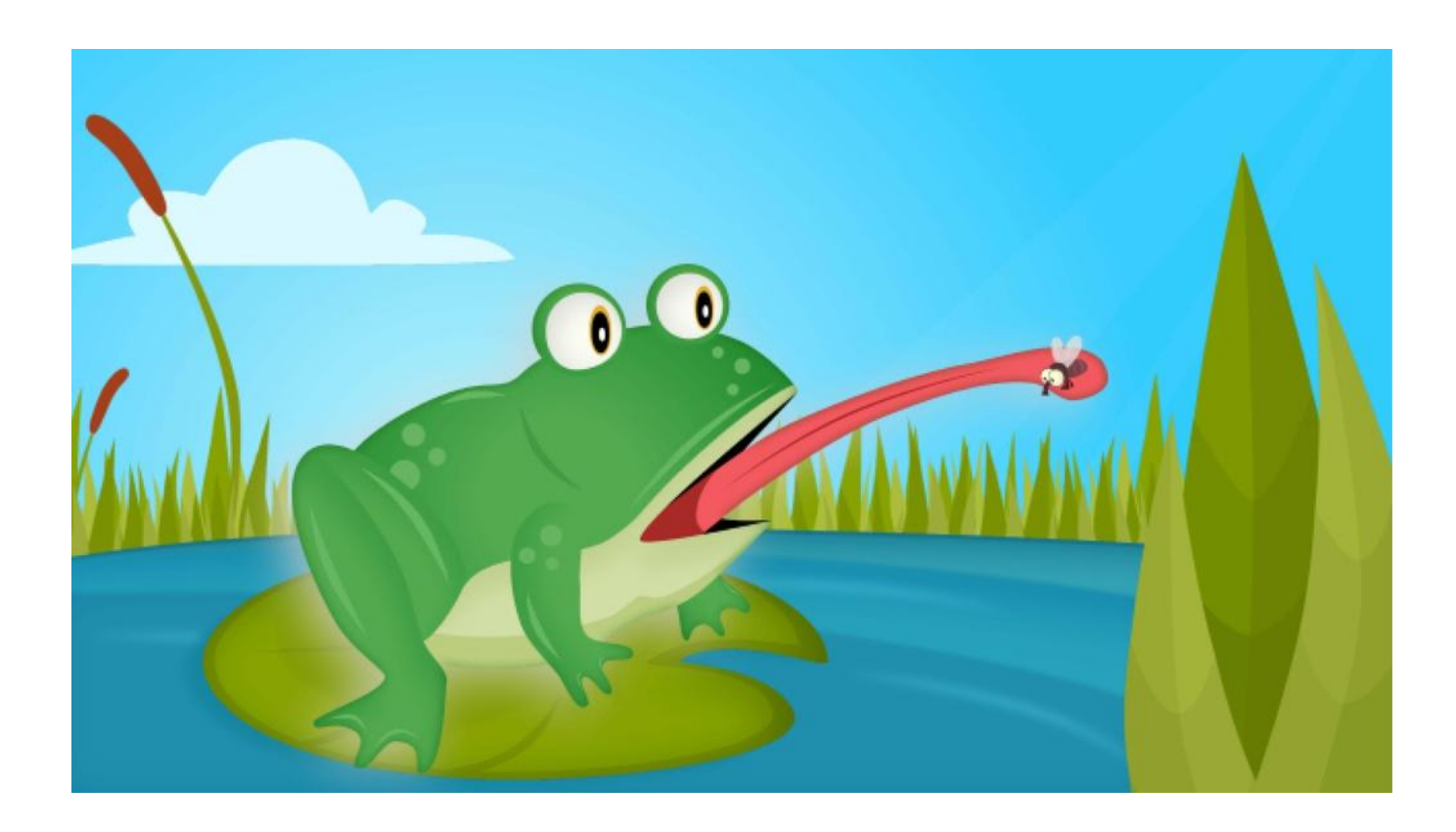
The frog ate the fly.