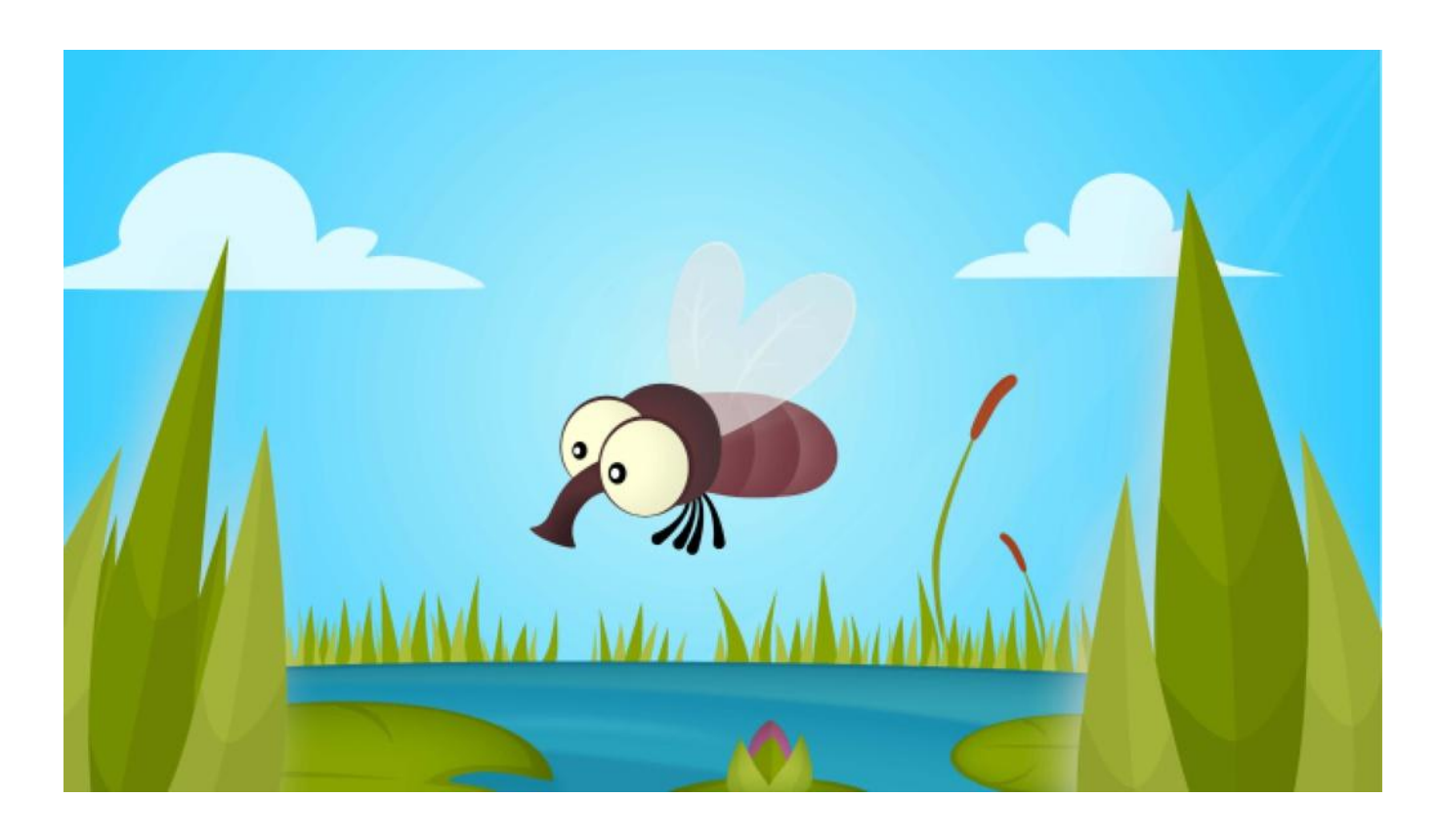
The fly flew over the pond.