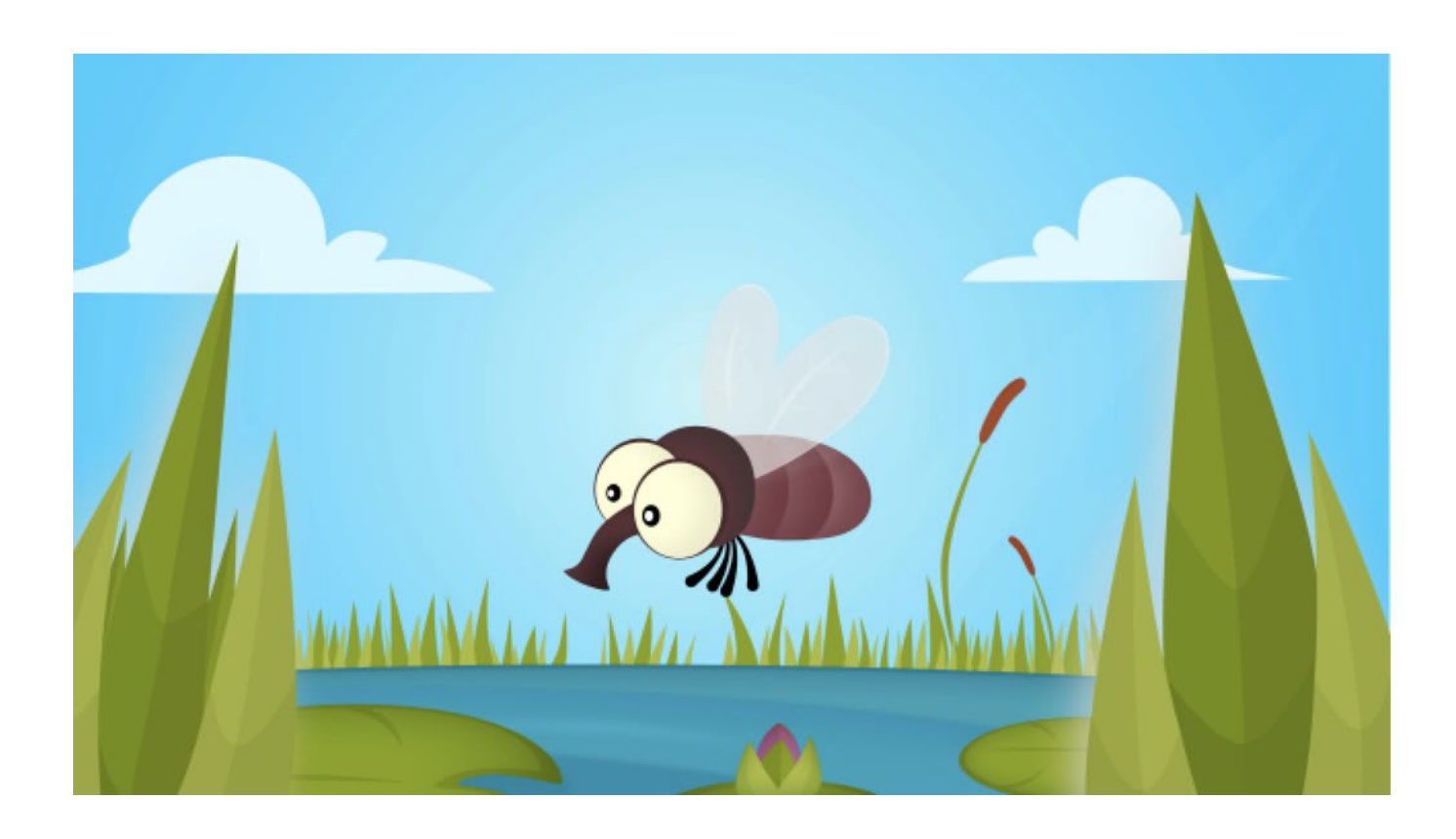
T he Fly Flew Over the Pond