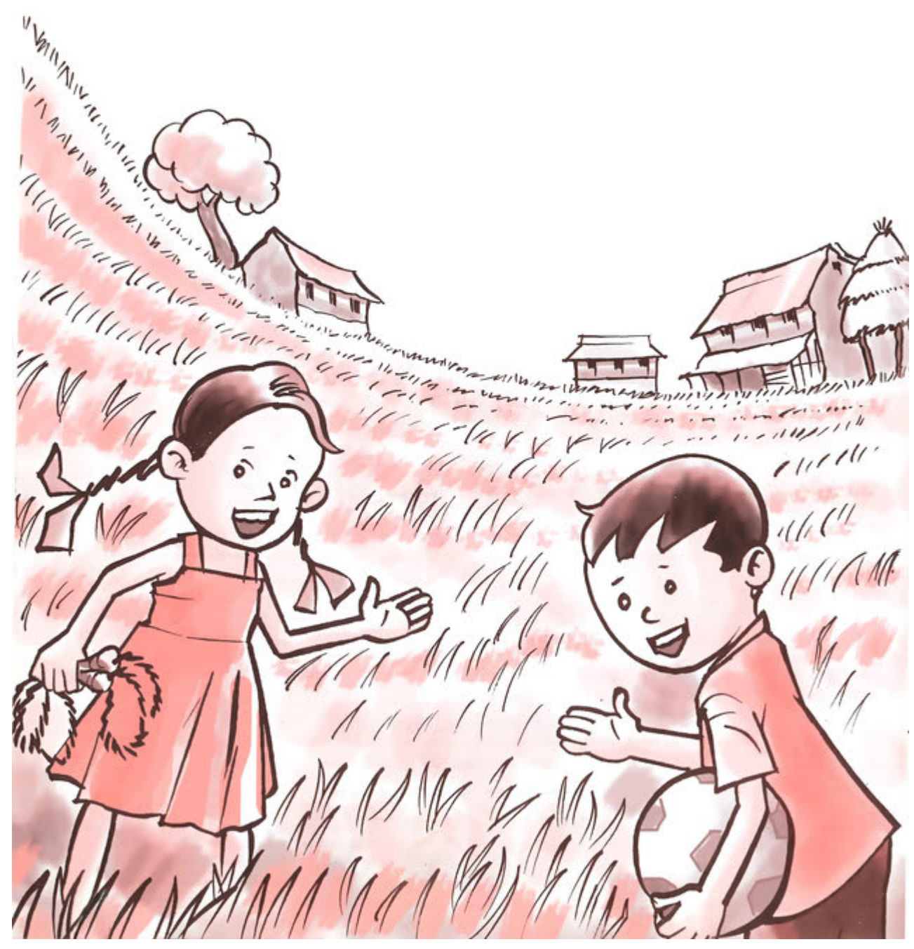
Tuproqqa nazar soling, do'stim. Bu yerda maysa juda yashil!