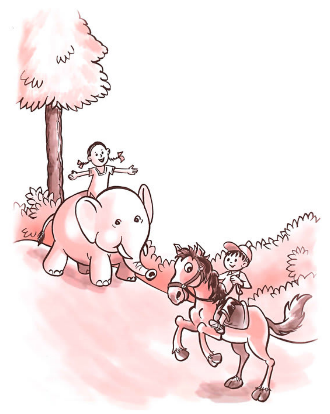
Qara, do'stim. Bu yerda otlar va fillar yashaydilar.