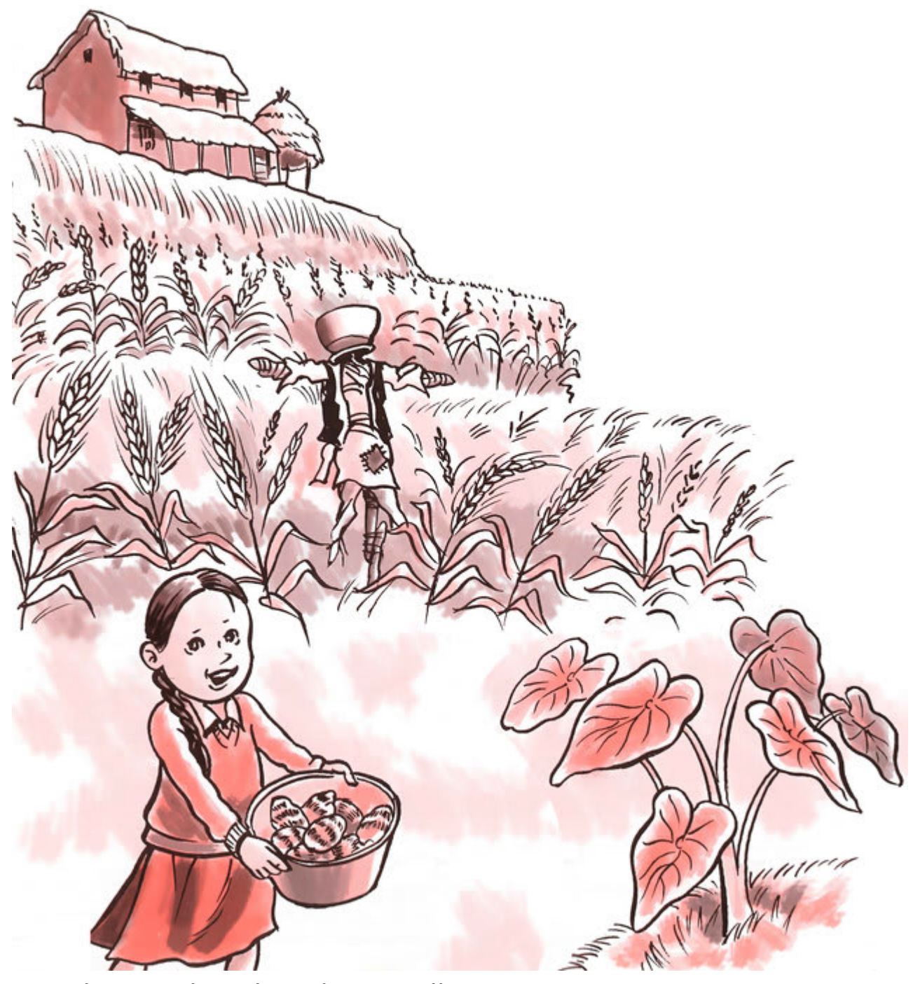
Bu yerda guruch va bug'doy o'sadi.