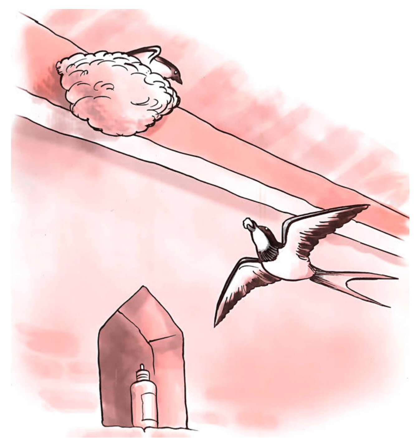
Qaldirg'och ham o'z inasini tuproqdan quradi! U loyni tumshug'ida tashiydi.