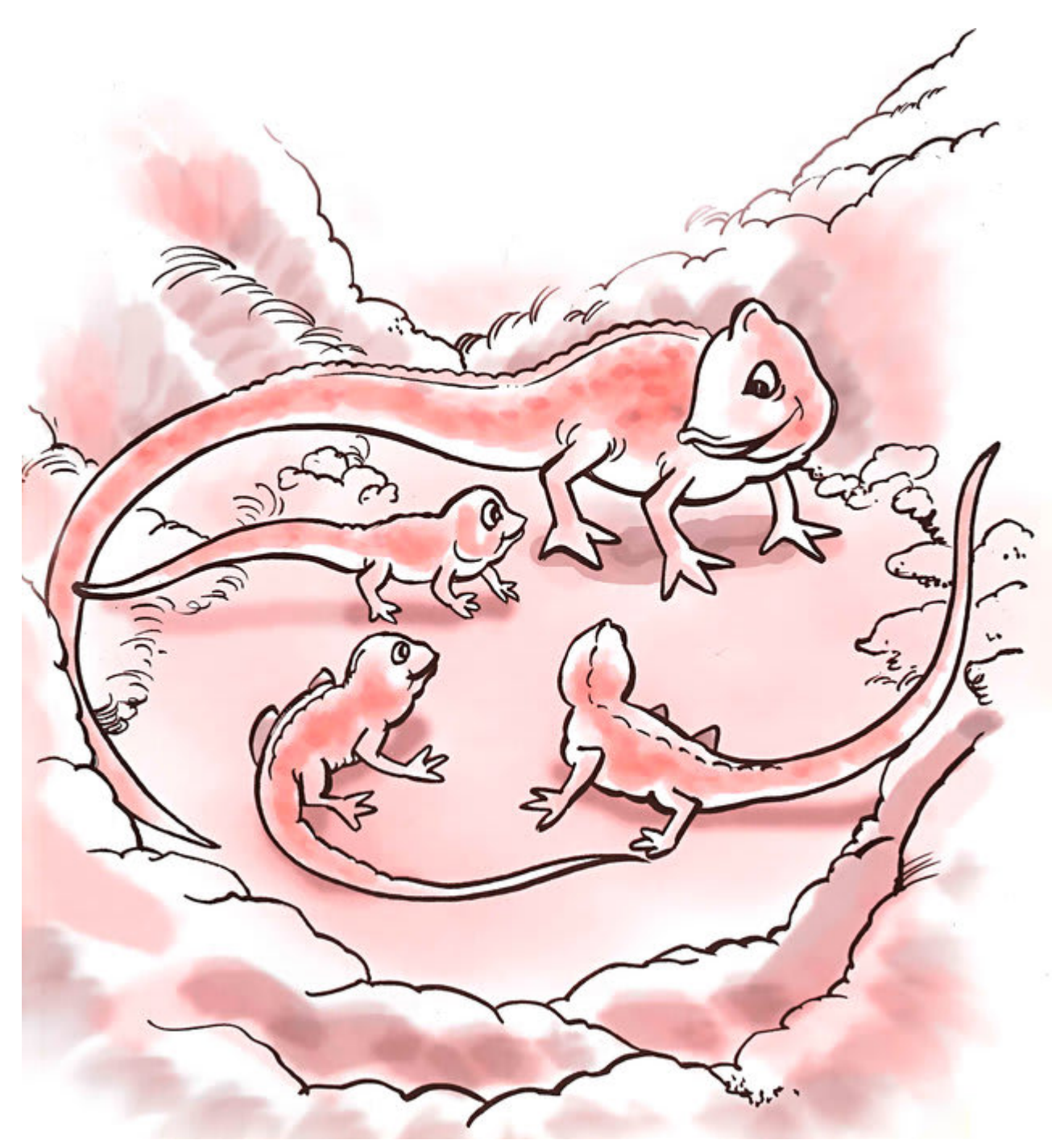
Bu yerda yana buqalamun o'zining yosh bolalarini voyaga yetkazadi.