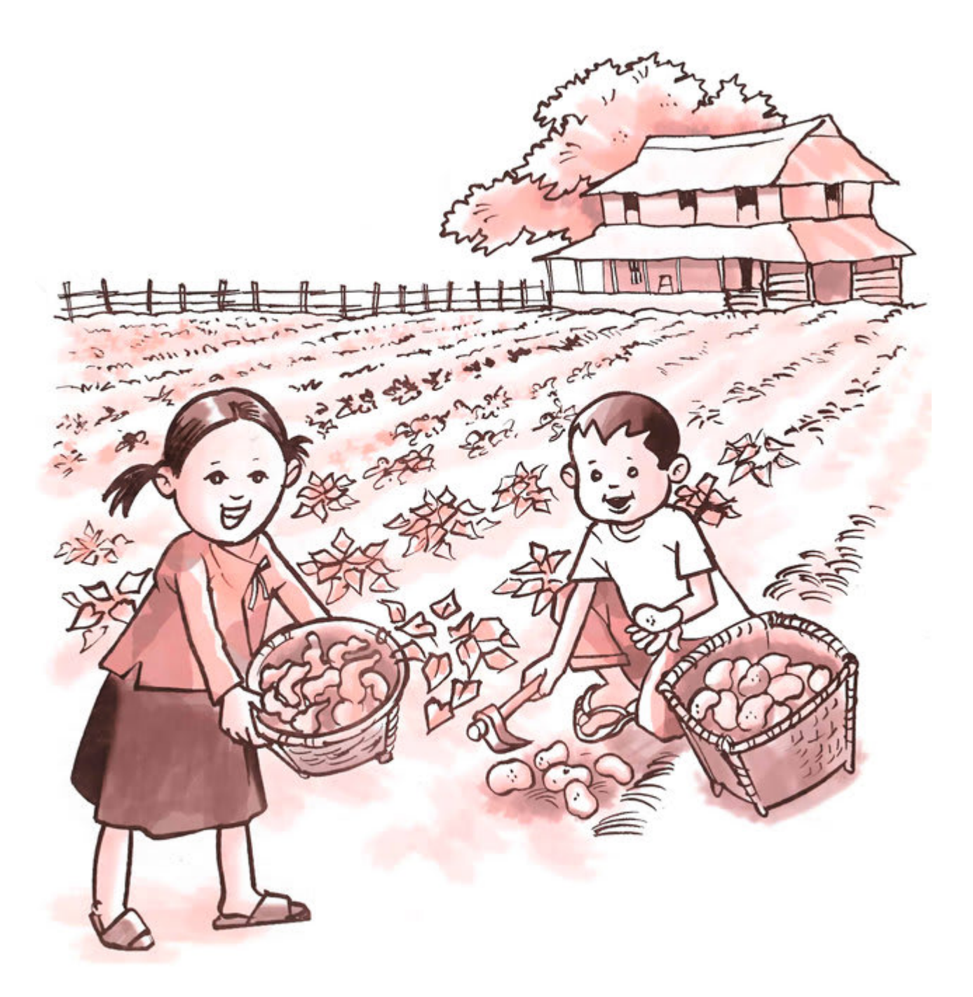
Bu yerda sabzavot kartoshka va shirin kartoshka o'sadi!