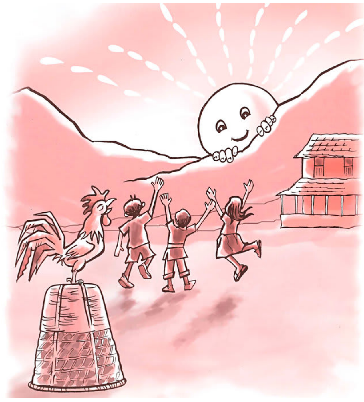
Bu yerda doim kun yorishadi.