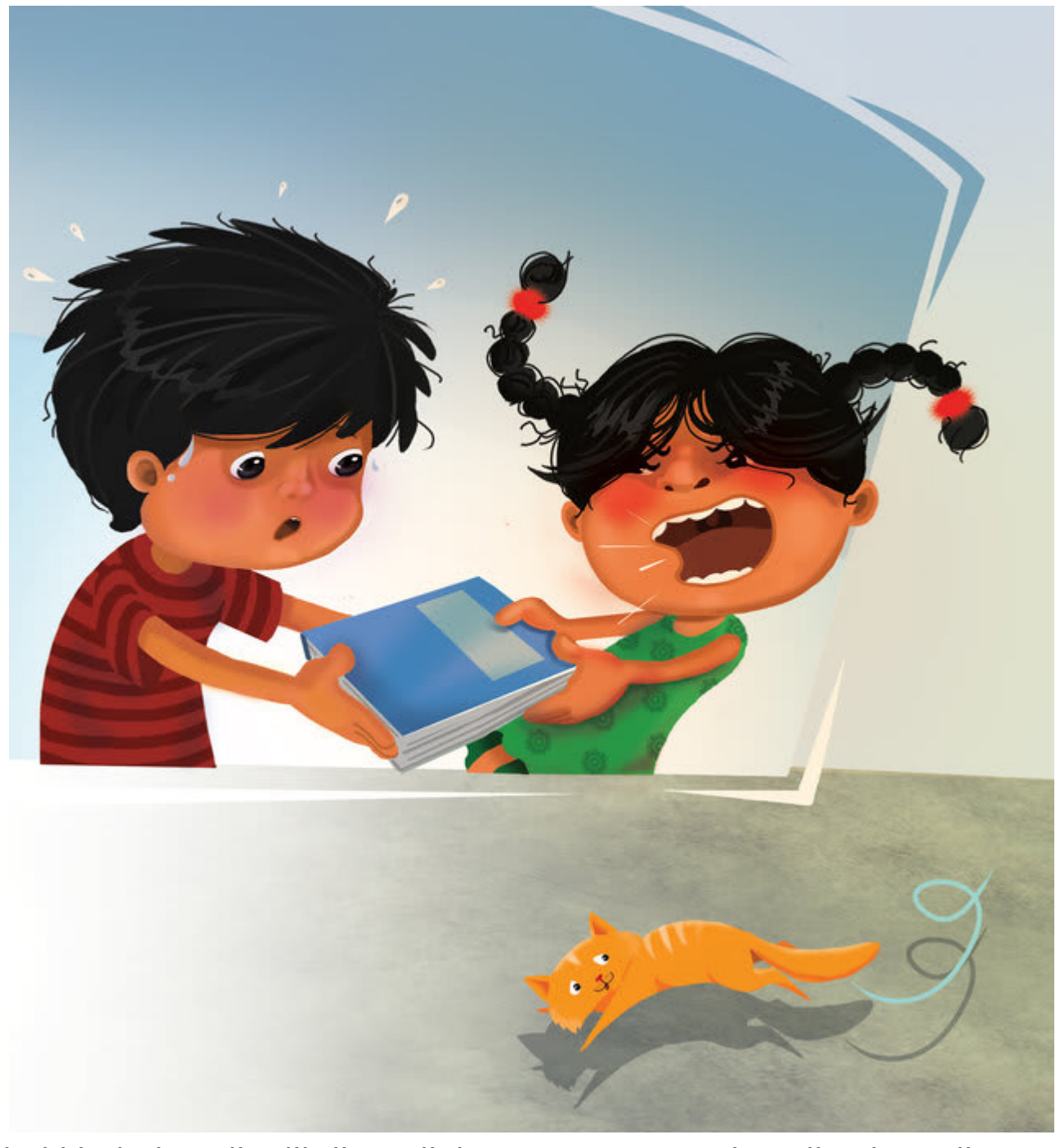
Rimi kitobni tortib olibdi! Endi Jitu umuman mutolaa qila olmaydi.