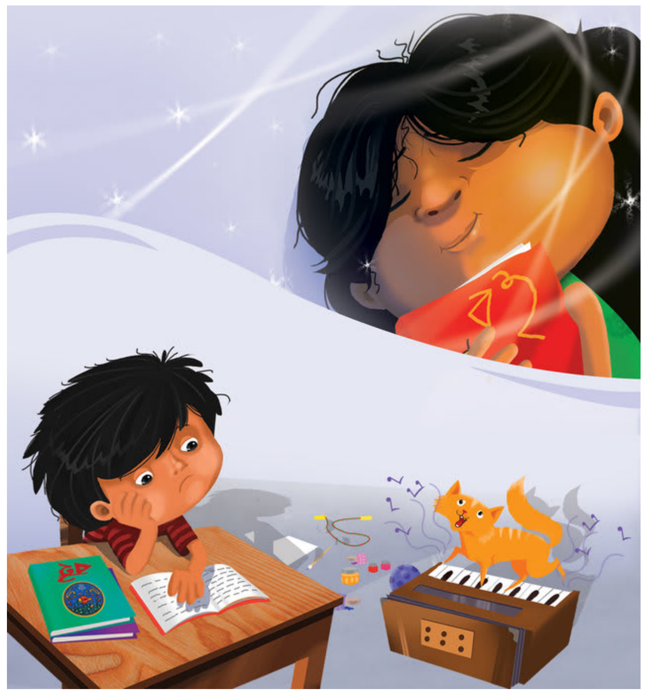
Qizil kitob esa, doim eng yaxshilaridan biri bo'lib qoladi!