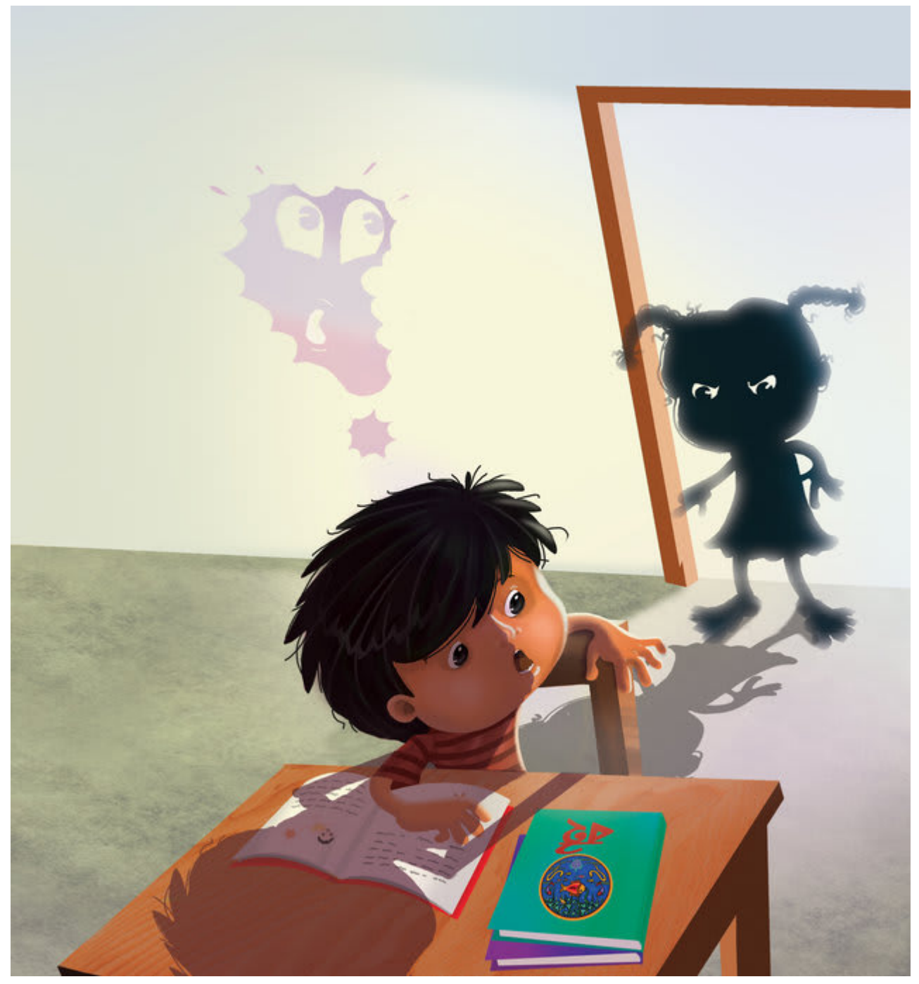
Ertasi kuni Rimi xuddi shu qilig'ini takrorlabdi.

U: "Men o'qishni xohlayman. Menga qizil kitobni ber" debdi.