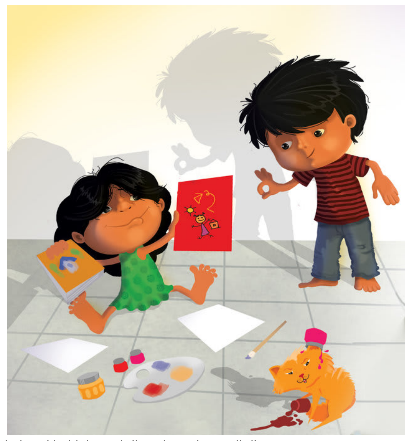
Rimi o'z kitobini yasabdi va Jituga ko'rsatibdi.

"Voy Rimi! " debdi Jitu. "Sening kitobing ajoyib ko'rinishga kelibdi!"