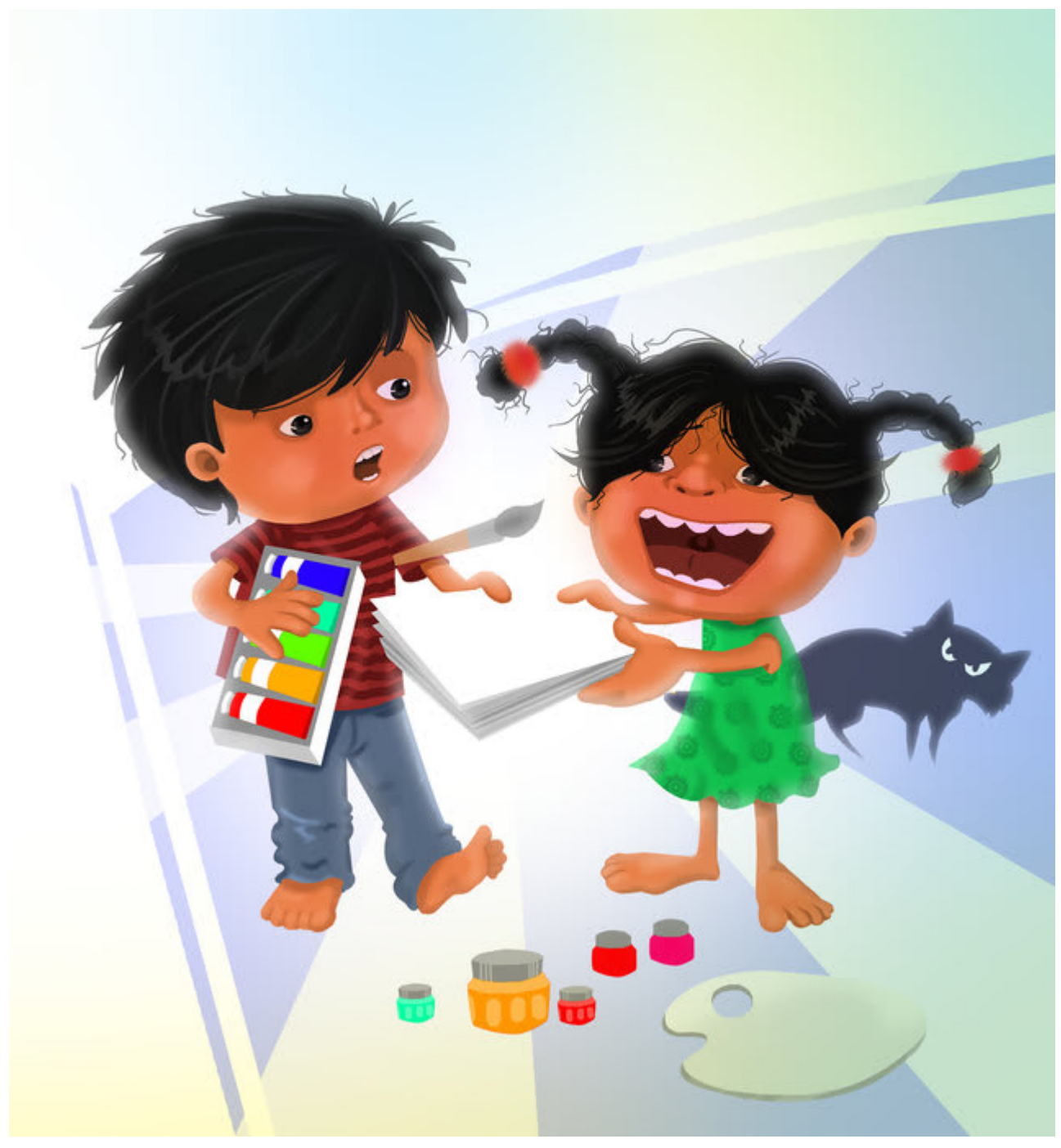
Rimi xursand bo'lib ketibdi. U Jitudan qog'oz va bo'yoqlar so'rabdi.