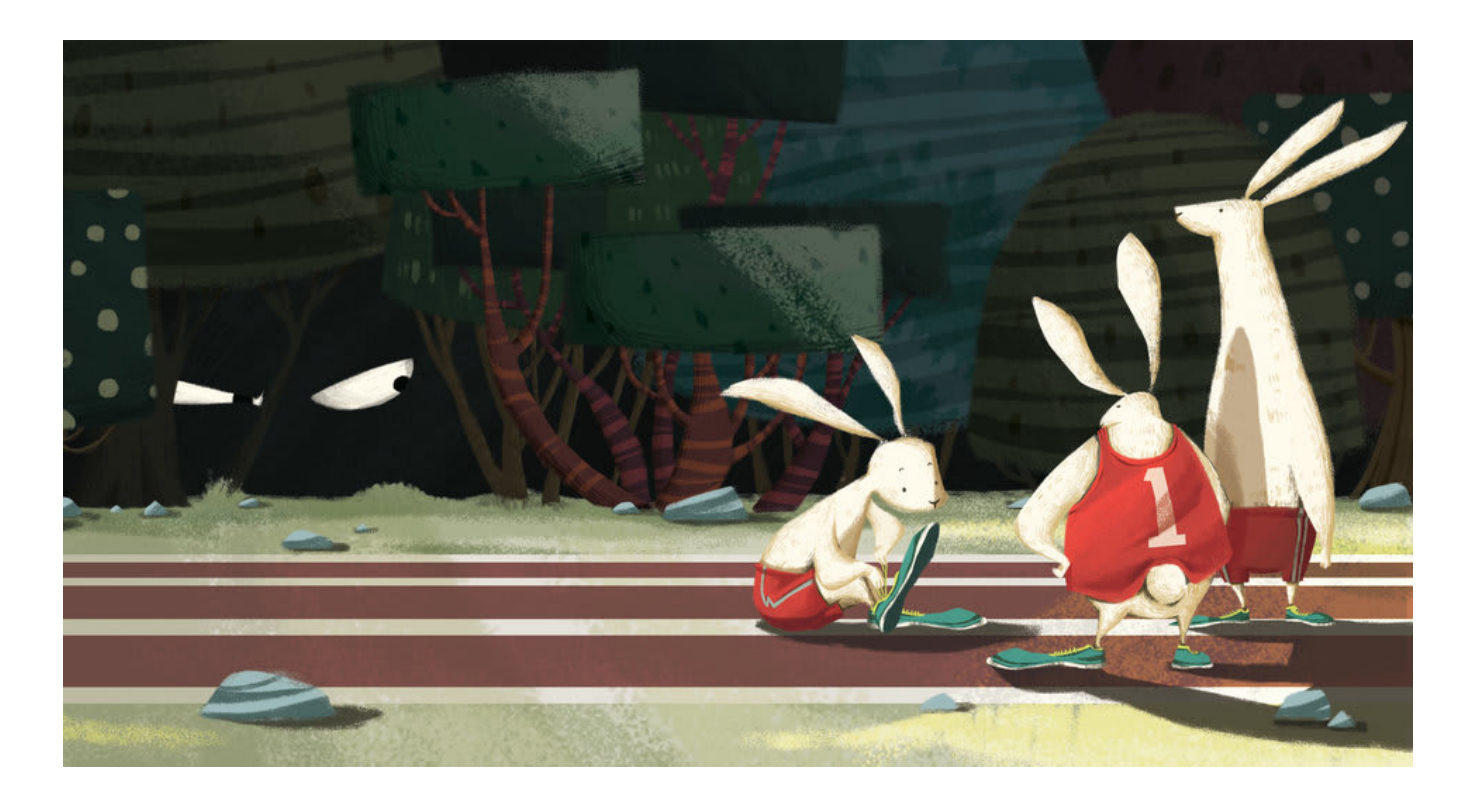
"Shundaymi? Grrrr... "

Timsoh yanada g'azablanibdi. "Bu poyafzal quyonga tegishli bo'lishi kerak!"