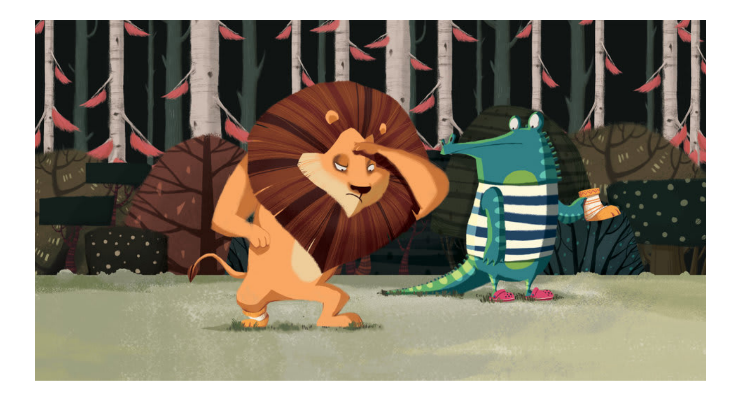
"Men poyabzalimni qidiryapman", debdi sher. "Mabodo ko'rmadingmi, timsoh?"