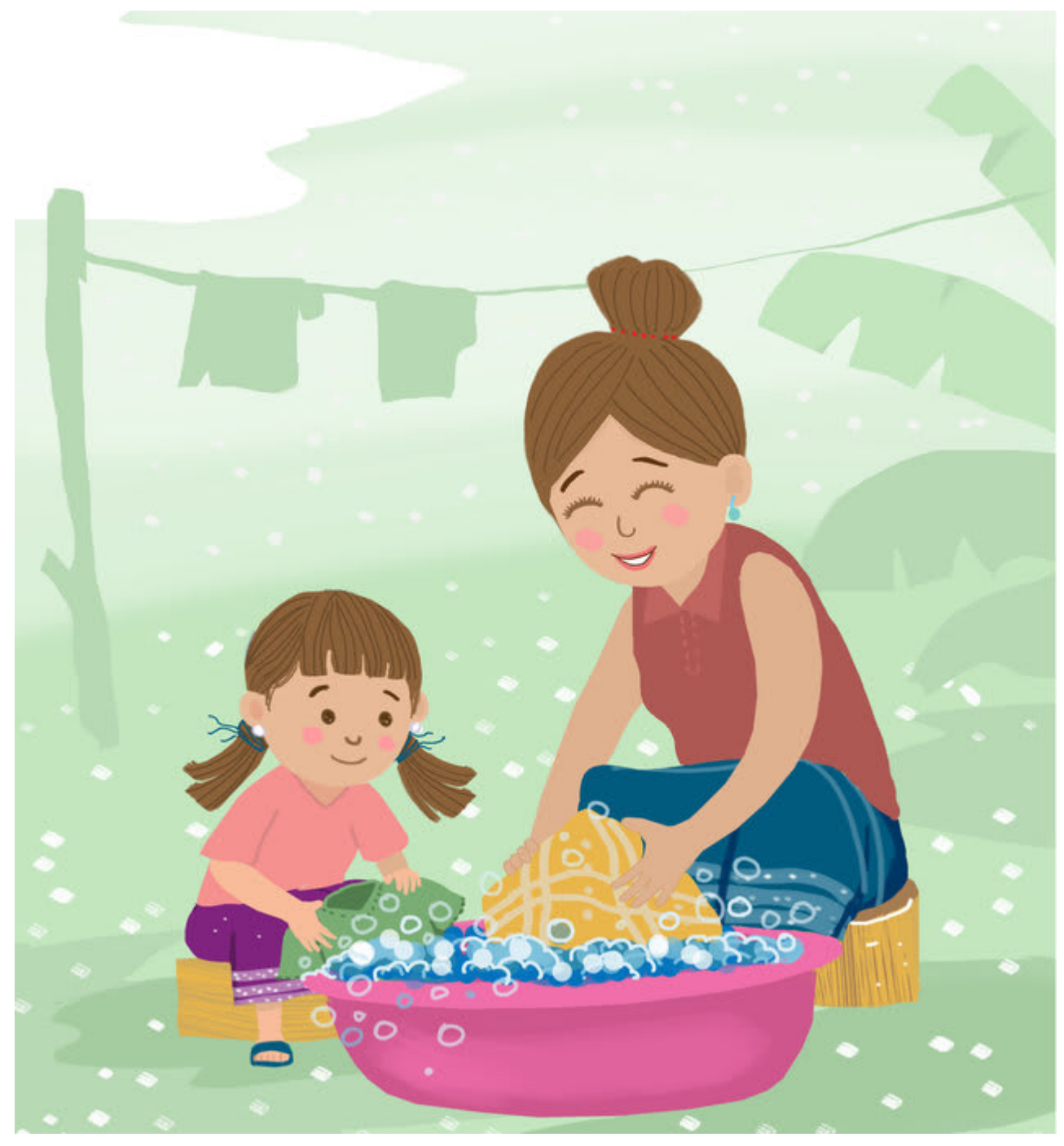
U bizning kiyimlarimizni yuvayotganlarida, men ham kir yuvishni o'rganaman.