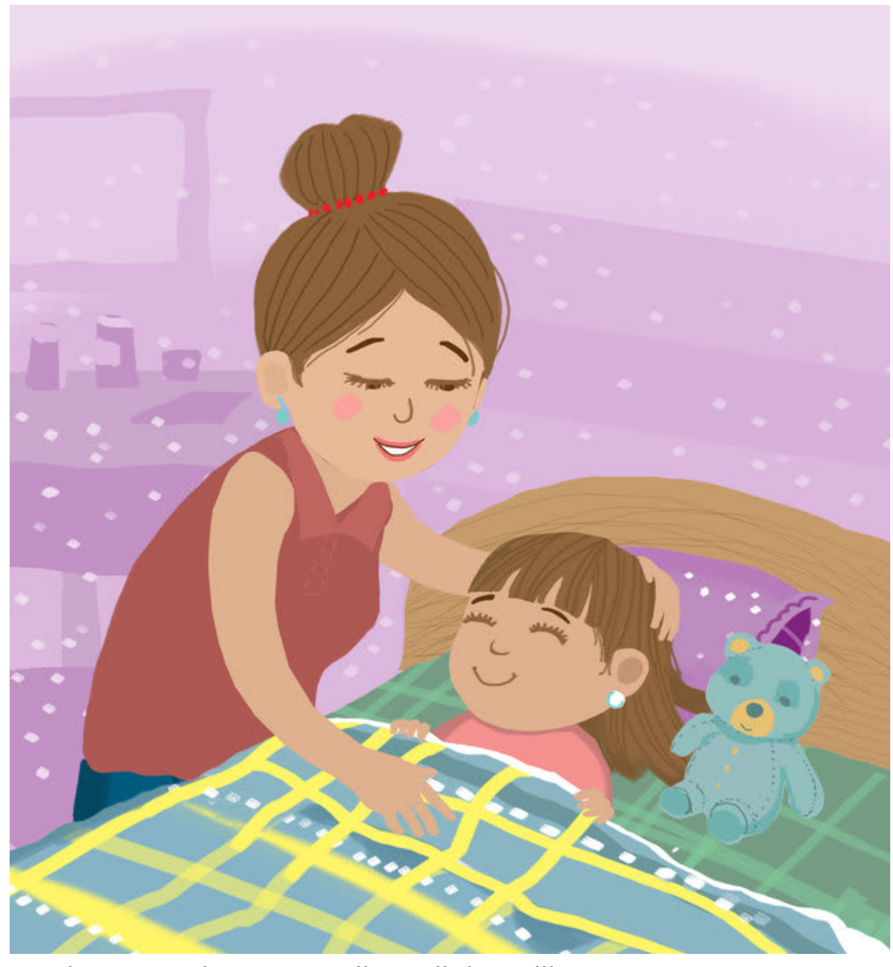
Uyqusirasam, oyim menga alla aytib beradilar.