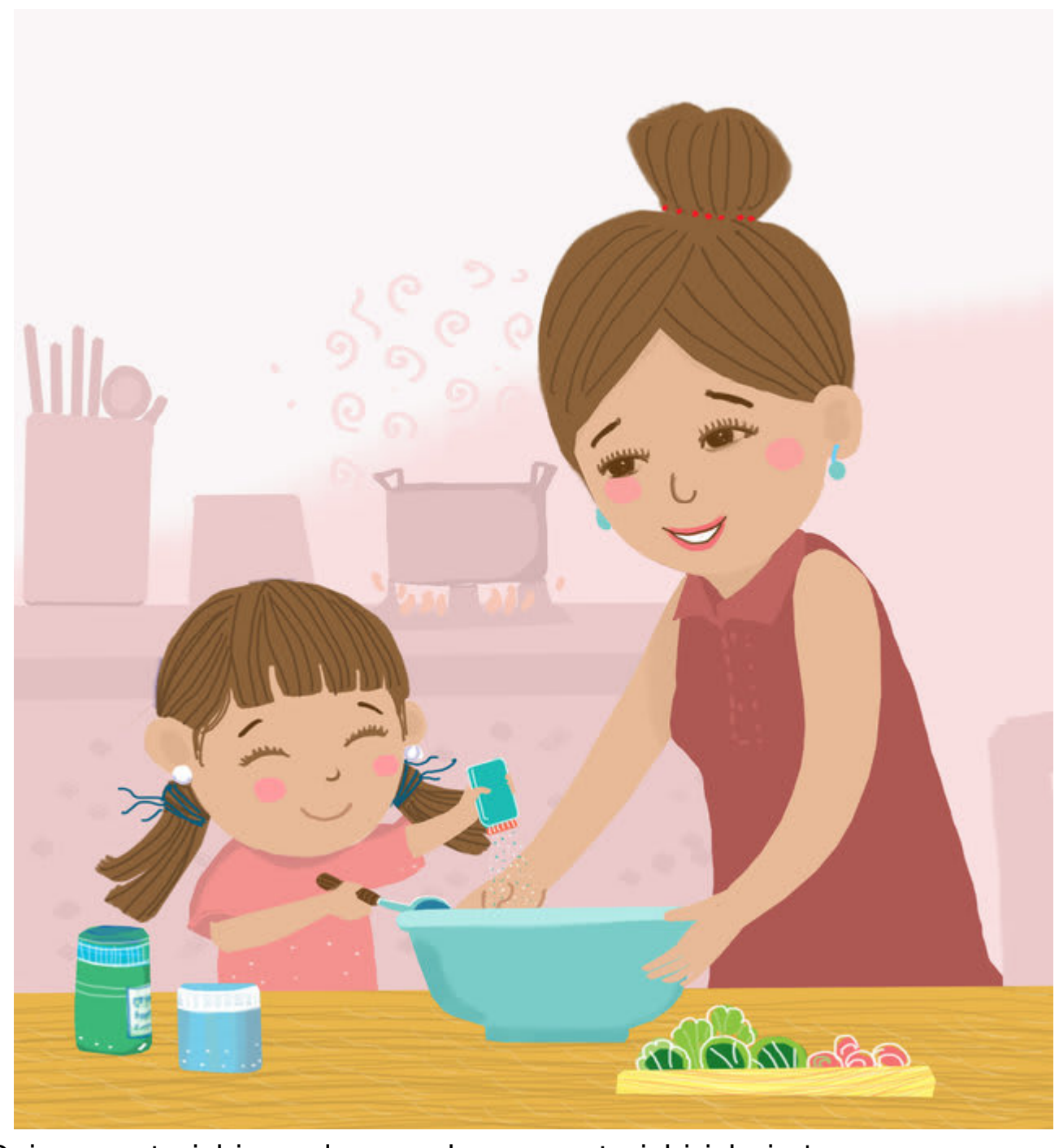
Oyim ovqat pishirganda, men ham ovqat pishirishni o'rganaman.