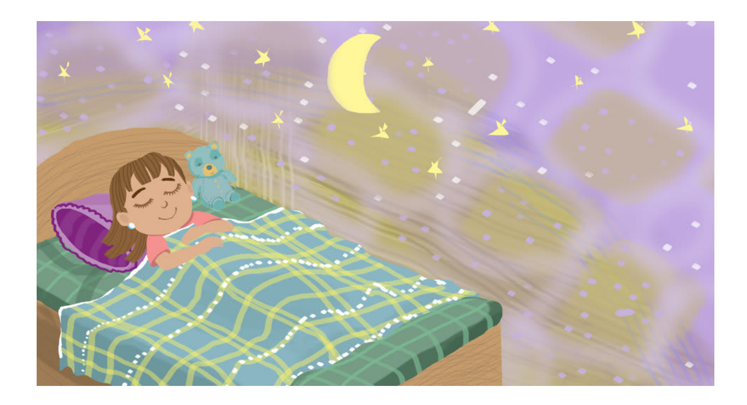
Men oyimni juda yaxshi ko'raman!