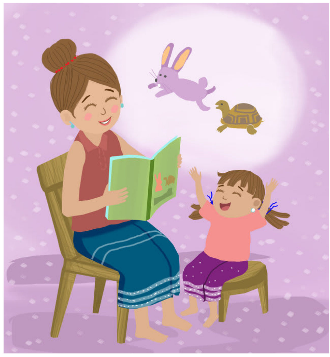
Yotishdan avval, oyim menga hikoyalar aytib beradilar.