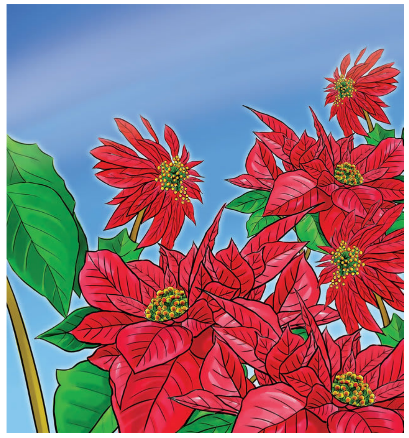
Poinsettiyaning qizil barglari chayqalib, ularning hidlari bog'imni to'ldirmoqda.

Poinsettiya gulining ilmiy nomi Euphorbia pulcherrima .