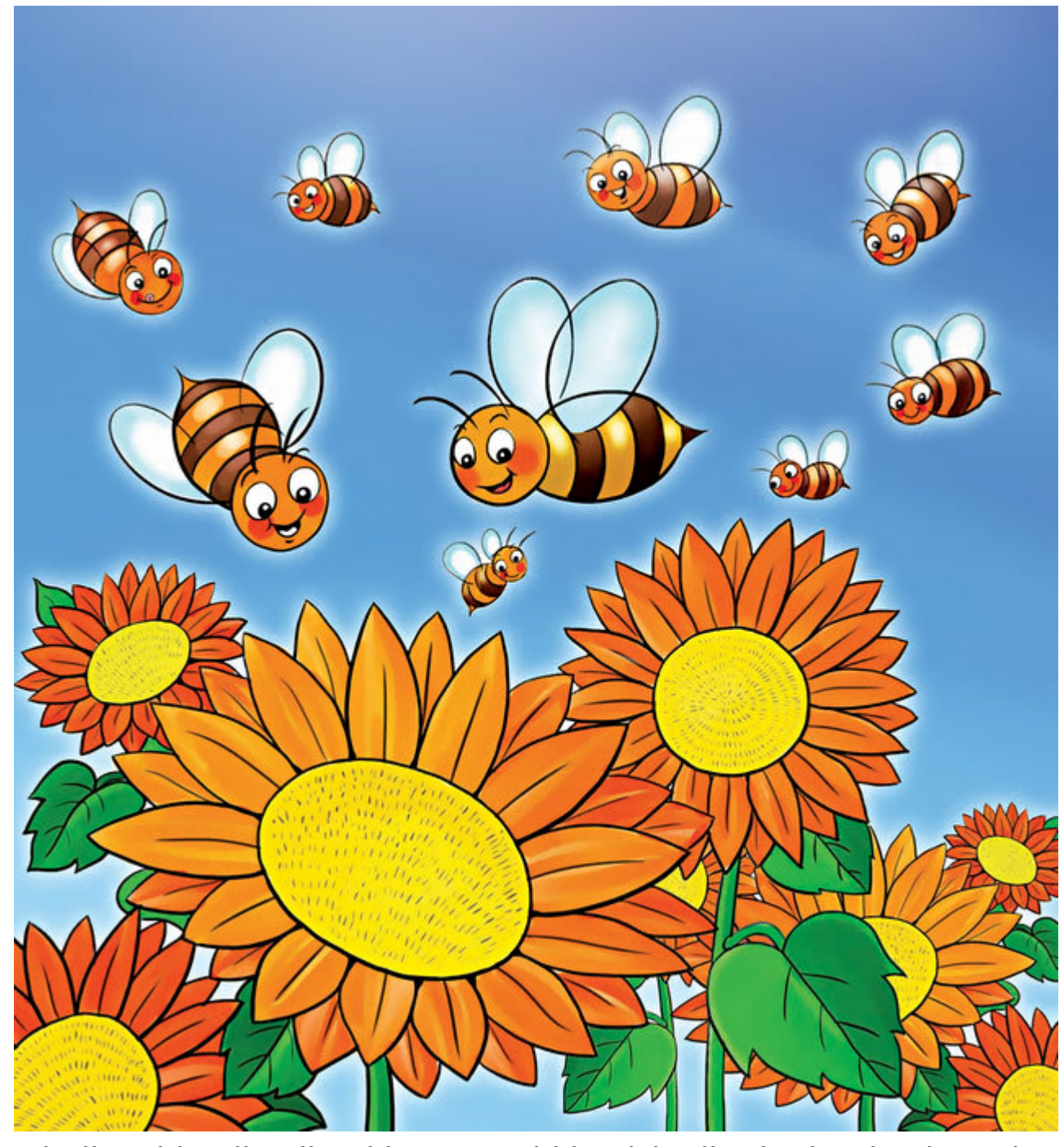
Asalarilar chiroyli gullarni ham yaxshi ko'rishadi. Ular har kuni mening bog'im atrofida baxtiyor g'uvillashadi.