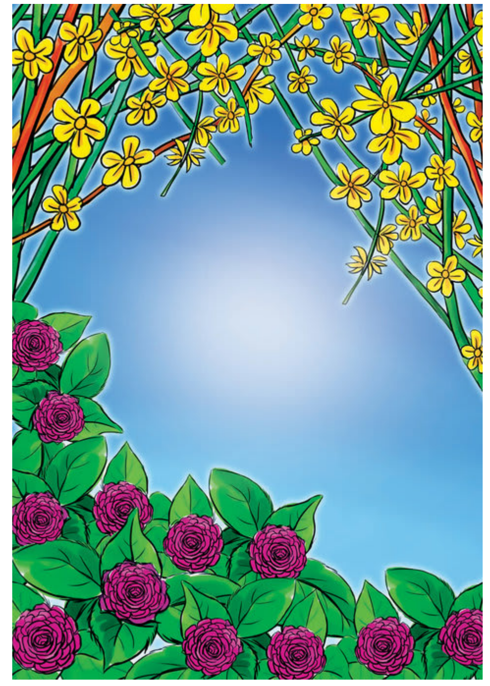
Qara! Yasmin gullabdi. Uning mayda gullari yoqimli hidga ega.

Baxmal gullar ham juda chiroyli va binafsha rangga kirib ochilibdi. Binafsha rang gulning ilmiy nomi Amaranthus caudatus .