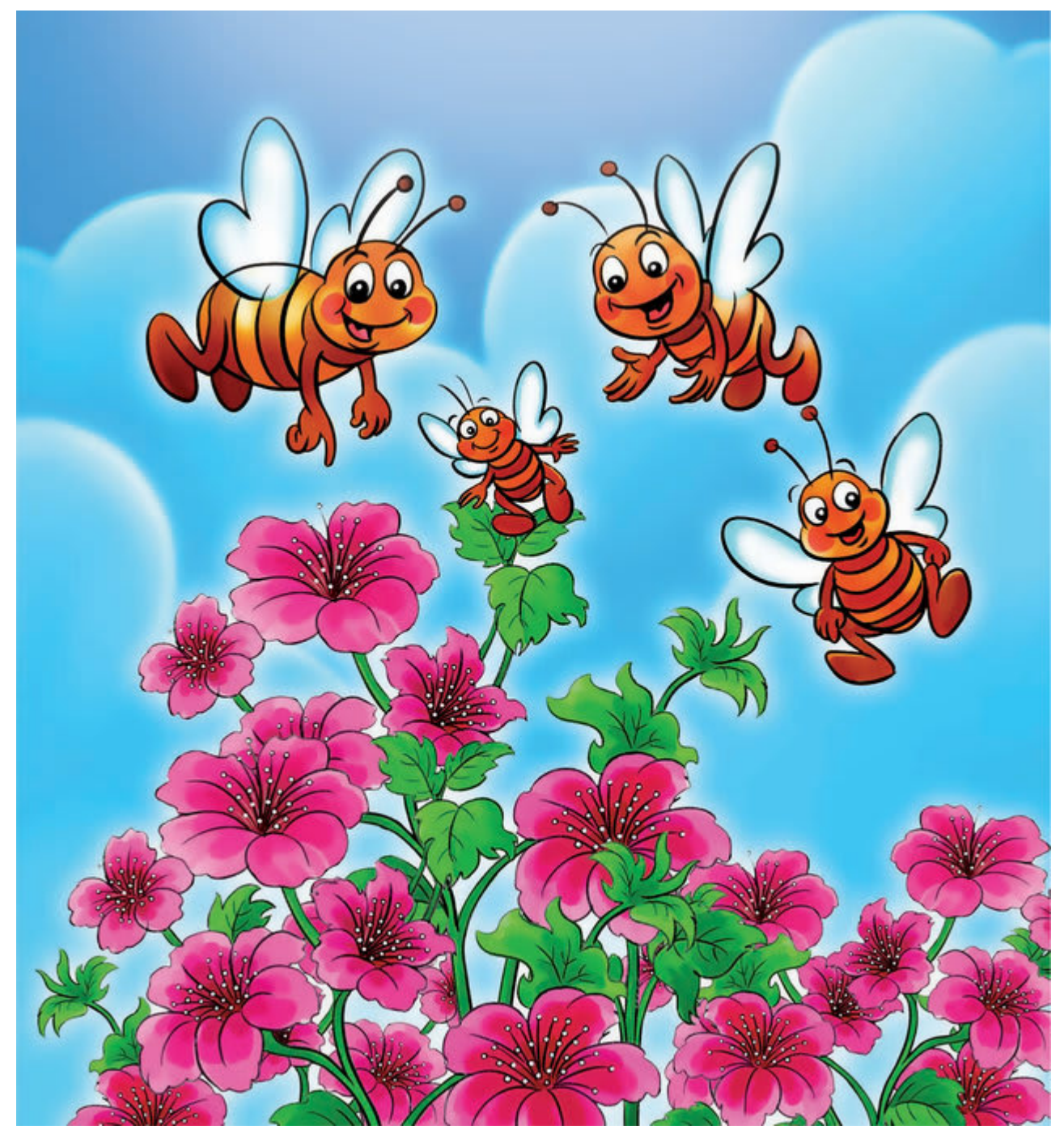
Hatto katta arilar ham guldan gulga qo'nib, bog'imga tashrif buyurishni yaxshi ko'rishadi.