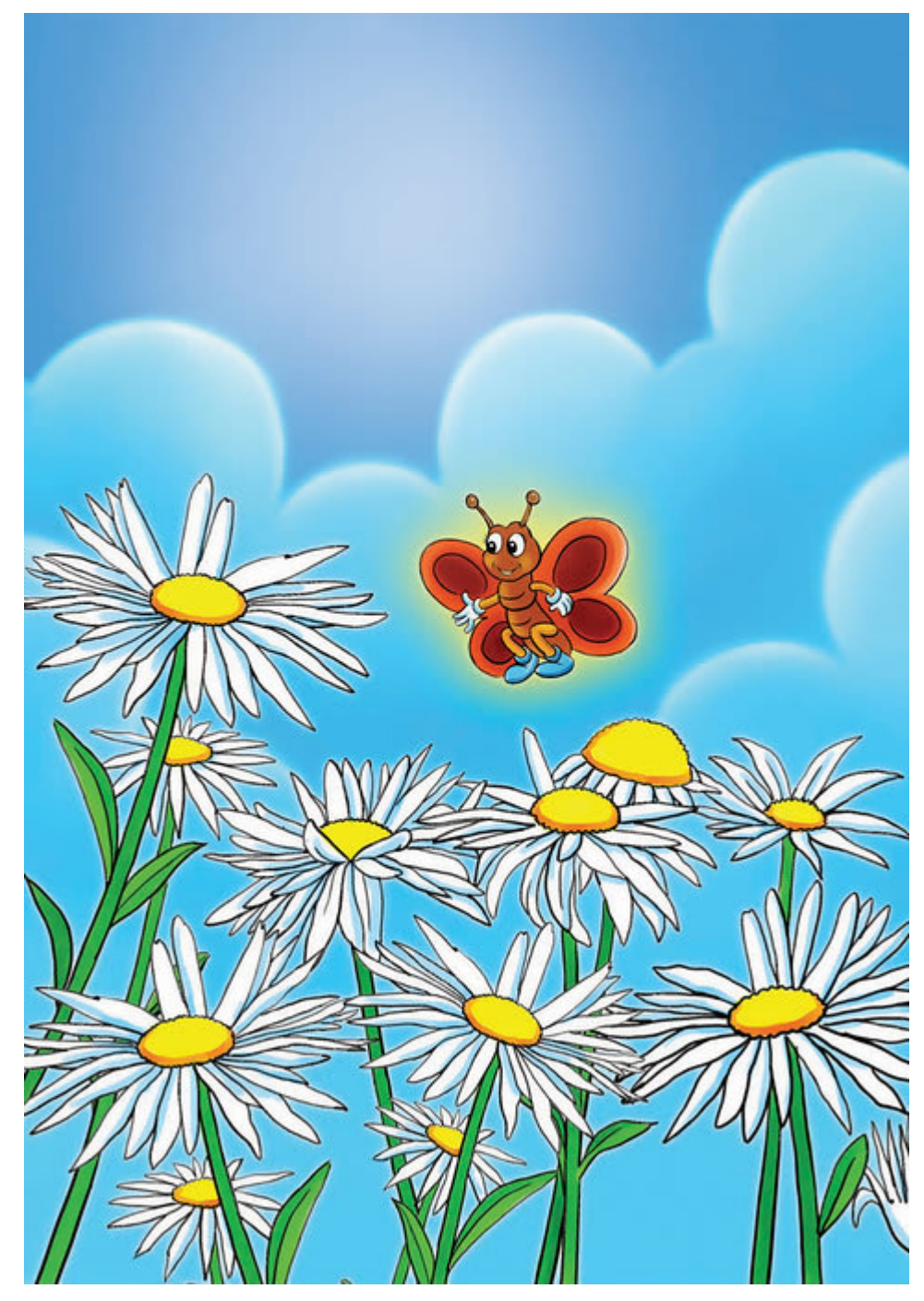
Bu kichkina kapalak har kuni bog'imga tashrif buyuradi. U uyatchan, lekin u mening do'stim ekanligini bilaman.