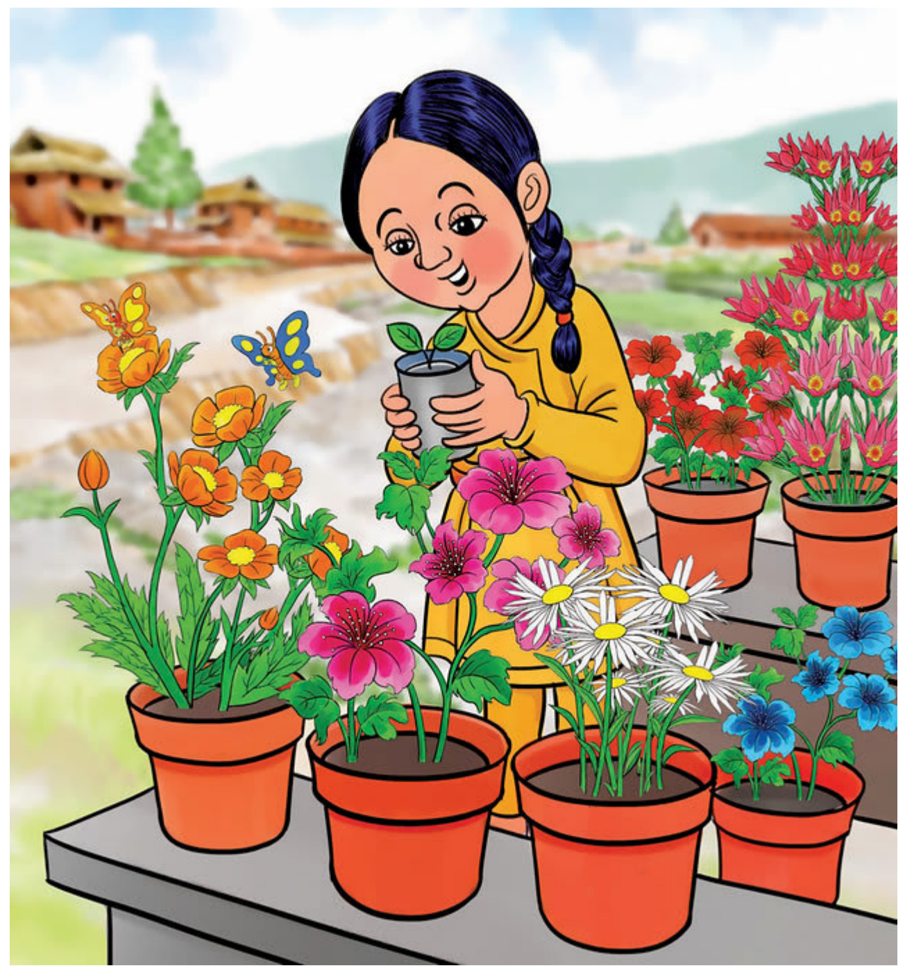
Men go'zal bog'imni yaxshi ko'raman.