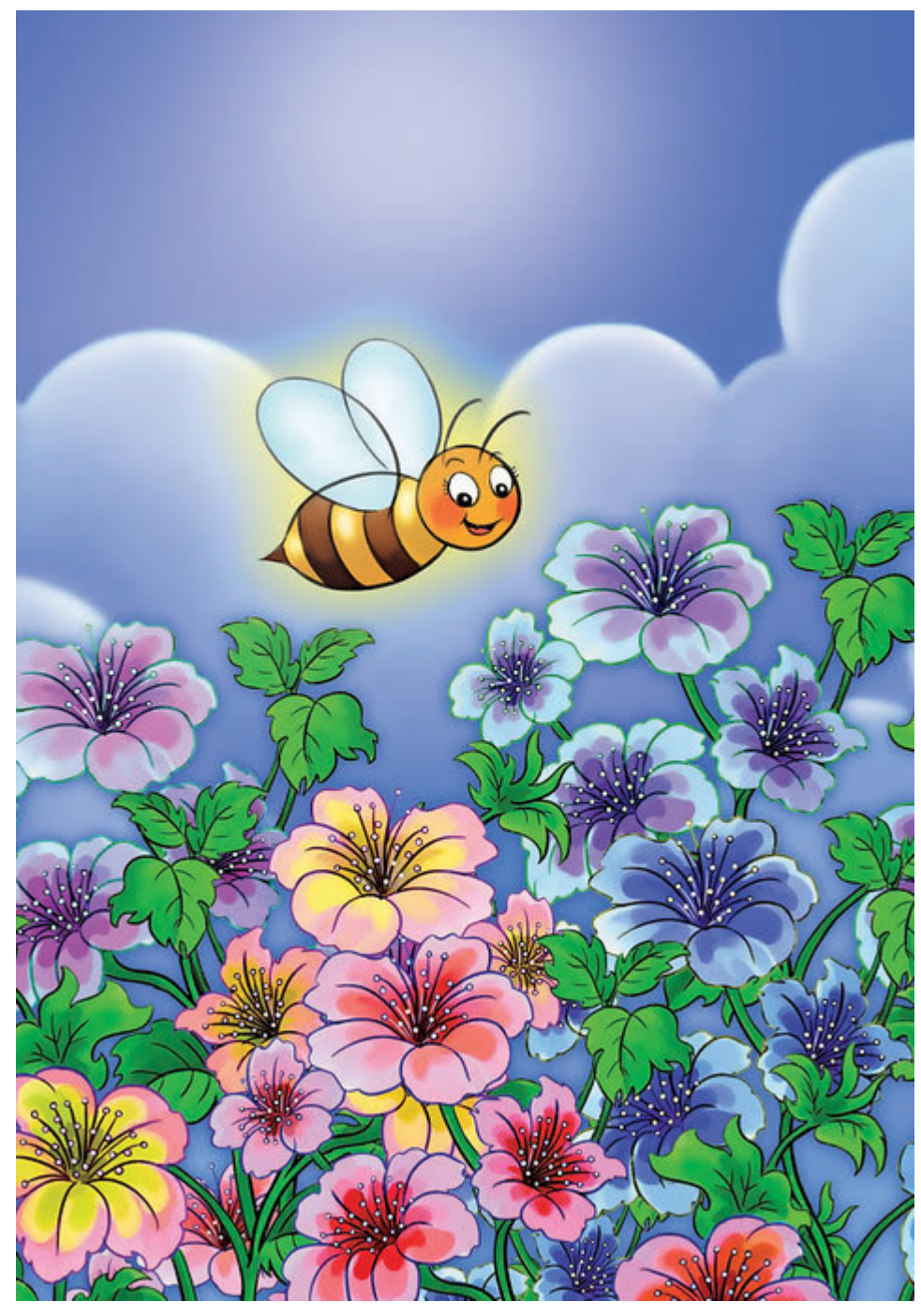
Bu kichkina asal asalari eng rang barang gullarni yaxshi ko'radi. U uyatchan, lekin u mening do'stim ekanligini bilaman.