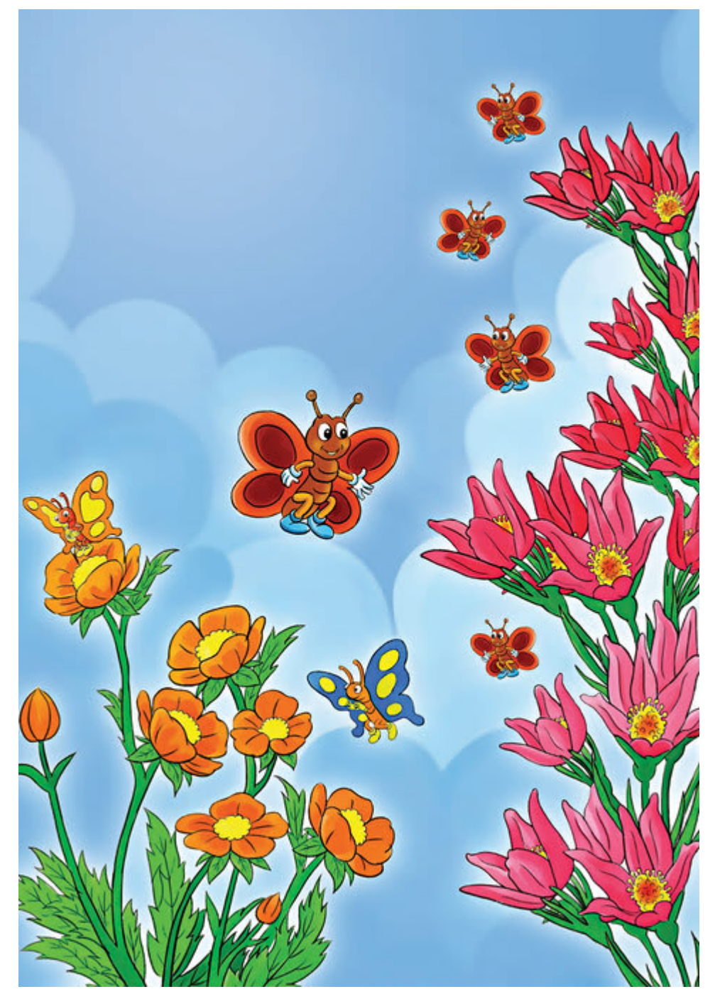
Mening bog'imda juda ko'p chiroyli gullar bor. Har doim kapalaklar bilan to'la. Ular gullarni yaxshi ko'rishadi.