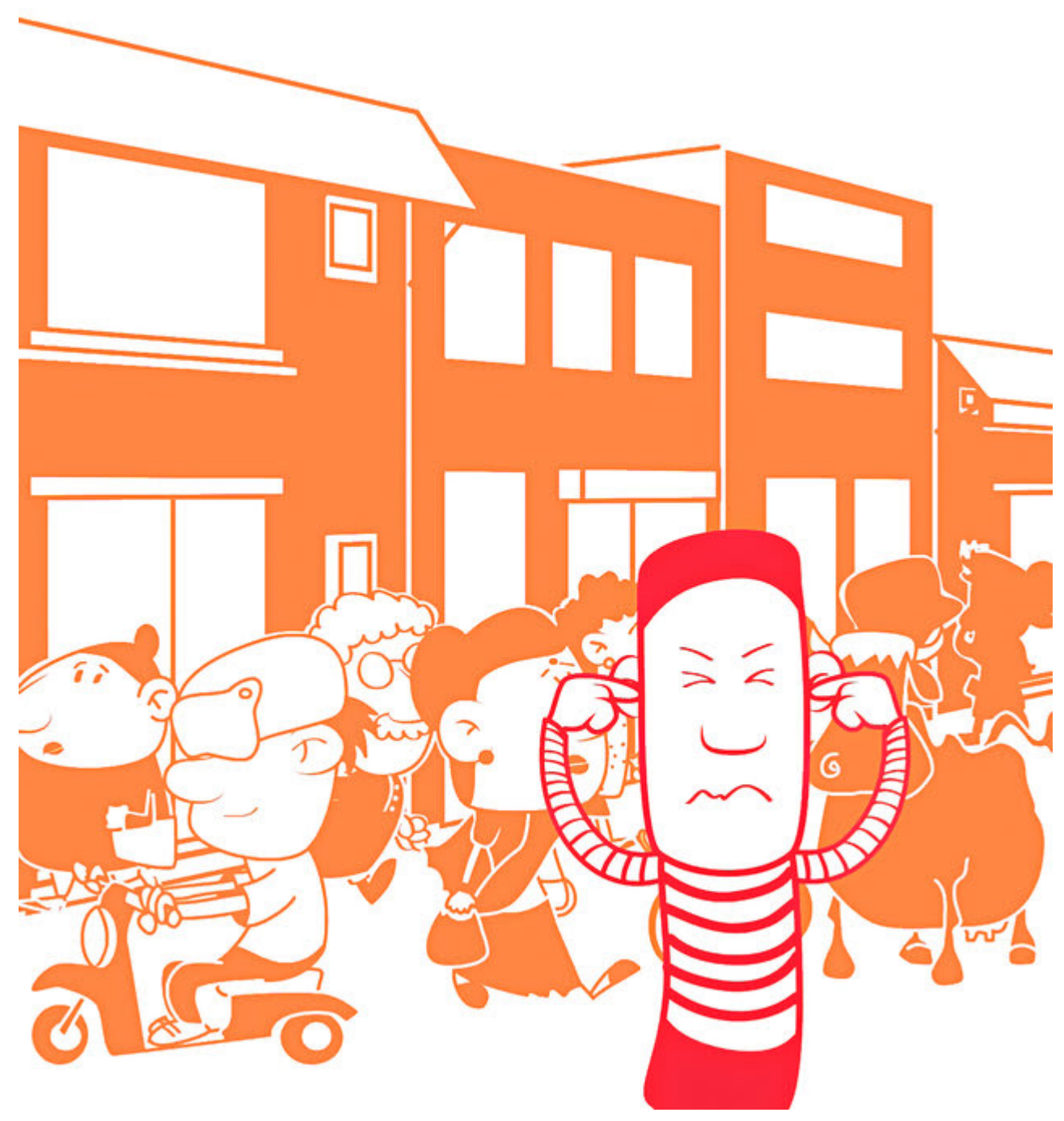
Shahar juda gavjum va shovqinli.