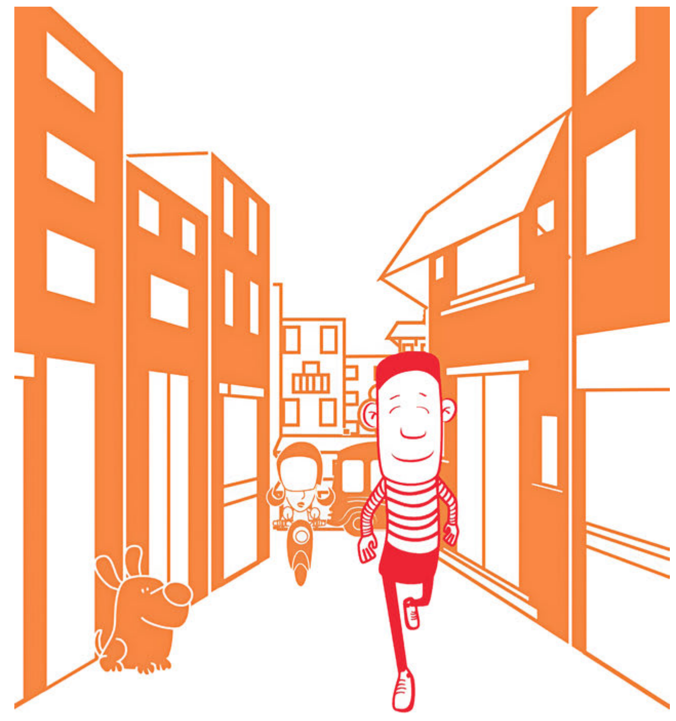
Kamol uyiga ketmoqda. U ko'chalarni uzun qadamlar bilan bosib o'tmoqda.