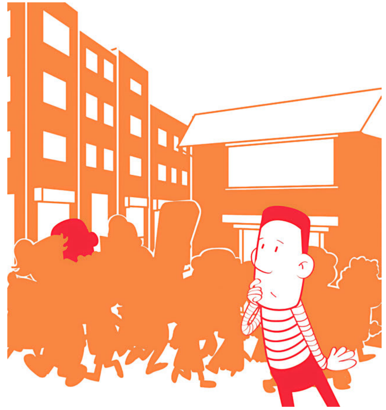
Kamol olamon orasidan do'sti Gaganni ko'rdi.