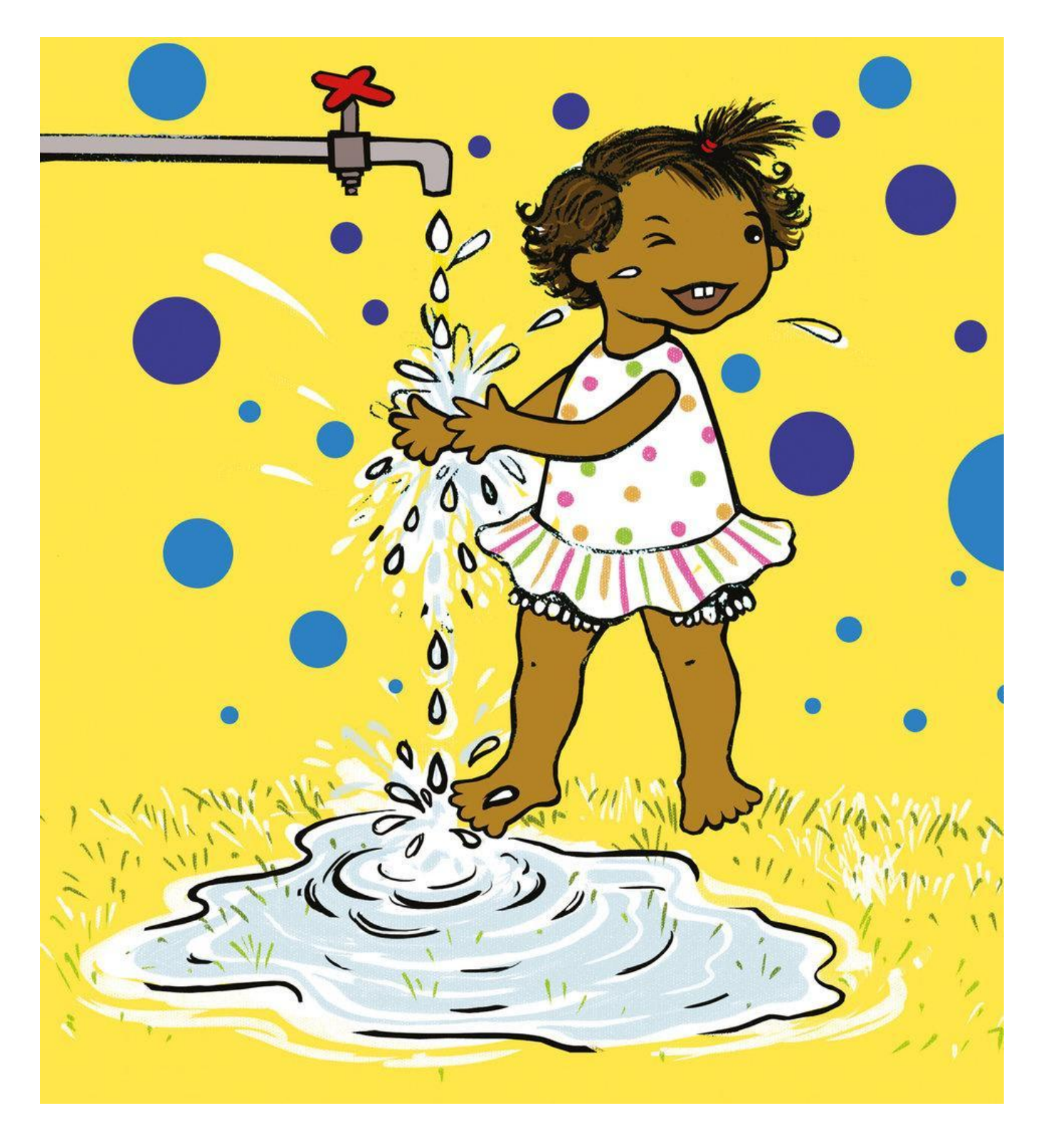
Drip, drip, drip jo'mrakdan suv tomar.