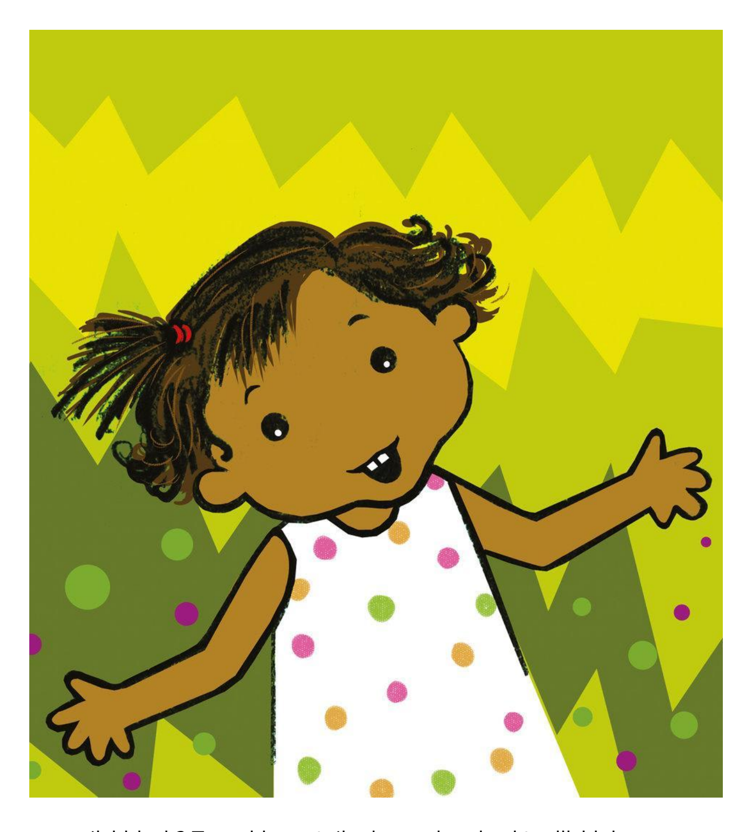
... va g'ichirlash? Tovushlarga to'la dunyo, barchasi topilishini kutmoqdami?