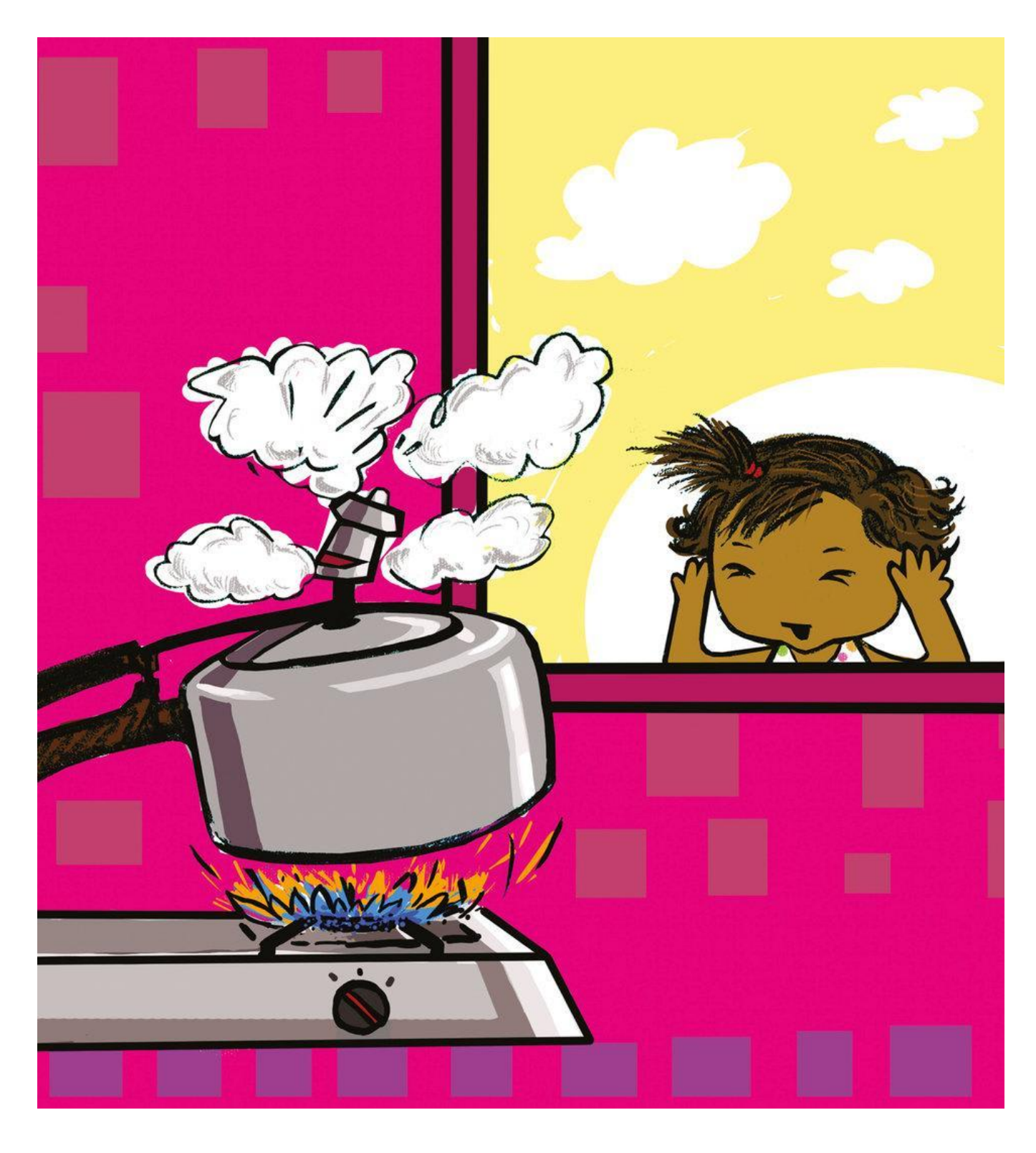
CHII... chovgum qaynaydi.