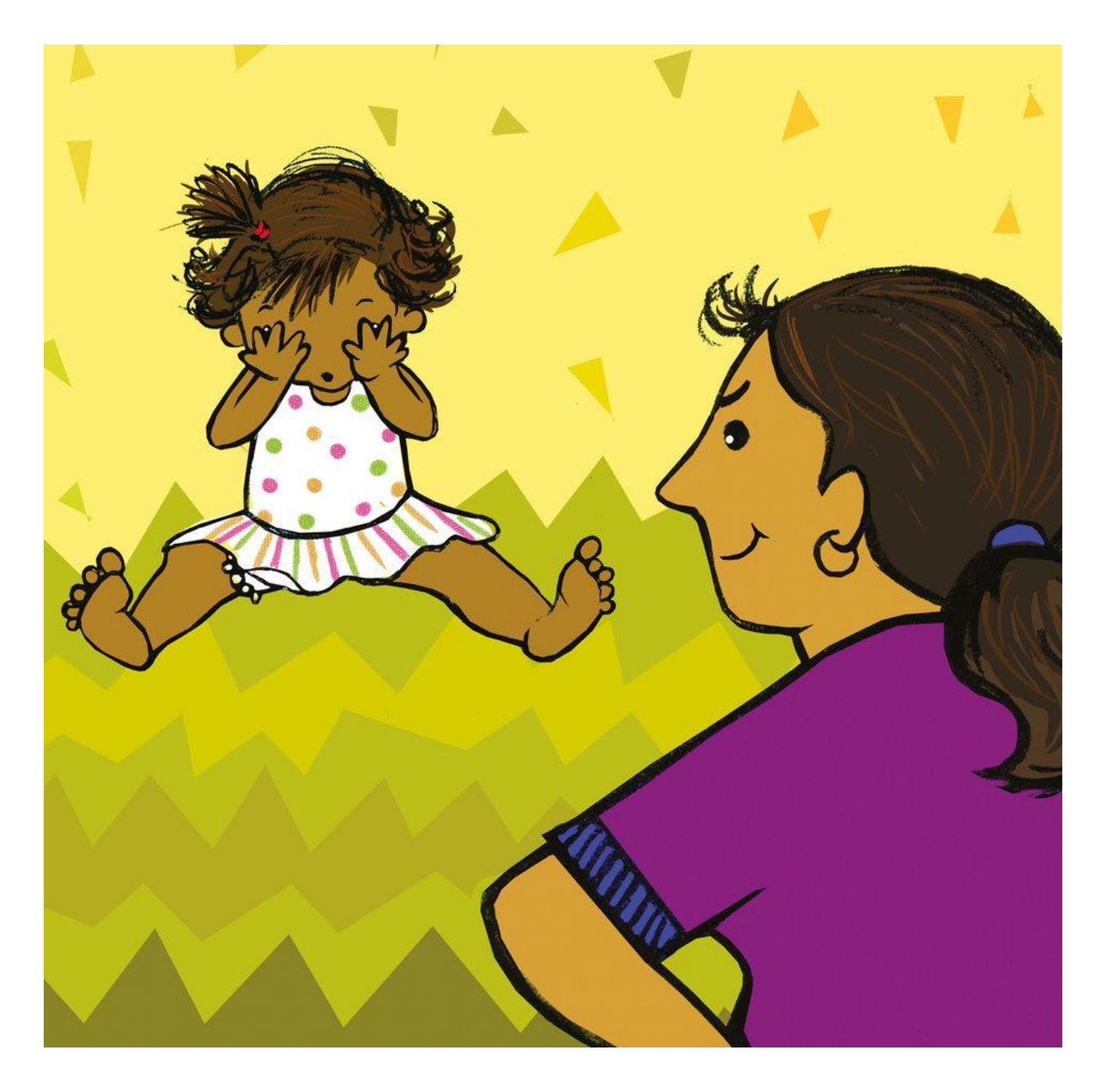
"Kichkintoyginam, nega siz kitoblaringizdan, o'yinchoqlaringizdan va mashinalaringizdan uzoqashib ketdingiz? Nima uchun? Bu yerda eshitadigan yoki ko'radigan hech narsa yo'q."