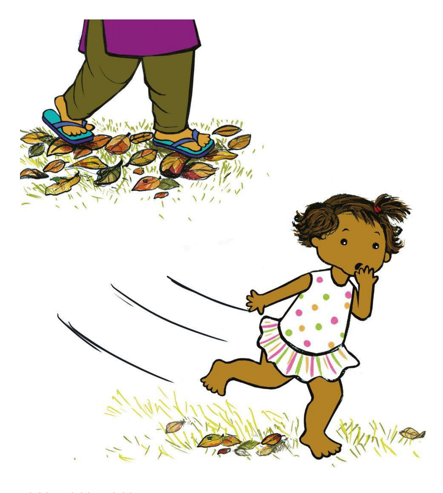
G'ichir, g'ichir, g'ichir... ... iya, men bu qanday tovushligini bilaman!