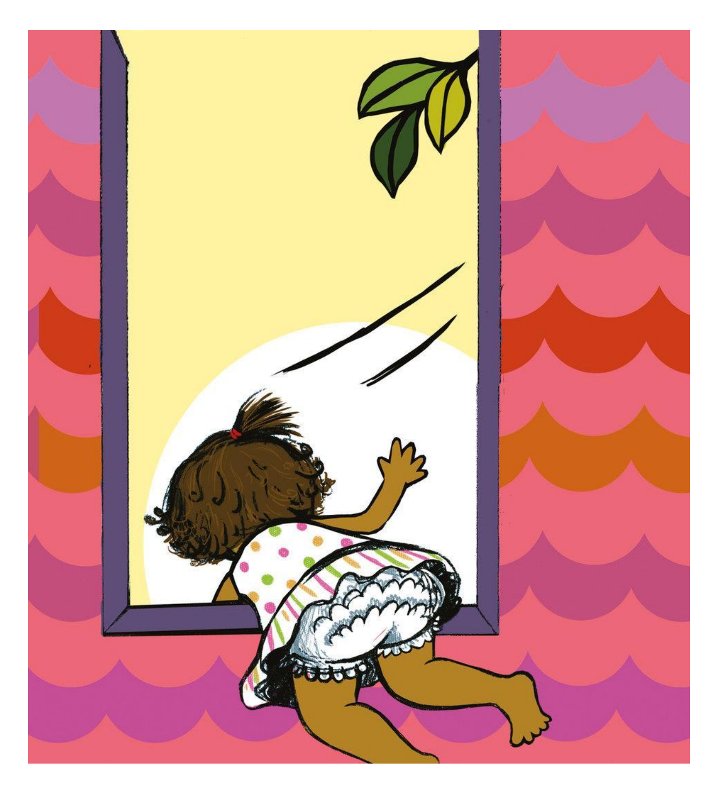
Bu quvnoq oyoqchalarni bir joyda ushlab turish qiyin,