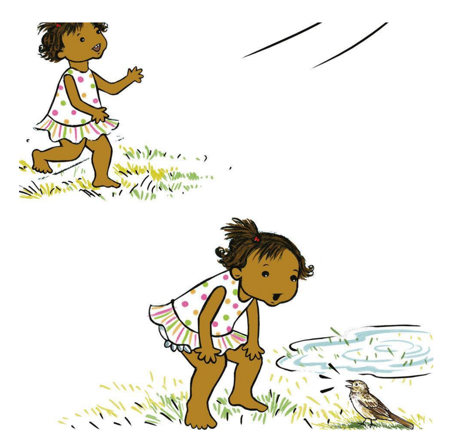
Atrofdagi tovushlarni tinglab, quvnab, yayra. Chip, chip, chip chumchuqlarni chorla.