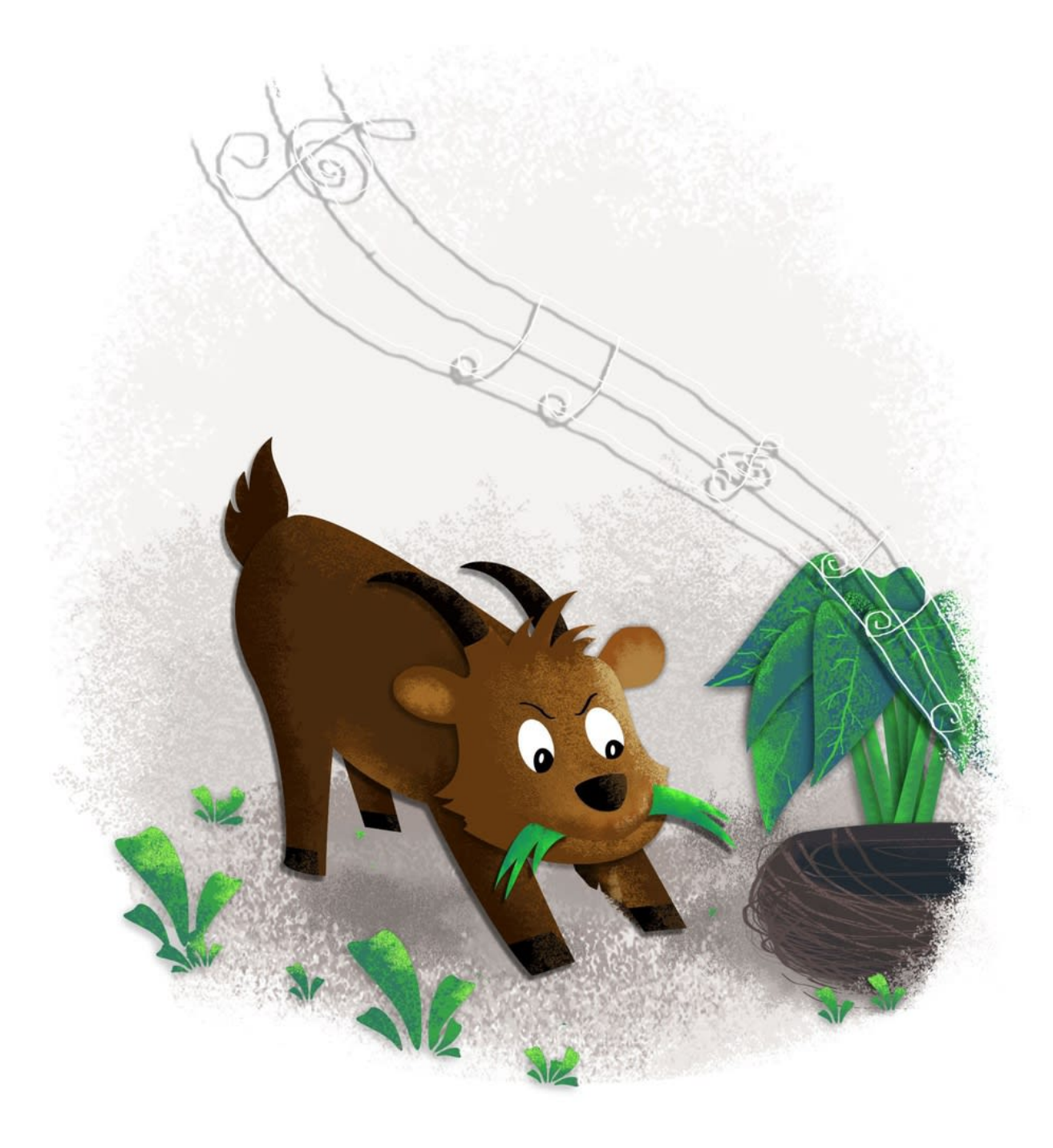
Chip Chip Chip.. Bu kimning ovozi?