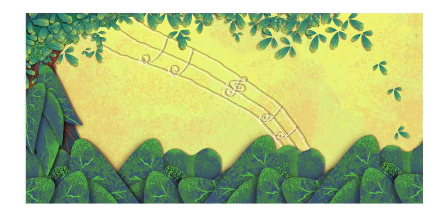
Bu kimning ovozi?