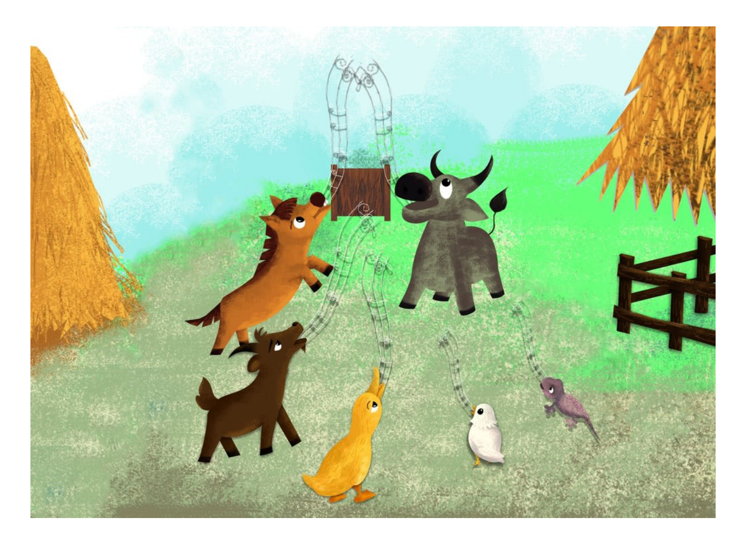
Ularning ovozi go'zal.