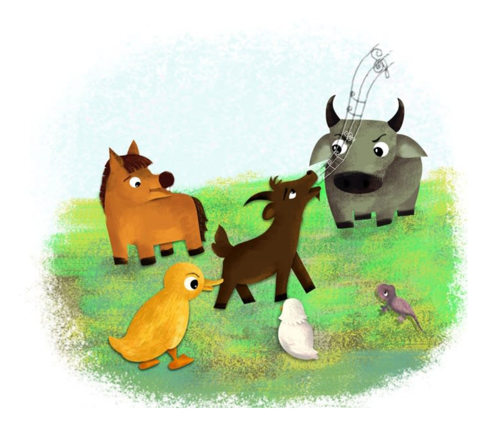
Echkining ovozi qanday? Baa Baa Baa