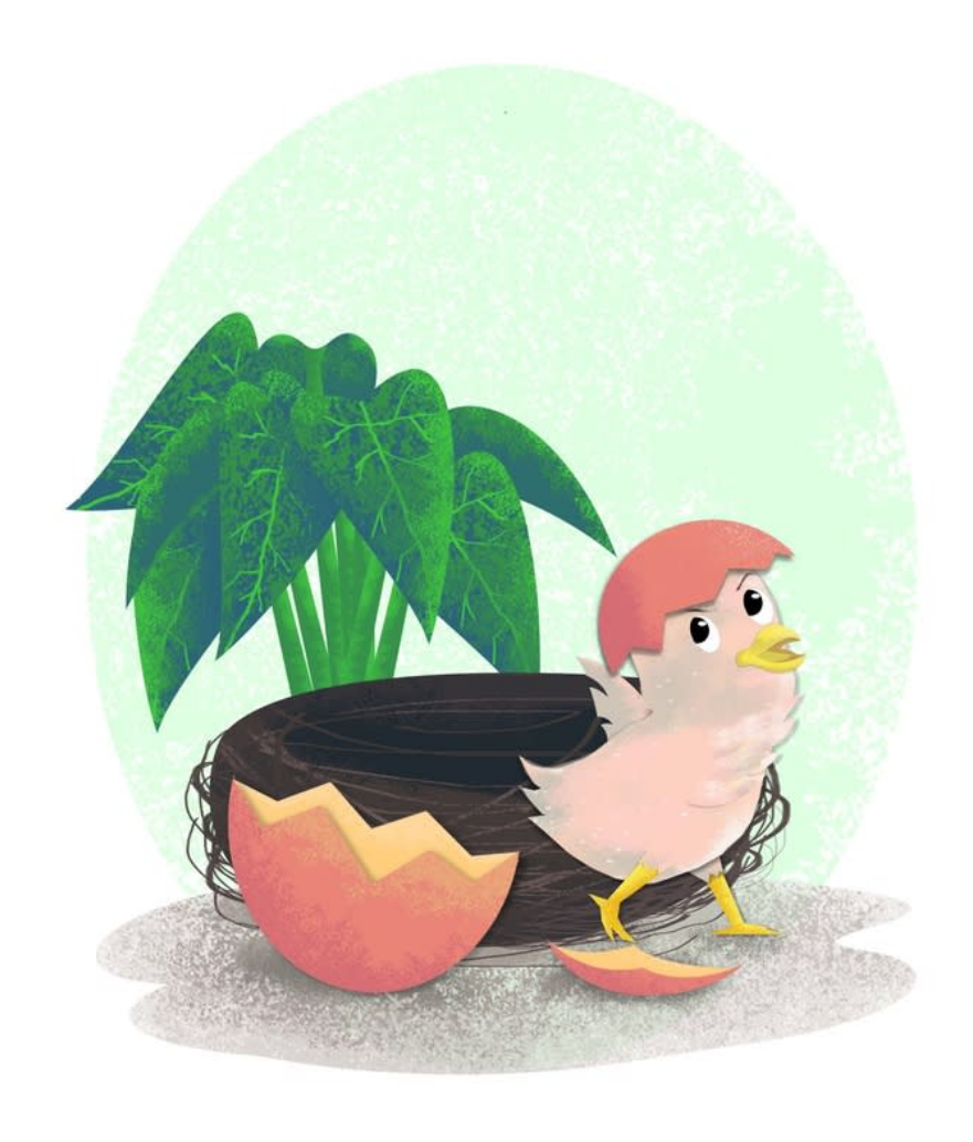
Bu jo'janing ovozi.