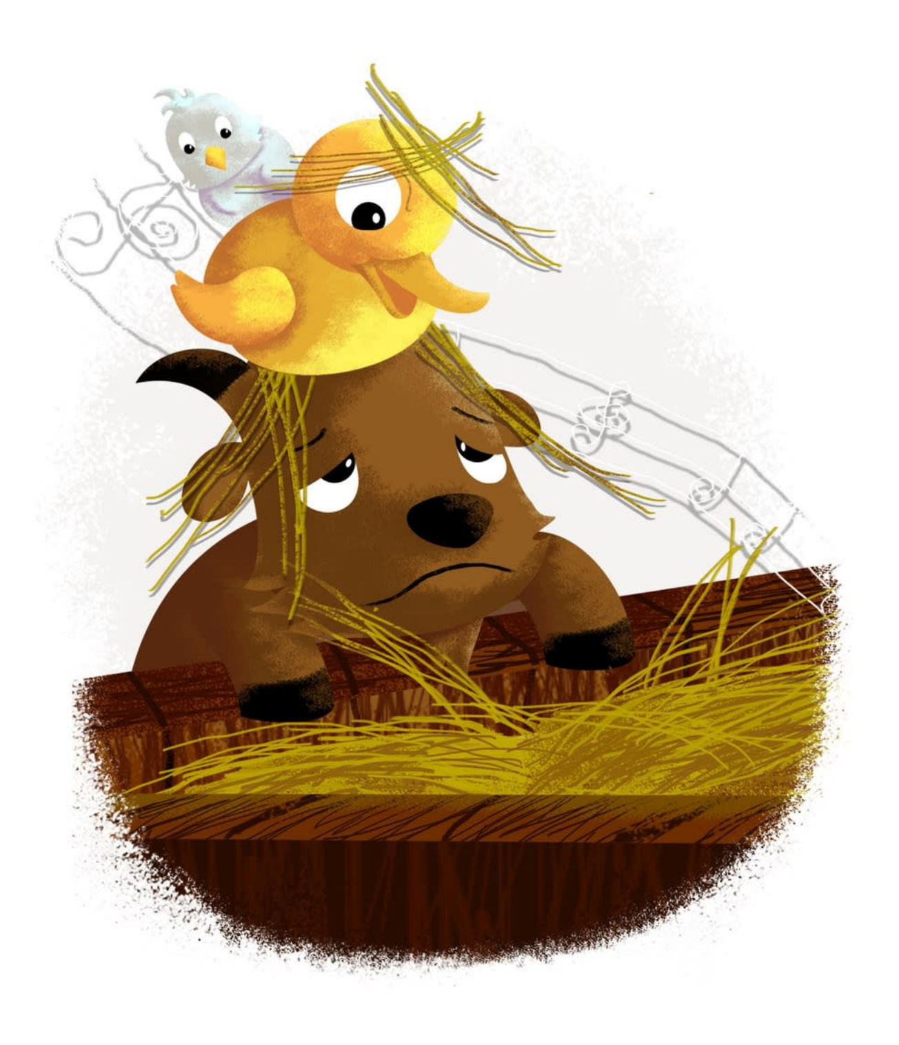
Muu Muu Bu kimning ovozi?