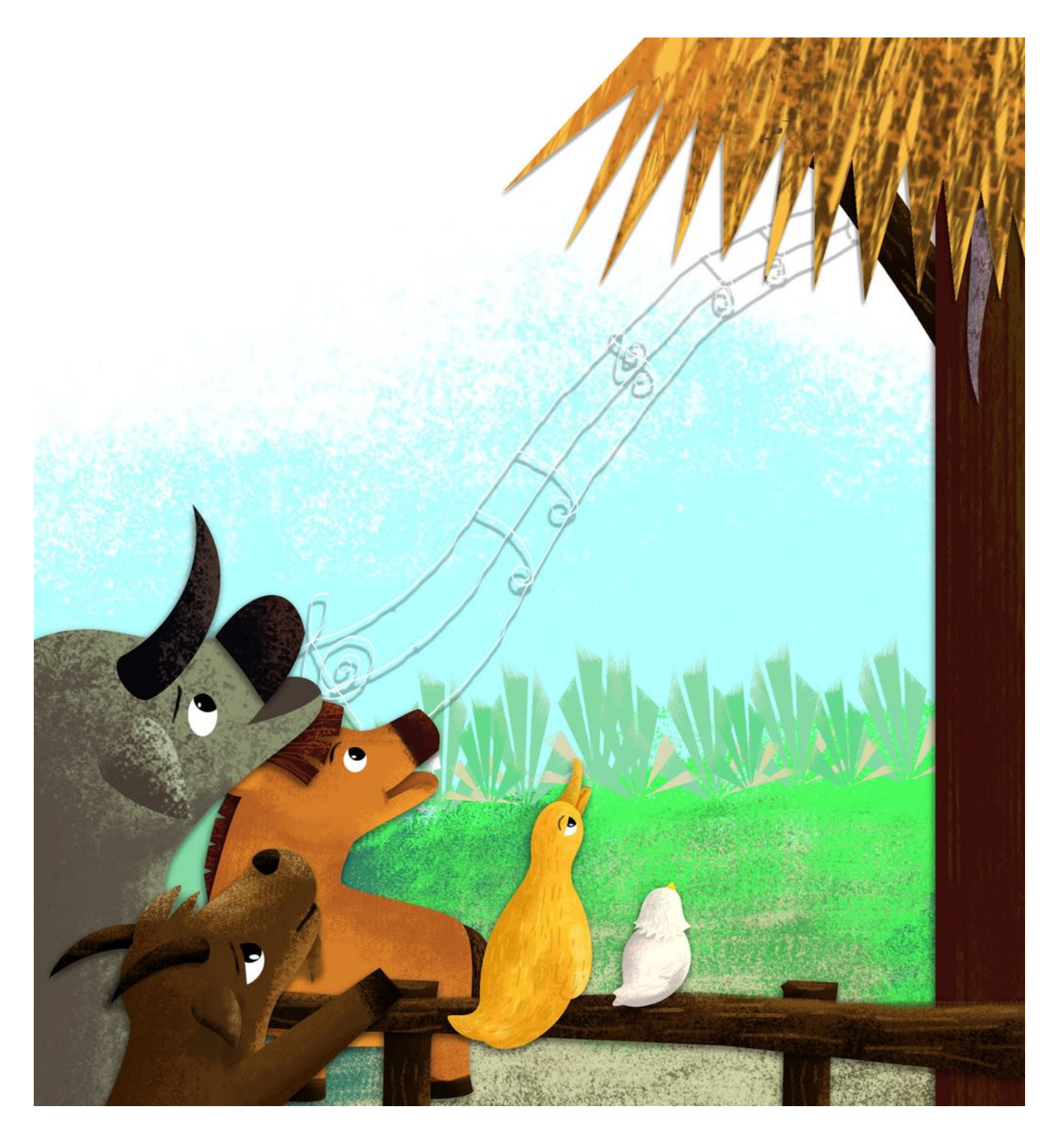
Chak Chak Bu kimning ovozi?