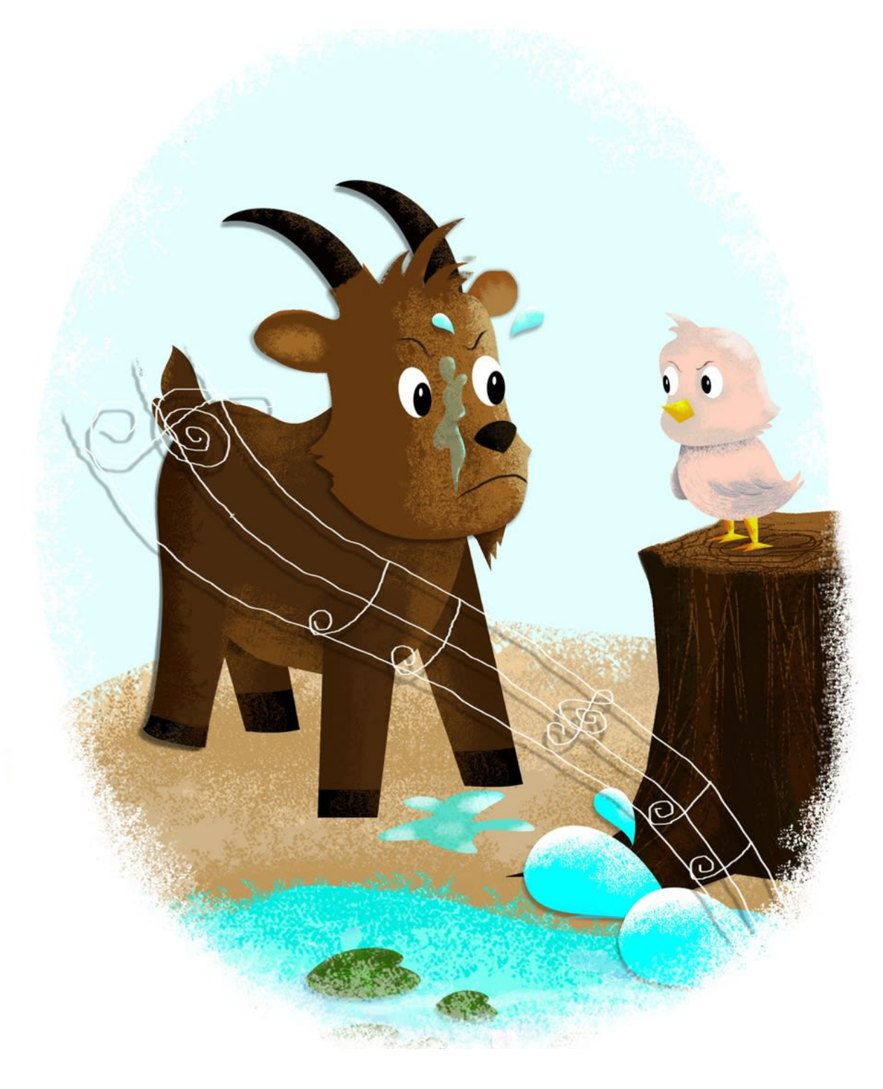
G'aq Gaq G'aq.. Bu kimning ovozi?