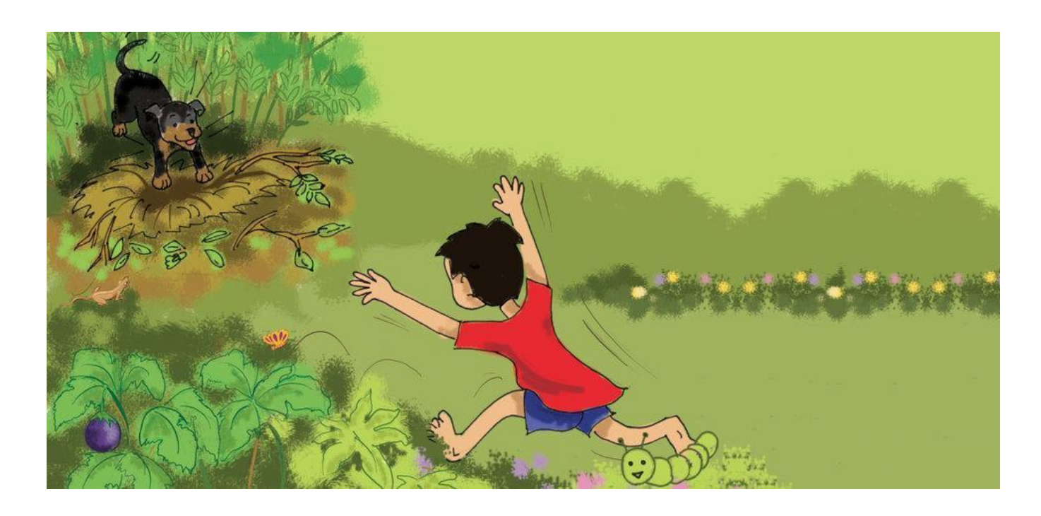
"Kaaloo! To'xta, Kaaloo! " - deb qichqirdi Maaloo, uning orqasidan yugurib. "Bog'ni payhon qilma." Maaloo Kaalooning yer qaziyotganini ko'rib, nima deb o'ylaysiz, tuproq orasidan nima chiqqan ekan? Katta-katta kartoshkalar!