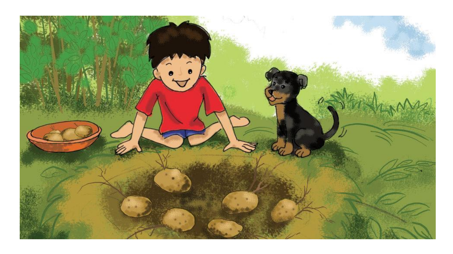
"Barakalla, Kaaloo. Kartoshkalarni topding!" deb xursand bo'lgan Maaloo, savatini kartoshkalar bilan to'ldira boshladi.