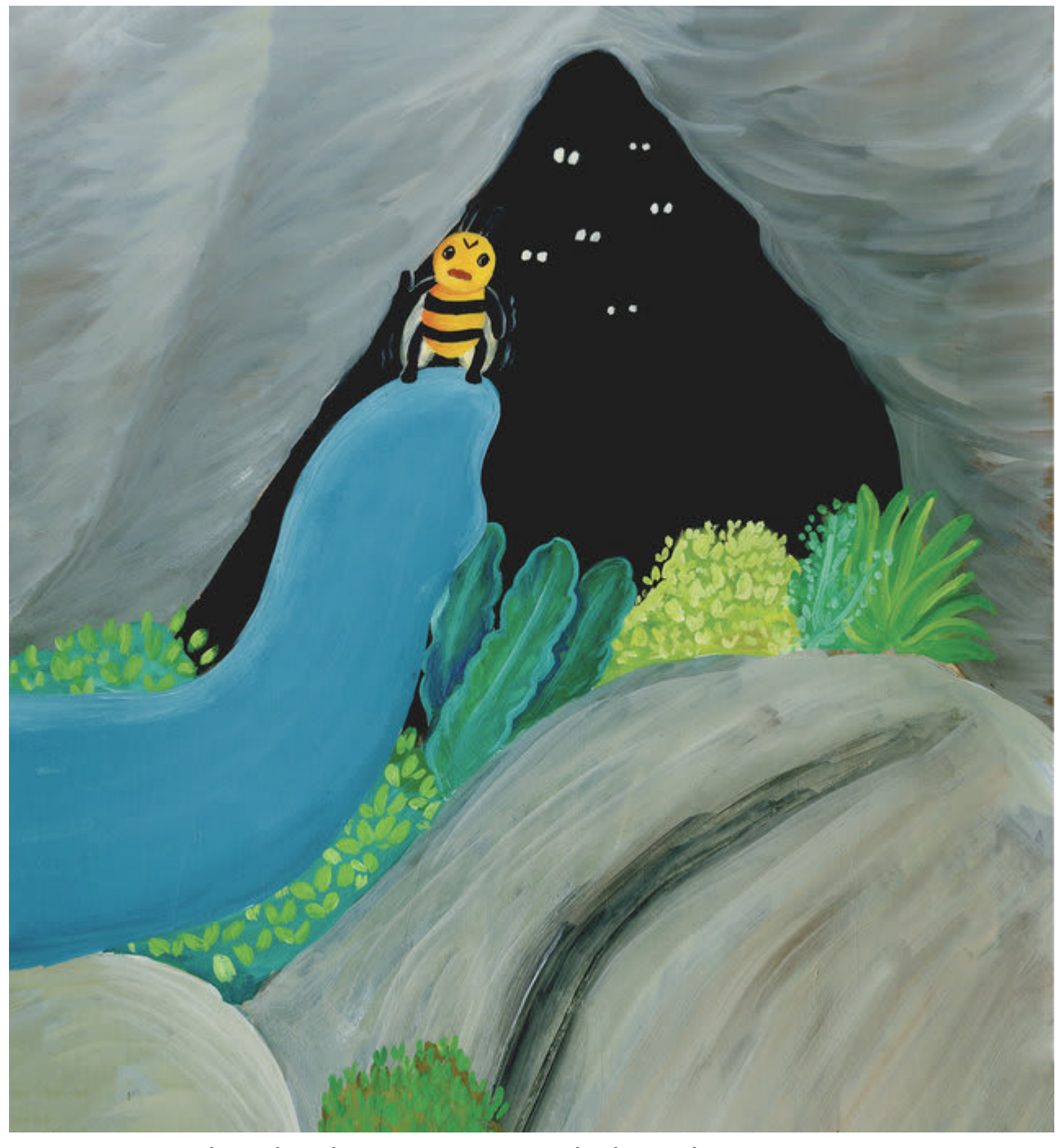
Mayung gara sinani naio," nwng tama hakorode tong?"