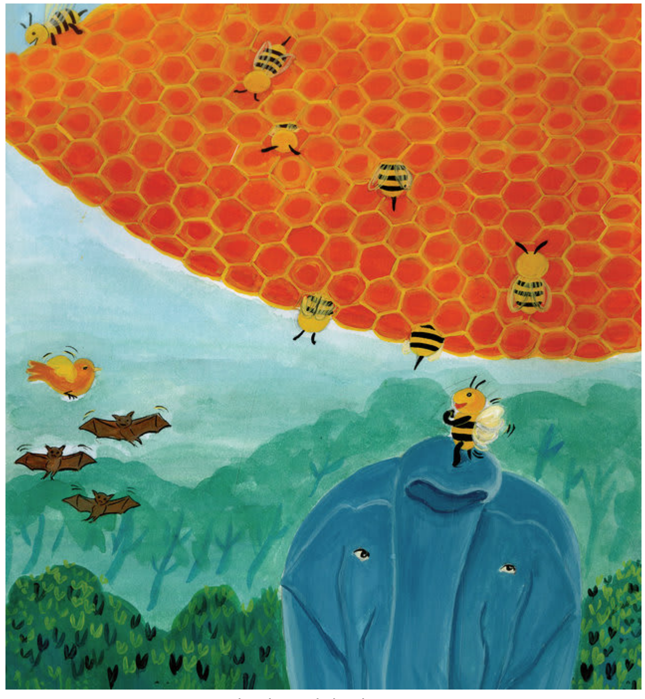
"Poyasa, nwng tama poya bothop daio de tong? "