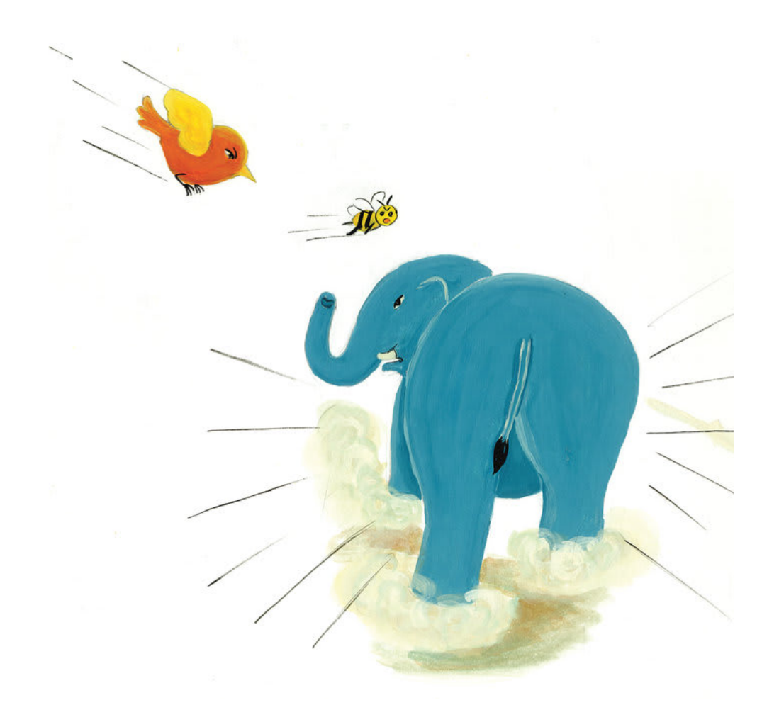
Poyasa kaboi saba, "ohoi!, imo le toksani bothopse."