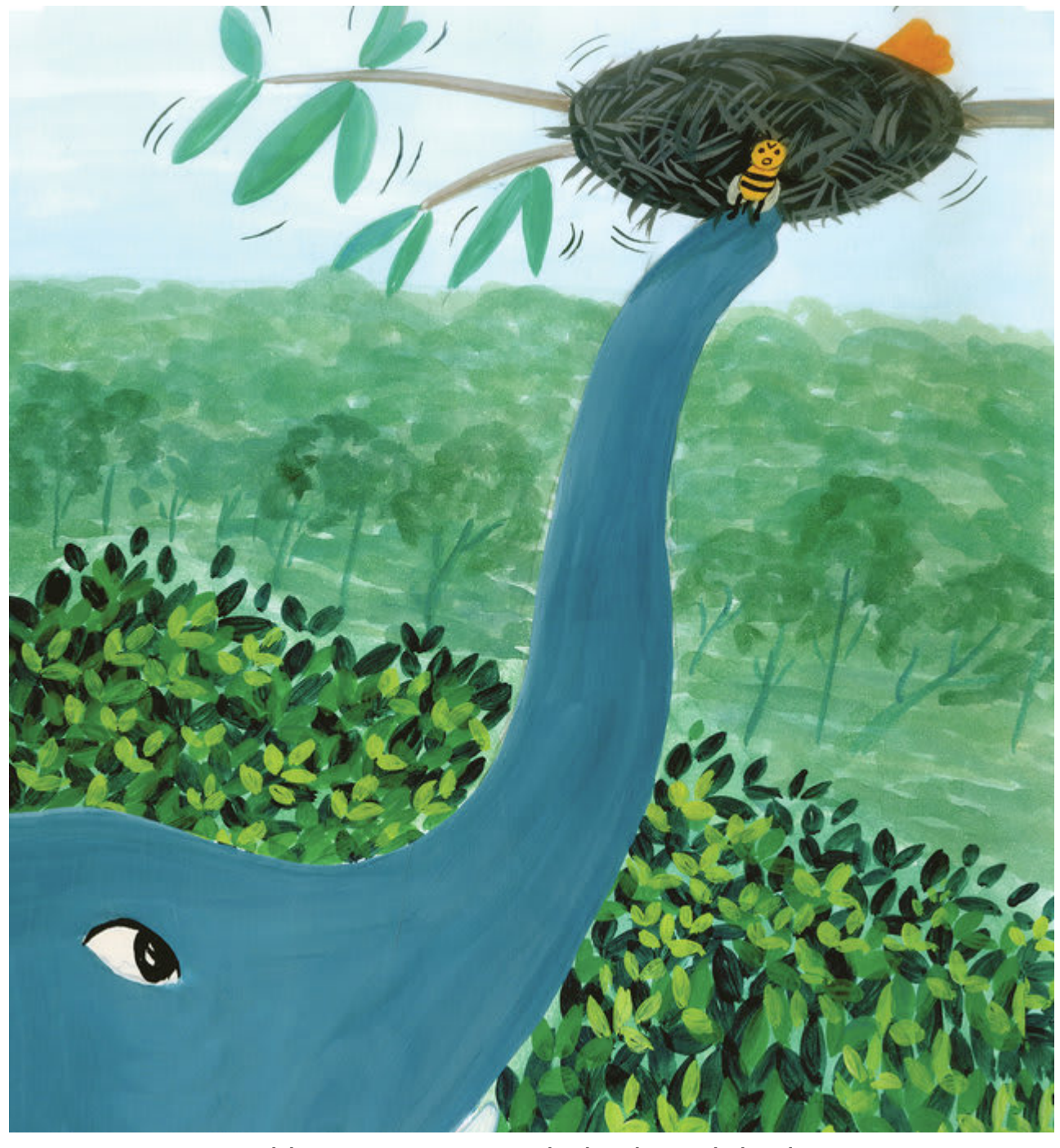
Mayung Gara sungkha, "Nwng tama in bothop daio de tong?