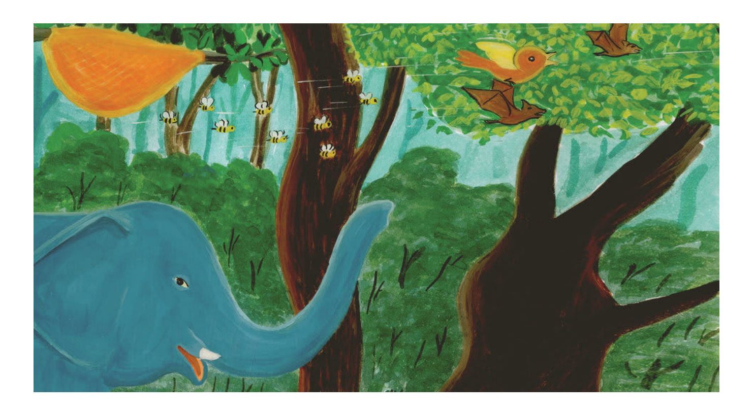
"O Mayung gara, ano chubamani bagoi nono kabang hambai"