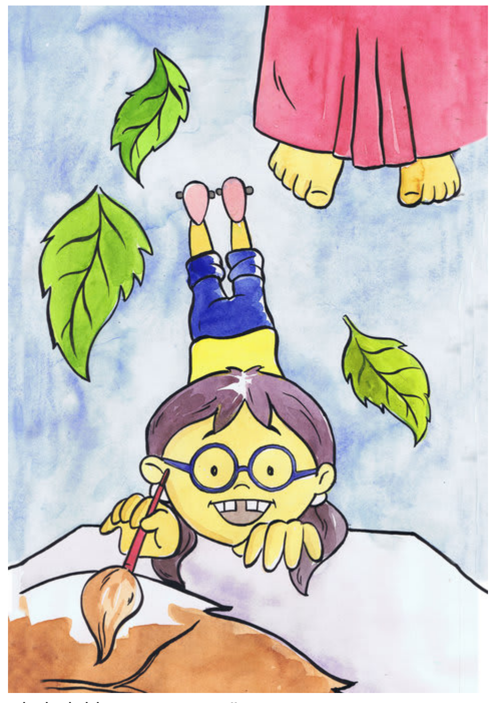
"Mator imo le balai karanse, ama."