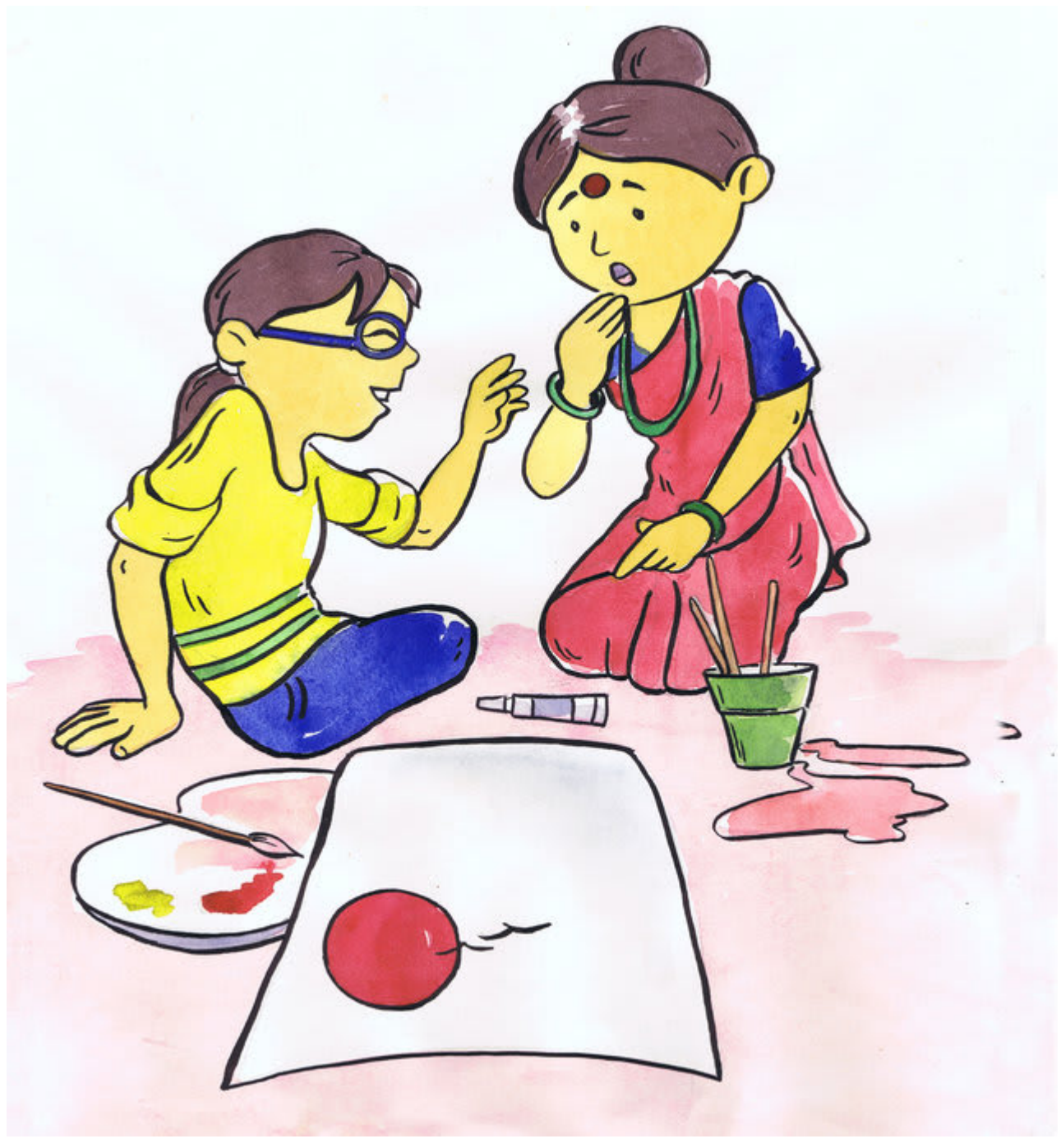
"Sal le koromoluluse ongnona bele, o kwlwi?"