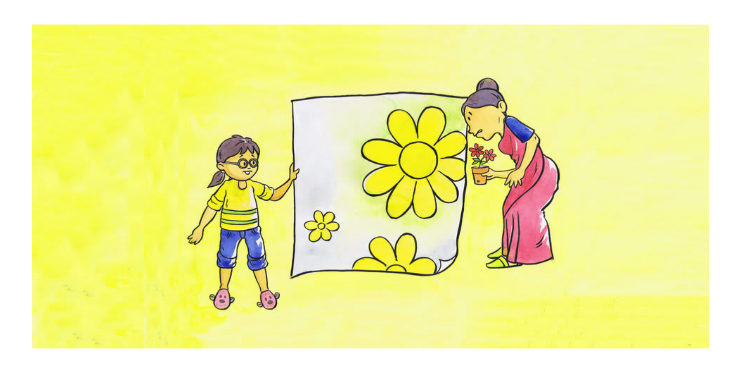
"Naidi, Ama! Ang naithok khum takkha." Boma saba, "Kwlwi, chini khum le kachak." "Mator ani iskulni khum le koromose, Ama."