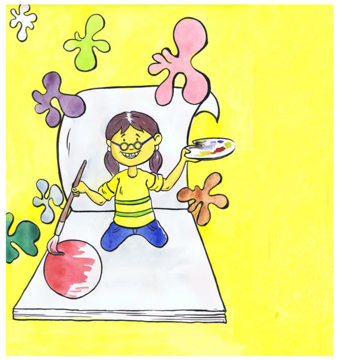
Rojoni rong phulni achukkha.