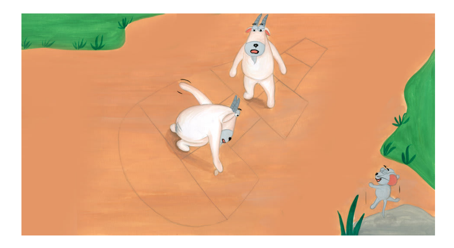
.سویه او وزه په ګډه د اقم سیا لوبه کوي