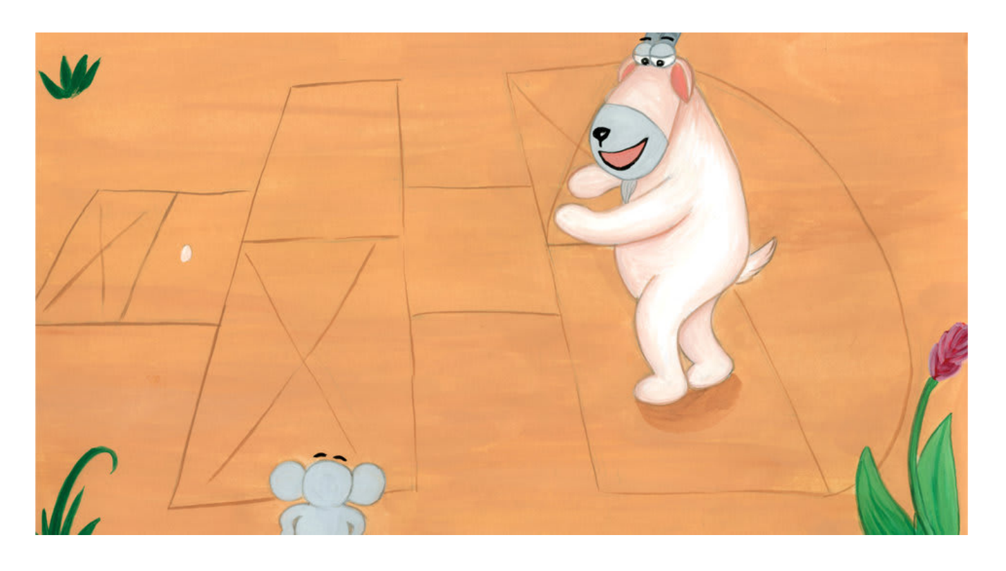
وزه له سوي□ سره په لوبه ک□ ډ□ر خوند اخلي. هغه پر□کړه کوي چ□ بل ځل به، هغه له تخت څخه د لوب□ لپاره راوځغلي.