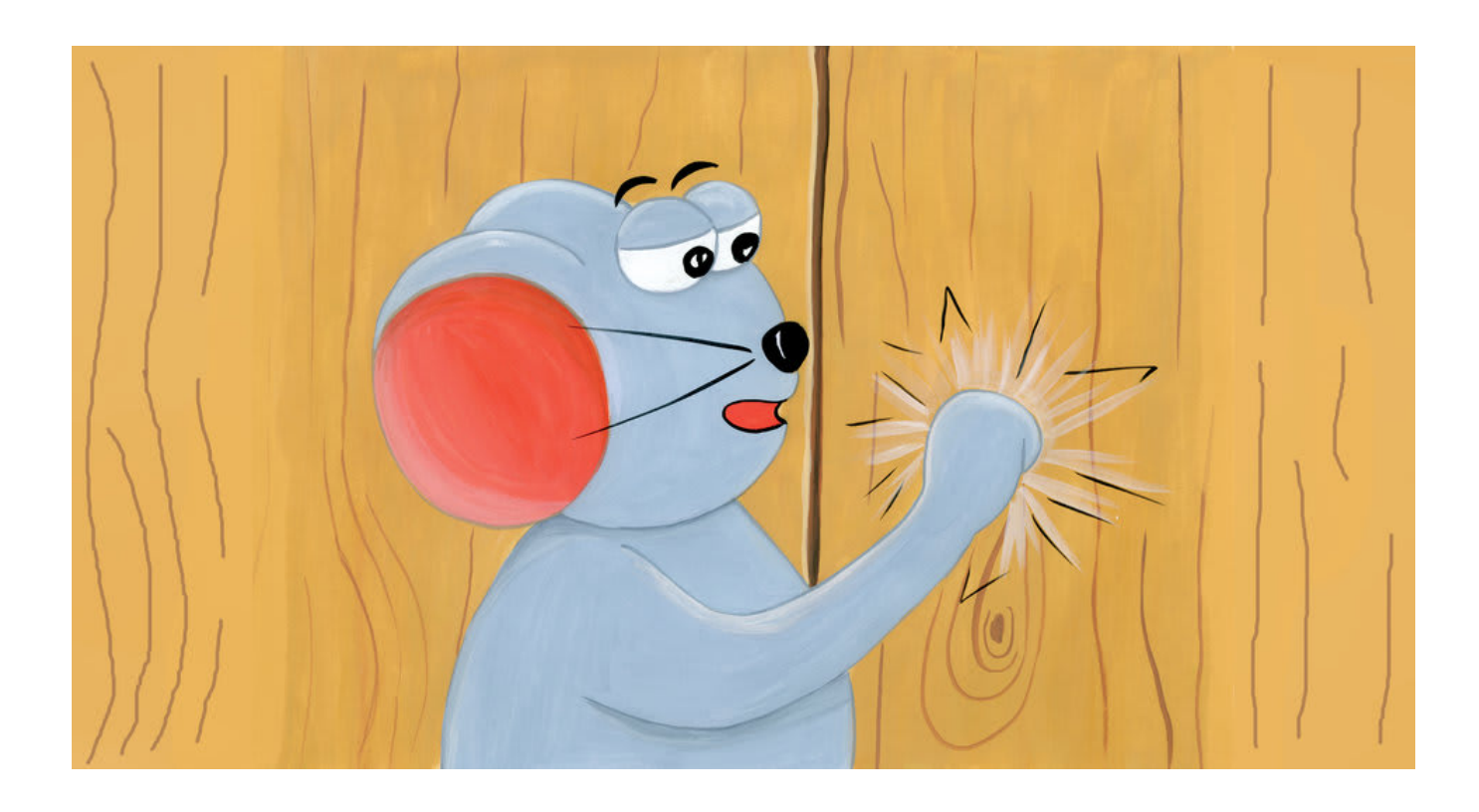
.سویه د وز∏ کور ته ورځي او دروازه ټکوي !ټک ټک