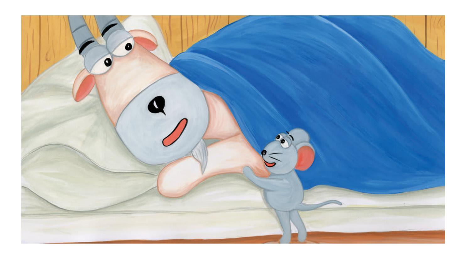
هیله کوم وز□، سویه ځواب ورکوي له ما سره لوب□ وکړه، دواړه به یو ځای ساتیری وکړو