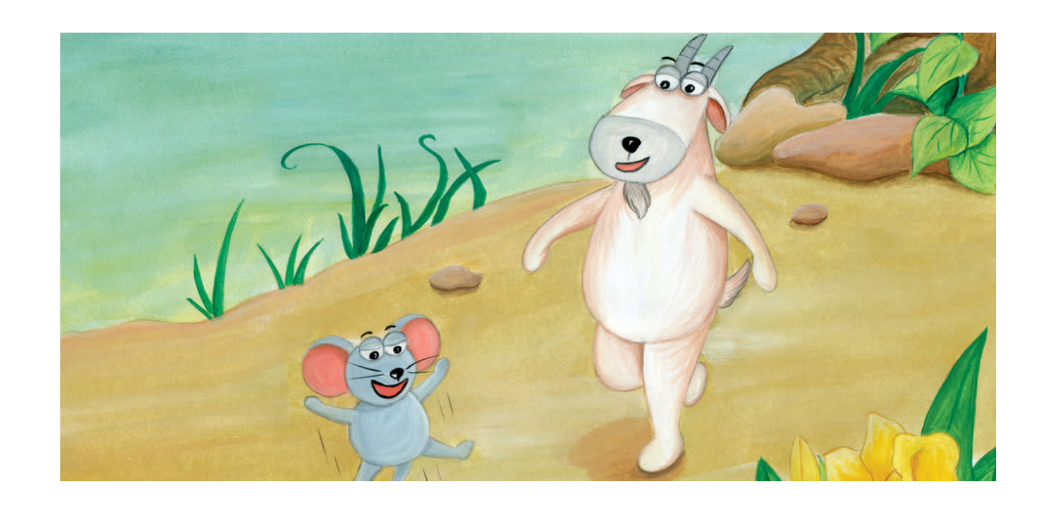
سویه او وزه

سویه غواړي اقم سیا لوبه وکړي، خو ه∏څ څوک ورسره نشته چ∏ لوبه وکړي. د هغ∏ ګاونډ∏ وزه، په کور ک∏ ده، خو هغه غواړي یواز∏ وي. آیا سویه کولای شي بز∏ ته قناعت ورکړي چ∏ له هغ∏ سره لوبه وکړي؟