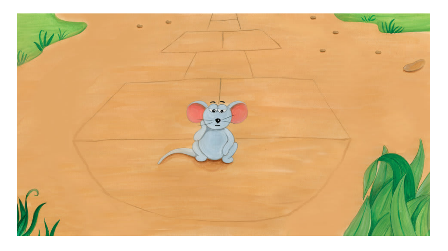
.نن غواړي اقم سيا لوبه وکړي، خو له هغ∏ سره د لوب∏ لپاره ه∏څ څوک هم نشته