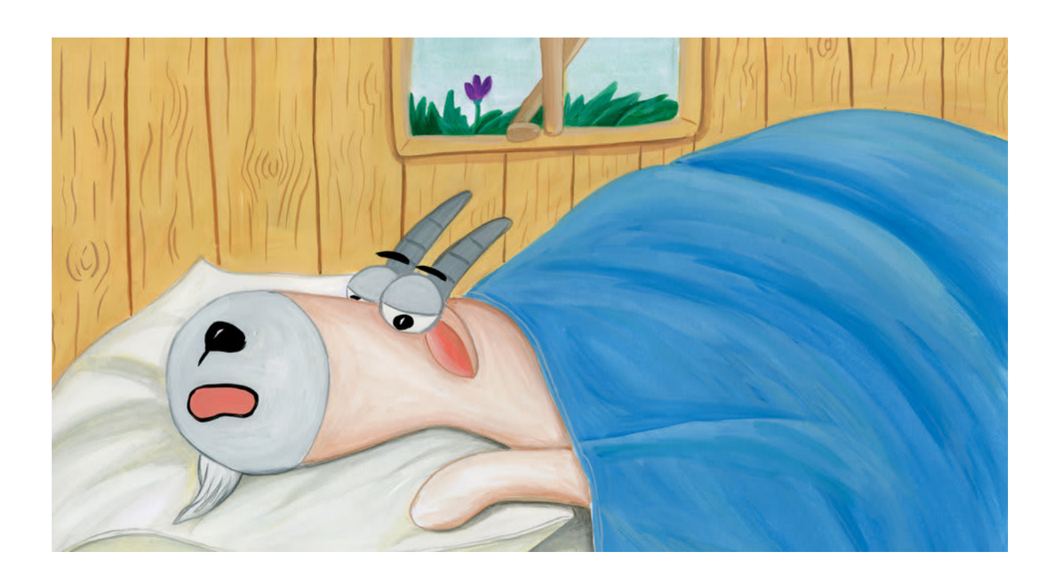
.وزه وایي: نه! نه! زه خوب ته اړتیا لرم. زه نه غواړم لوب∏ وکړم