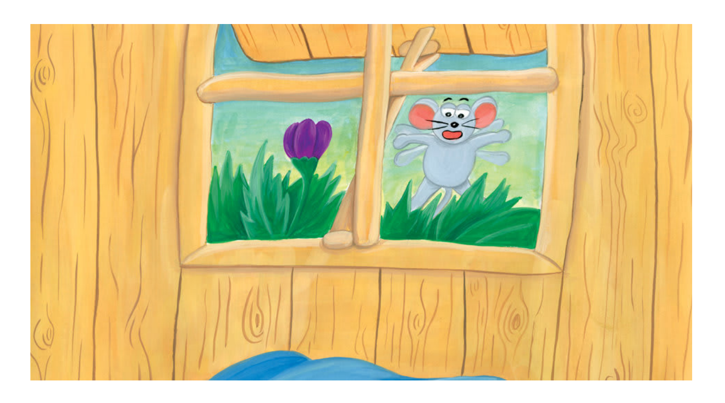
سويه غږ کوي: وز∏، راځه زما سره لوب∏ وکړه