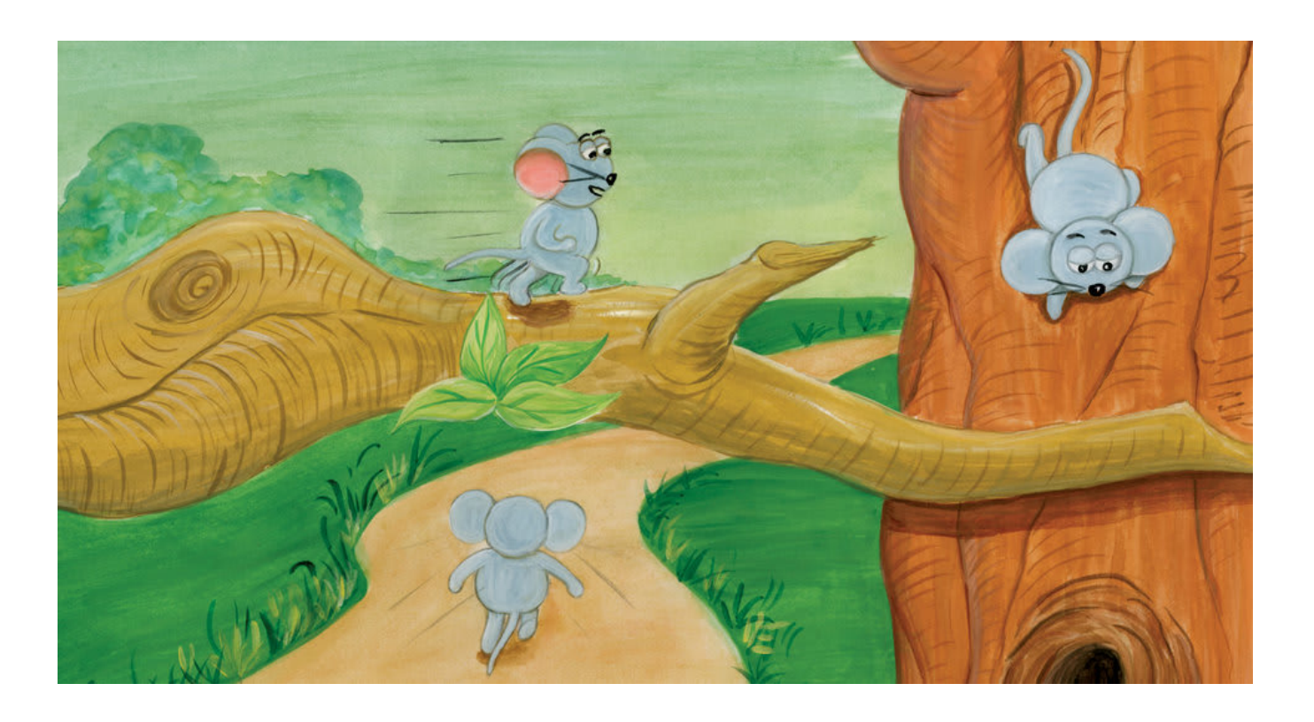
.سویه غواړي بیرون لوب∏ وکړي