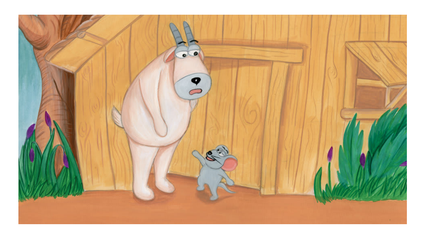
بالاخره، وزه هوکړه کوي. وزه وايي: سمه ده، سمه ده، زه به له تا سره لوب∏ وکړم