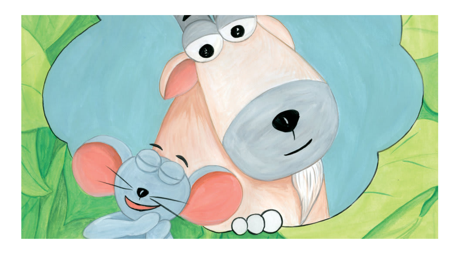
»هغه فکر کوي: «زه یوه مفکوره لرم « زه به خپل∏ ګاونډ∏ وز∏ ته بلنه ورکړم»