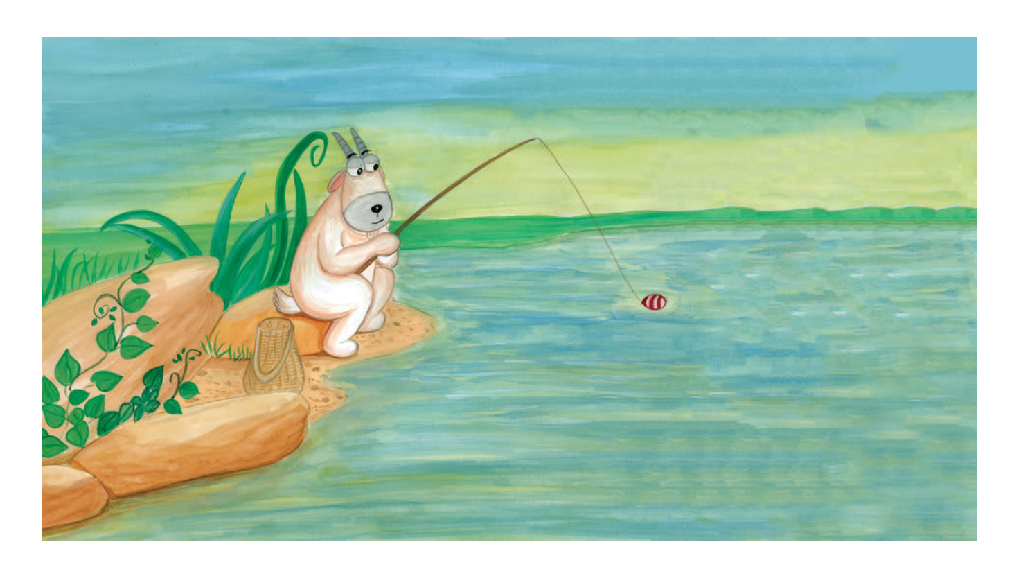
.وزه غواړي چ∏ وخت په يواز∏توب، ماهي نيون∏ او خوب سره ت∏ر کړي