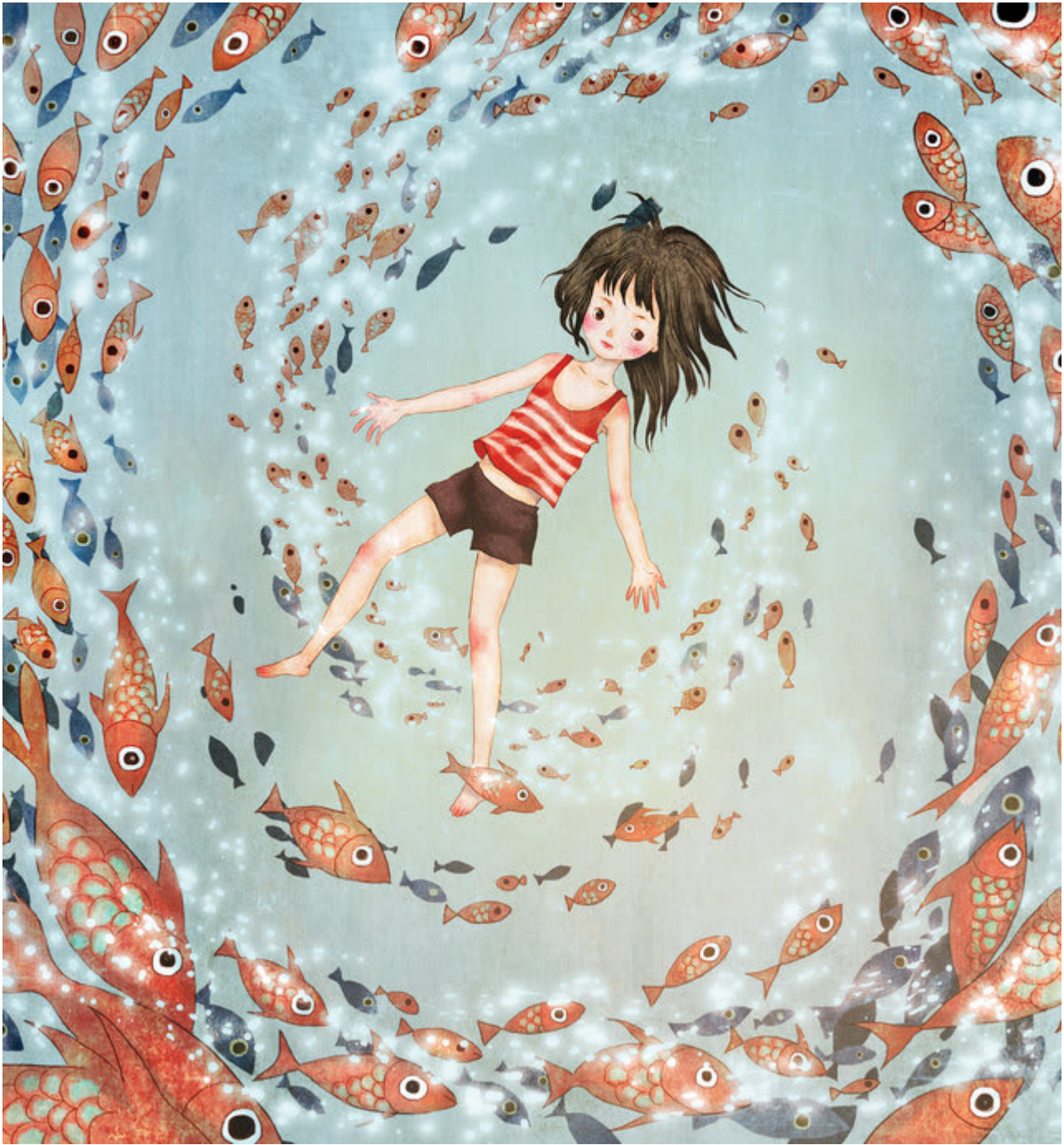
کب وایي: «زمور نه» ته بڼه راغلاست»