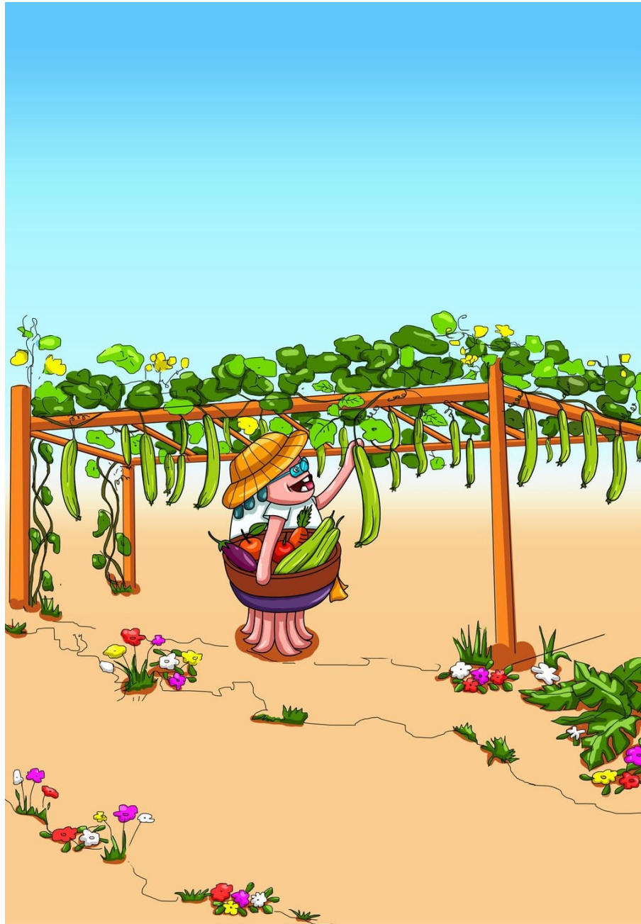
Sogokuru ahinga imyungu