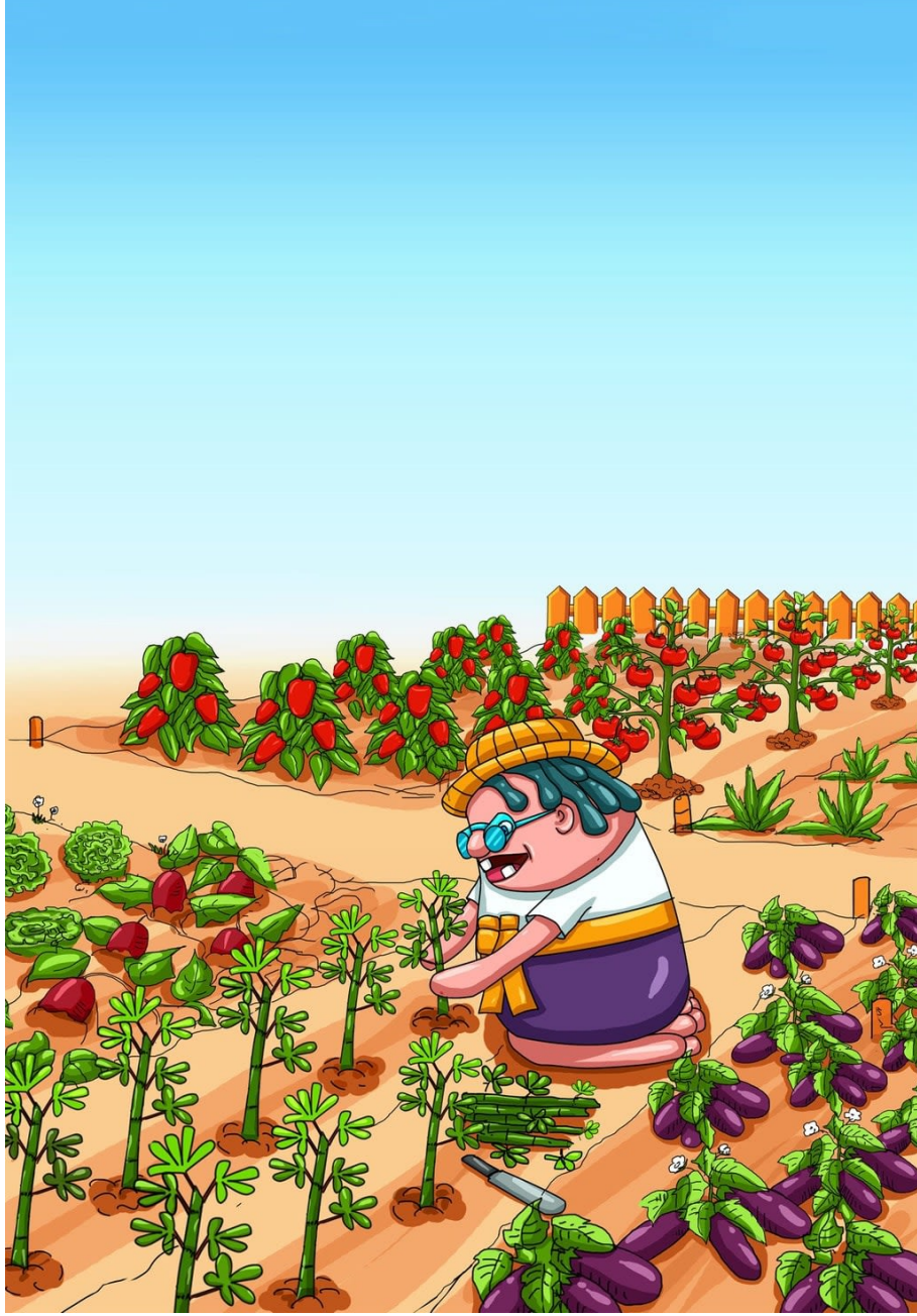
Sogokuru ahinga ibirayi