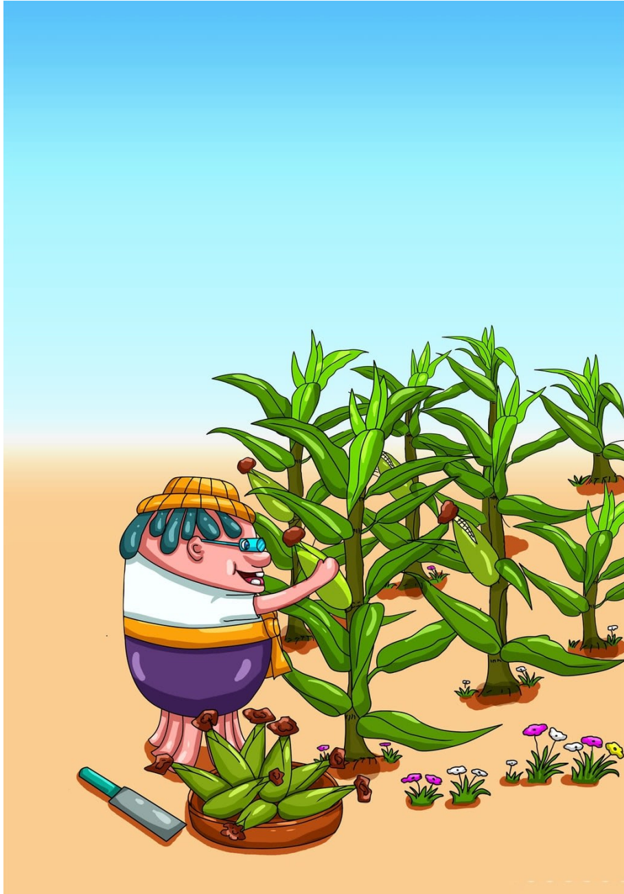
Sogokuru ahinga ibigori