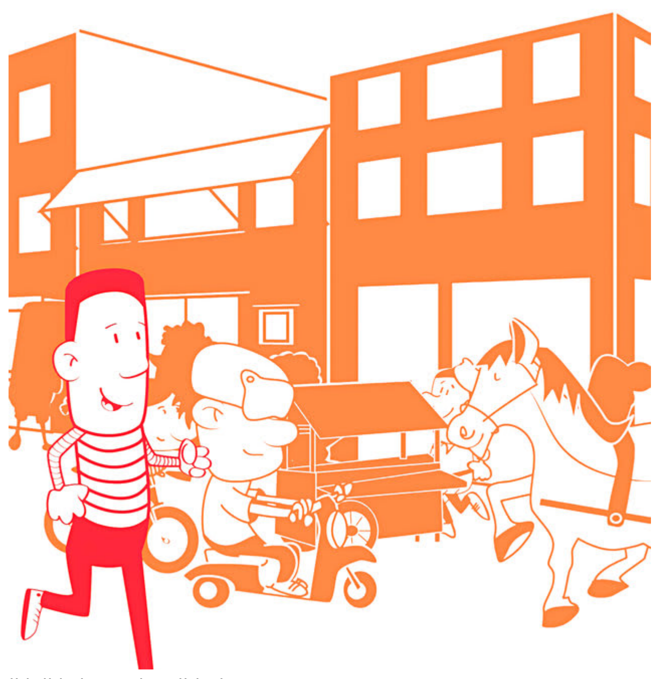
Ipikipiki zinyuraho zihinda ngo vuruuu! vuruuu!