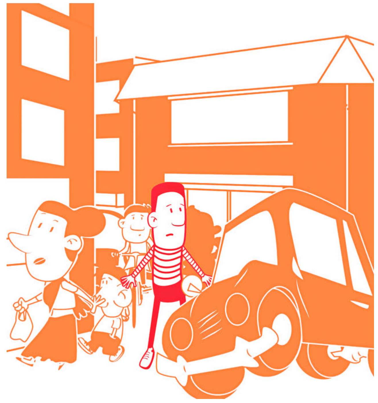
Kamali areba hirya no hino mbere yo kwambuka umuhanda.