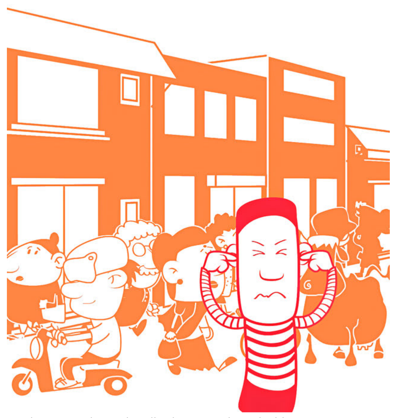
Umugi wuzuye abantu kandi urimo urusaku rwinshi.