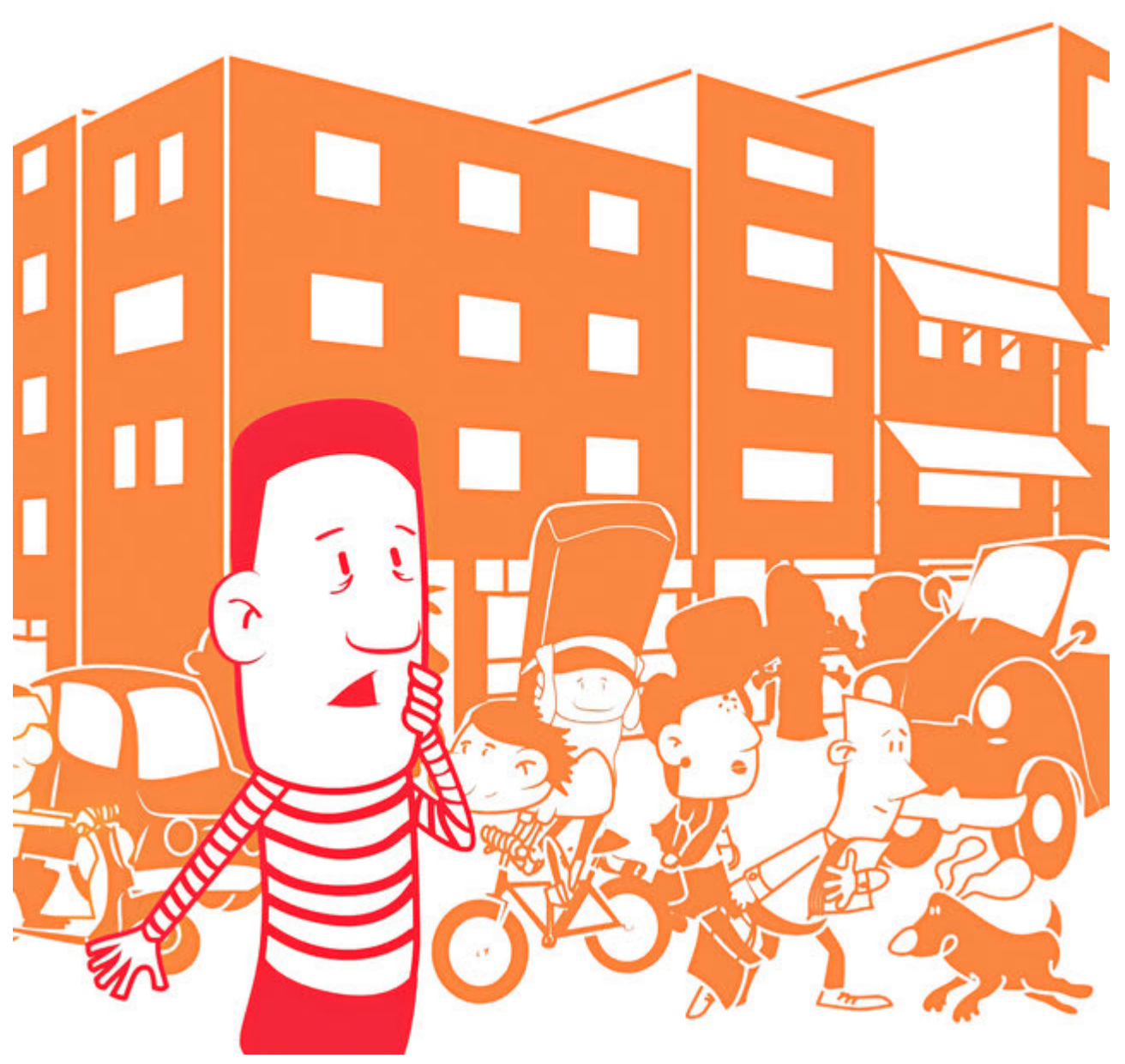
Kamali biramuyobeye. Utishyira mu kaga.