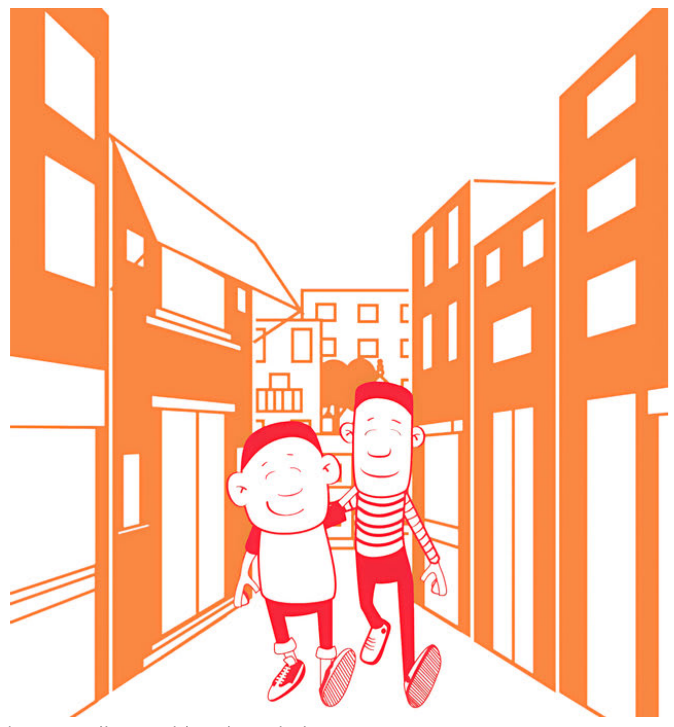
Ubu, Kamali na Gahima bose bajyanye mu rugo.