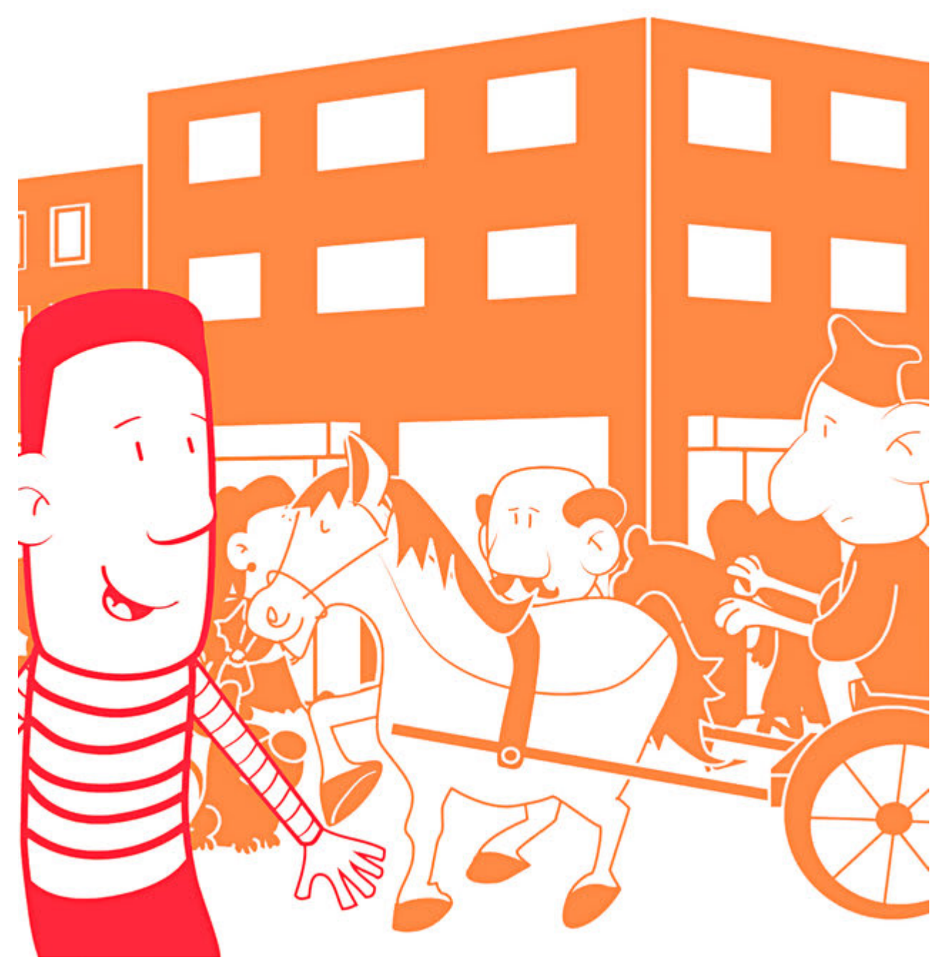
Kamali abona indogobe ikurura imizigo.