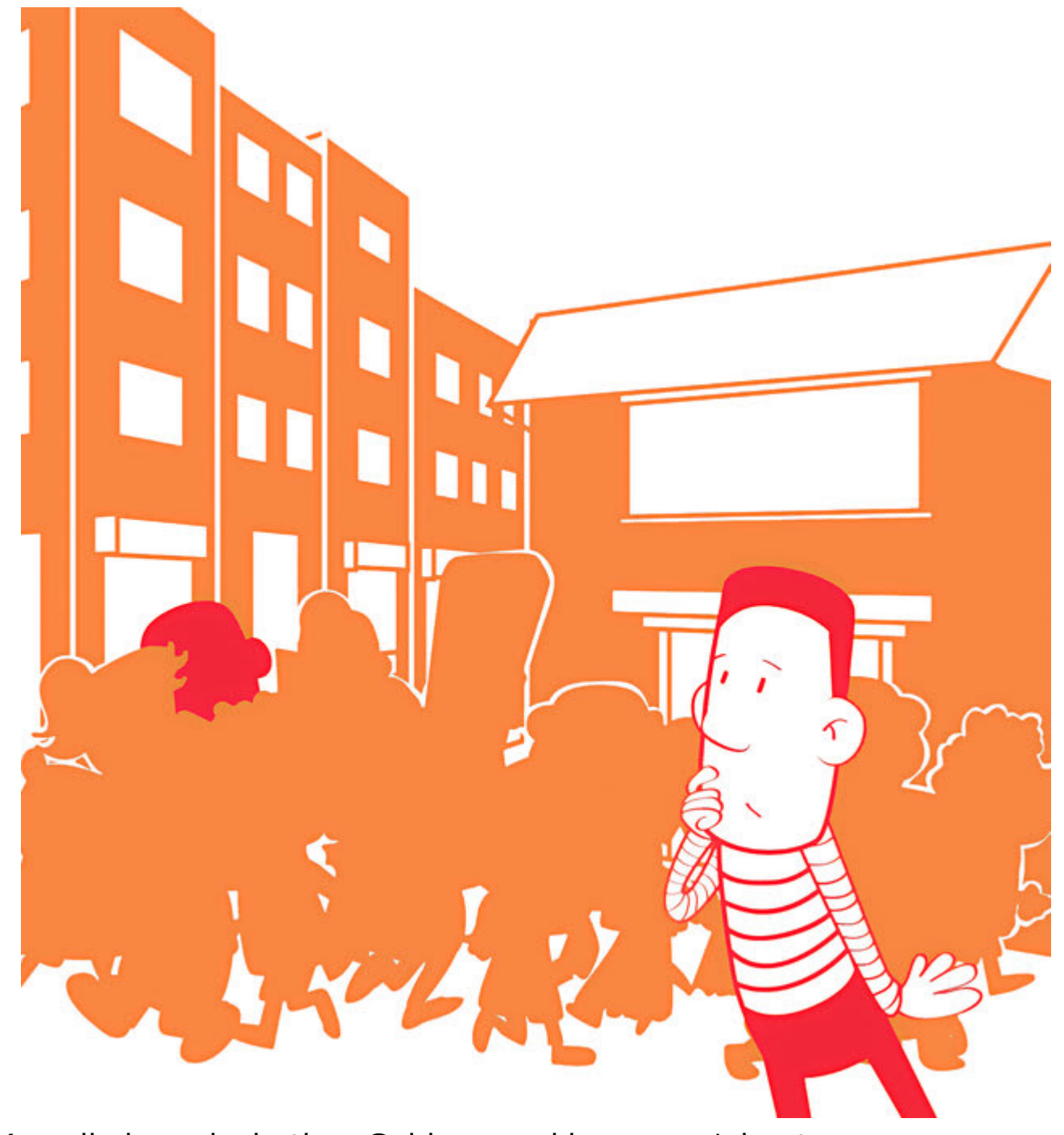
Kamali abona inshuti ye Gahima mu kivunge cy'abantu.