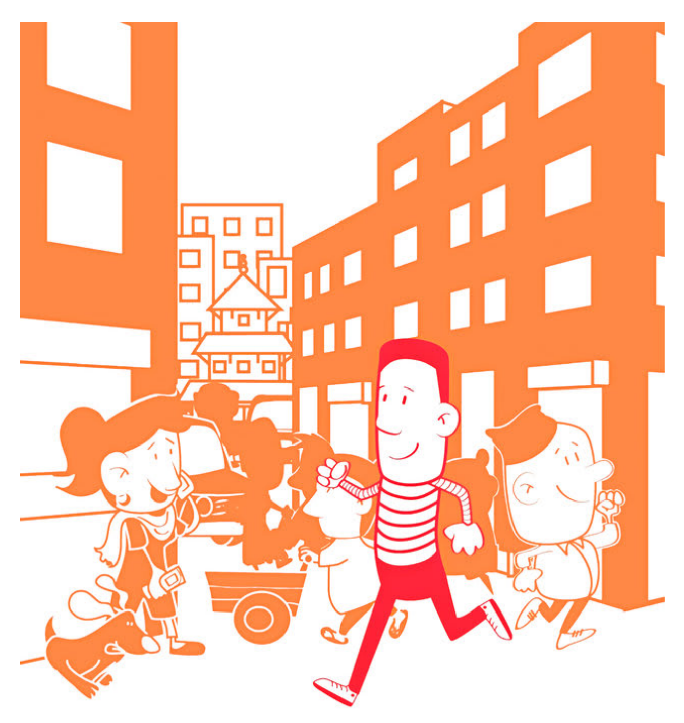
Igihe abonye umuhanda ari nyabagendwa, arakomeza akagenda.