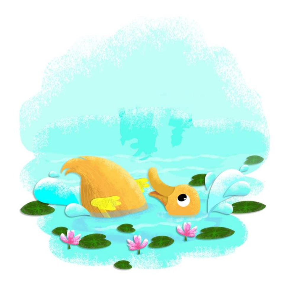
این صدا صدای مرغابی است