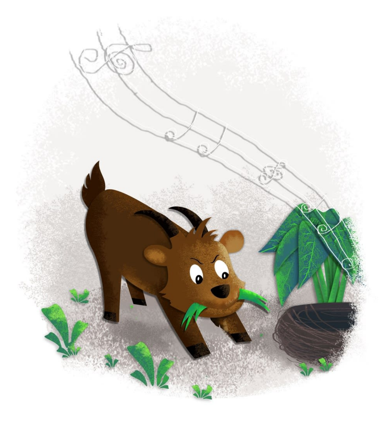
چووک چوووک چوووک این صدای کیست؟