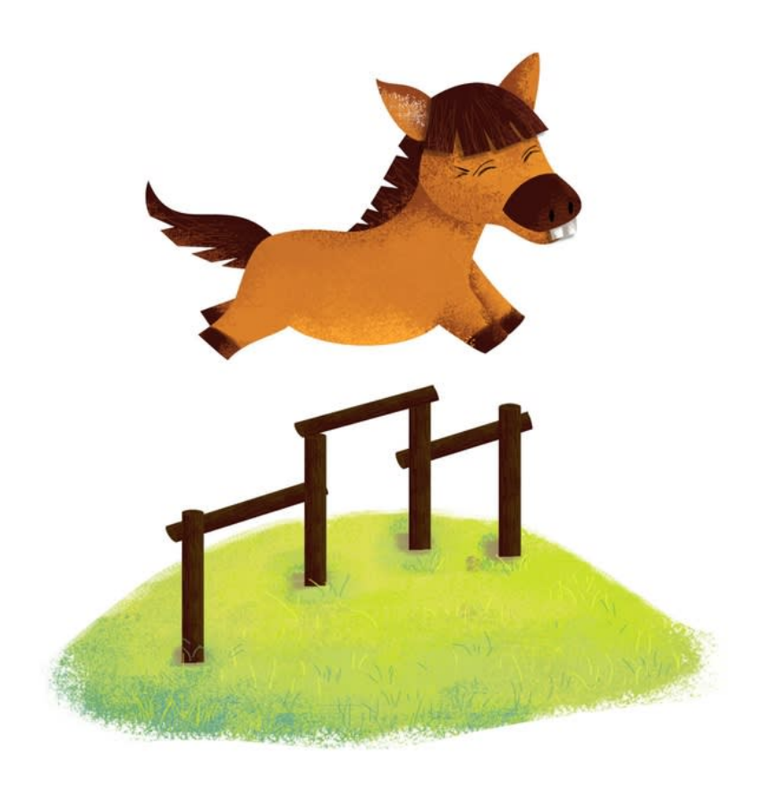
این صدا صدای اسپ است