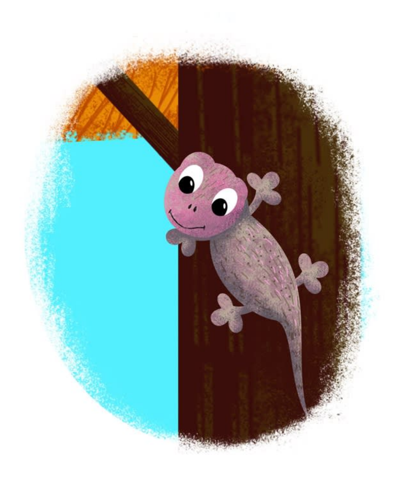
این صدا صدای چلپاسه است