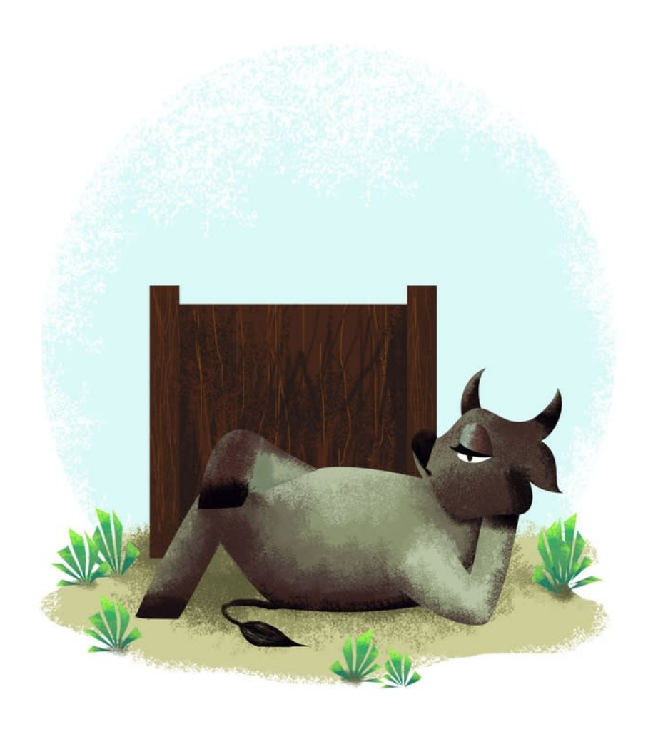
این صدا صدای گاو است