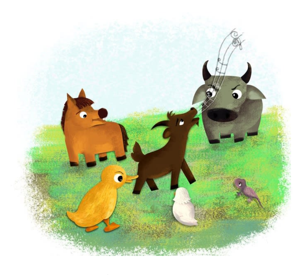
کی میفهمد صدای گوسفند را؟ بععععع بعععع