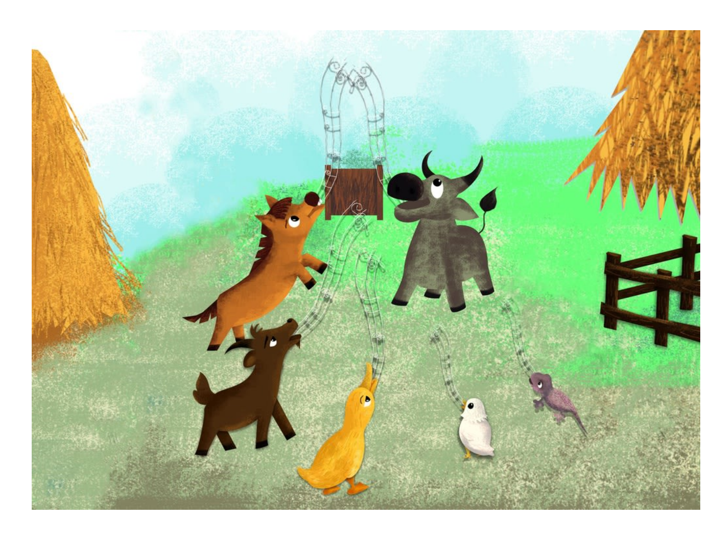
صدا های کُل شان زیبا است