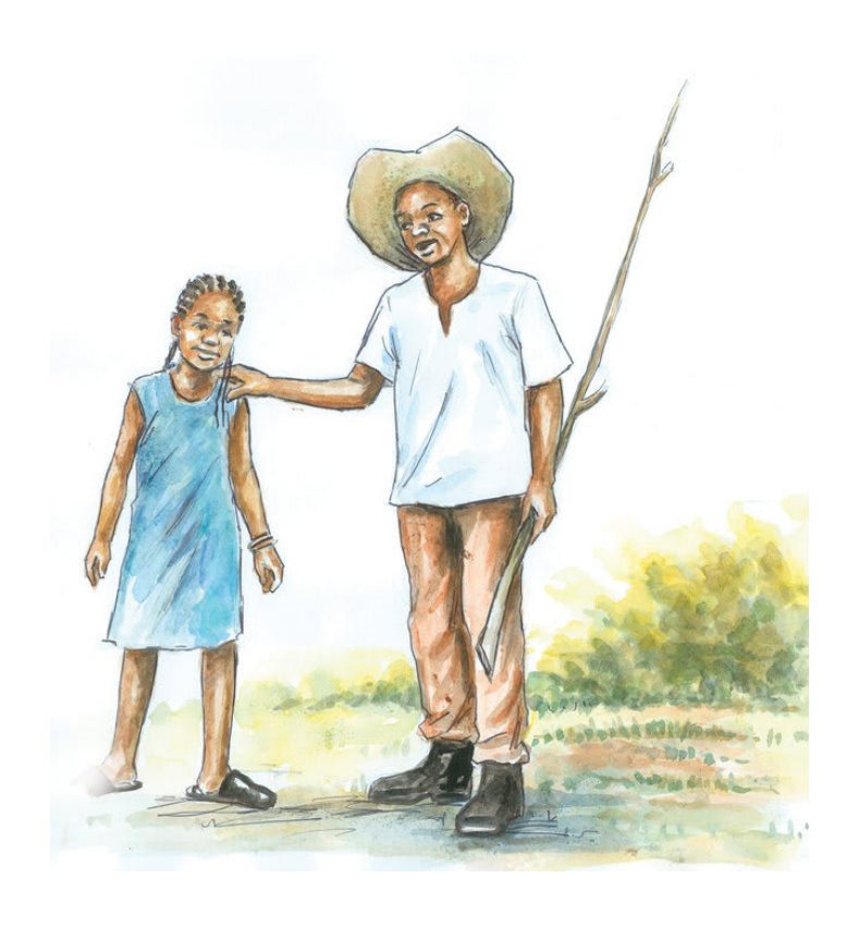
Atate anati, Fati, zilibwino. Tiye tikauze amai ako za njoka ya msipu."