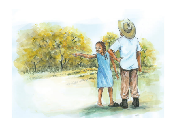
Fati anaona atate ake. Fati anati, "Njoka! Njoka! Atate anafunsa, "Kuti? Kuti?" Fati anati, "Uko! uko!"