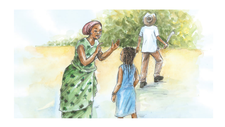
...koma nthawi ina, chonde chonde, uziyang'ana kumene uli kupita, ndiponso uzisamala." Ndiye yanali mathero.