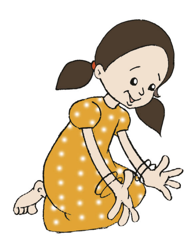
###### ### ###### ####?