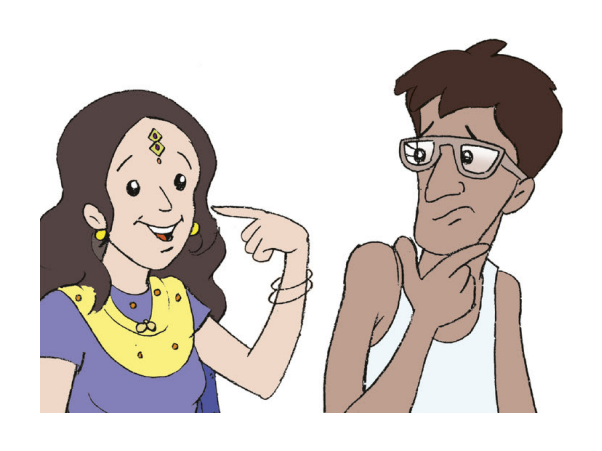
## ##### ### ####?