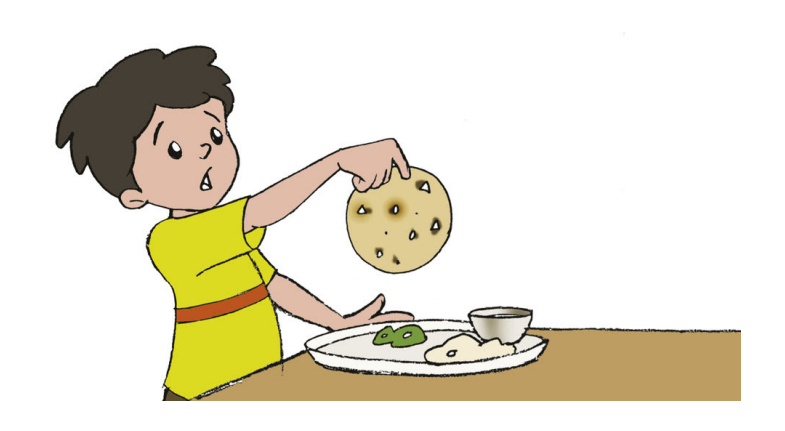
##### ### ##### ####?