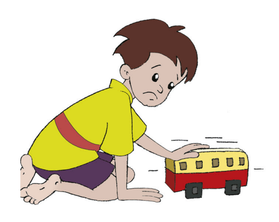
## ## ##### ####?