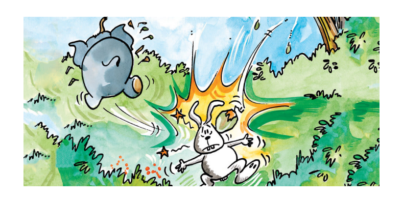
## ##### #### #### ####.