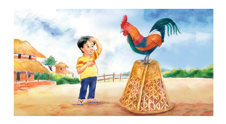
The red rooster has a red crown. "Where is my crown?"