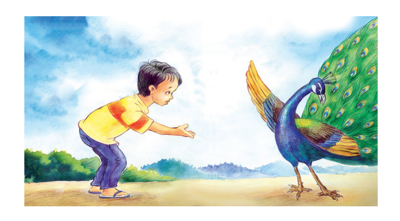
I asked the peacock for his crown. Shaking his head the peacock said, "No, I will not give you my blue crown."