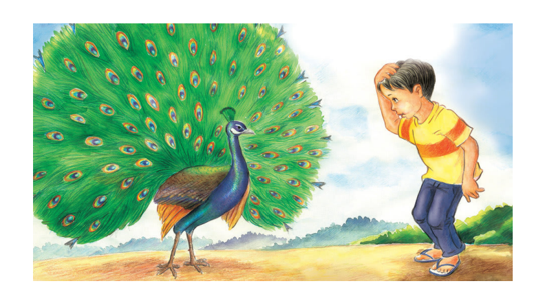
The multi-colored peacock has a blue crown. "Where is my crown?"