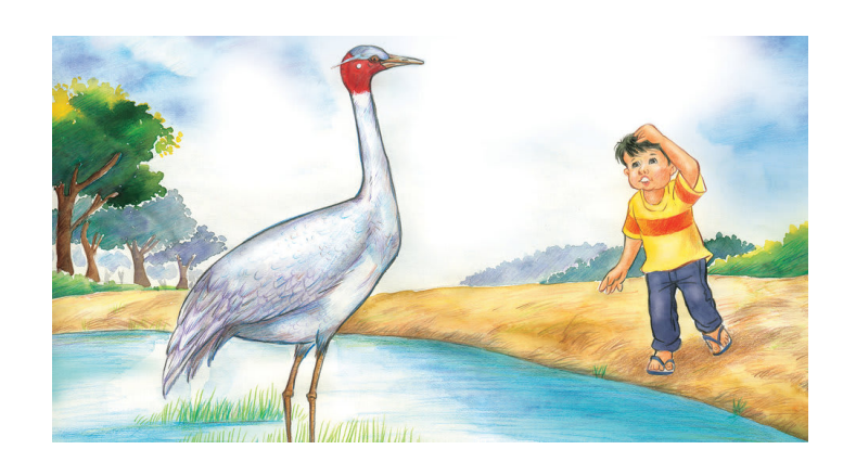
The white crane has a white crown. "Where is my crown?"