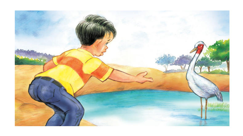
I asked the crane for her crown. Shaking her head the crane said, "No, I will not give you my white crown."