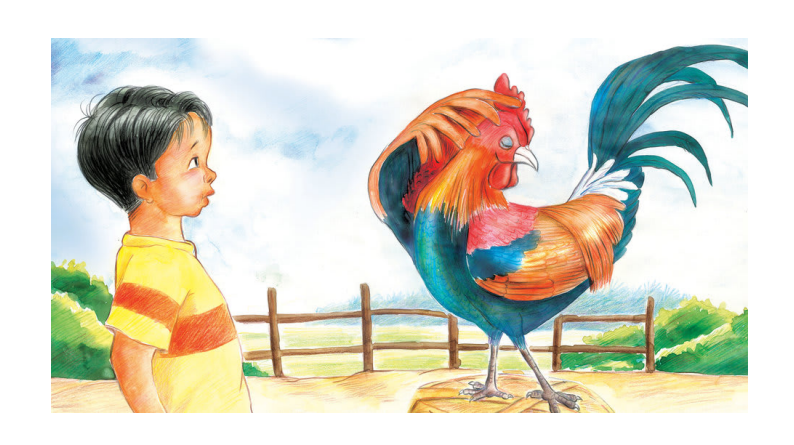
I asked the rooster for his crown. Shaking his head the rooster said, "No, I will not give you my red crown."