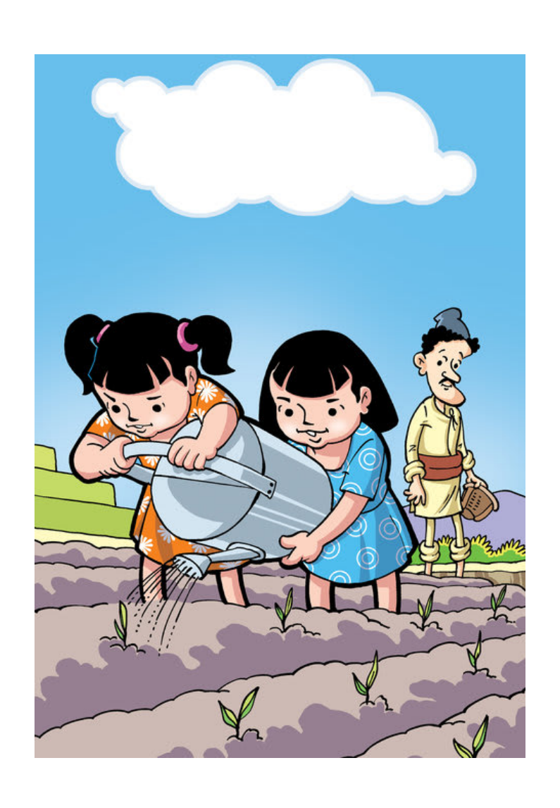
Chunu and Munu are happy. They water the corn.