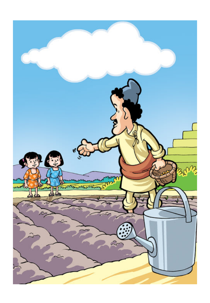
"Okay," Daddy says. "Come and help me."