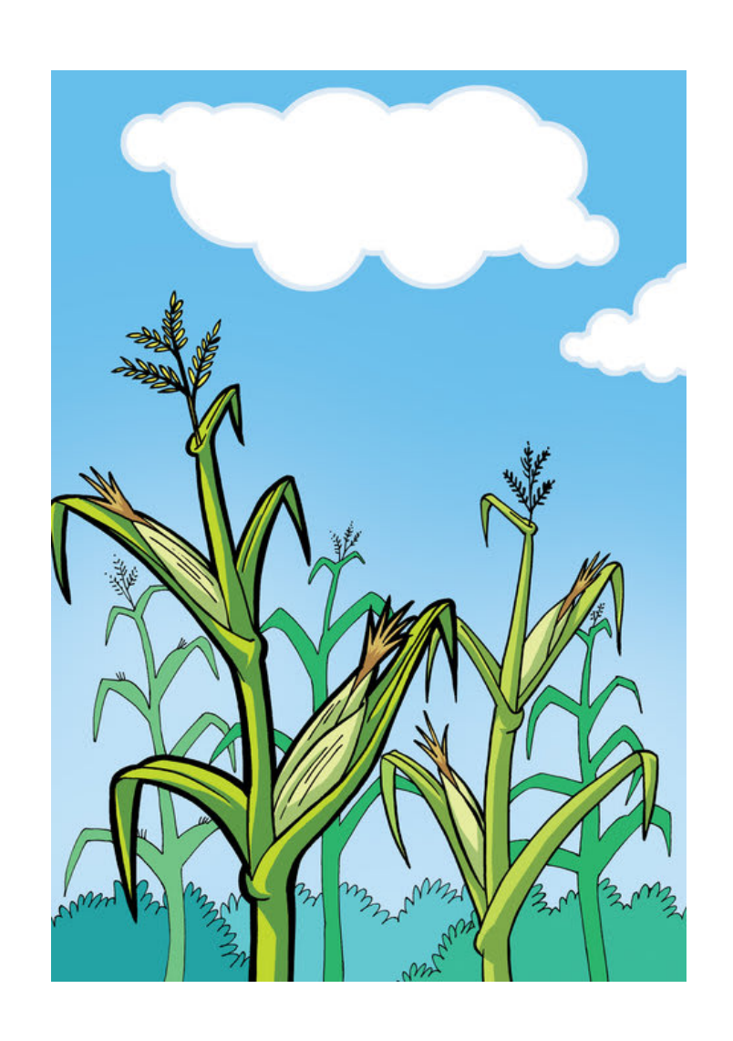
The corn crop is happy.