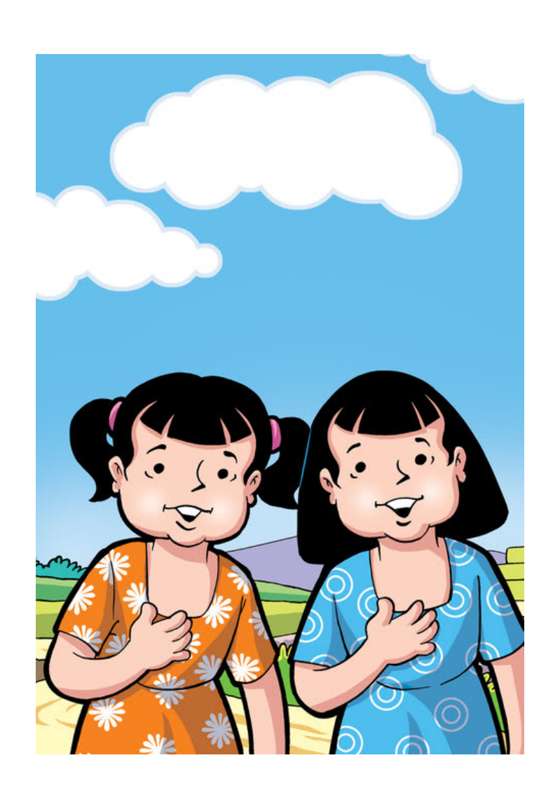
"Can we help you?" the girls ask.