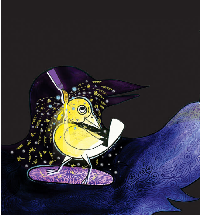
Grandfather Magic painted the little bird a beautiful yellow.