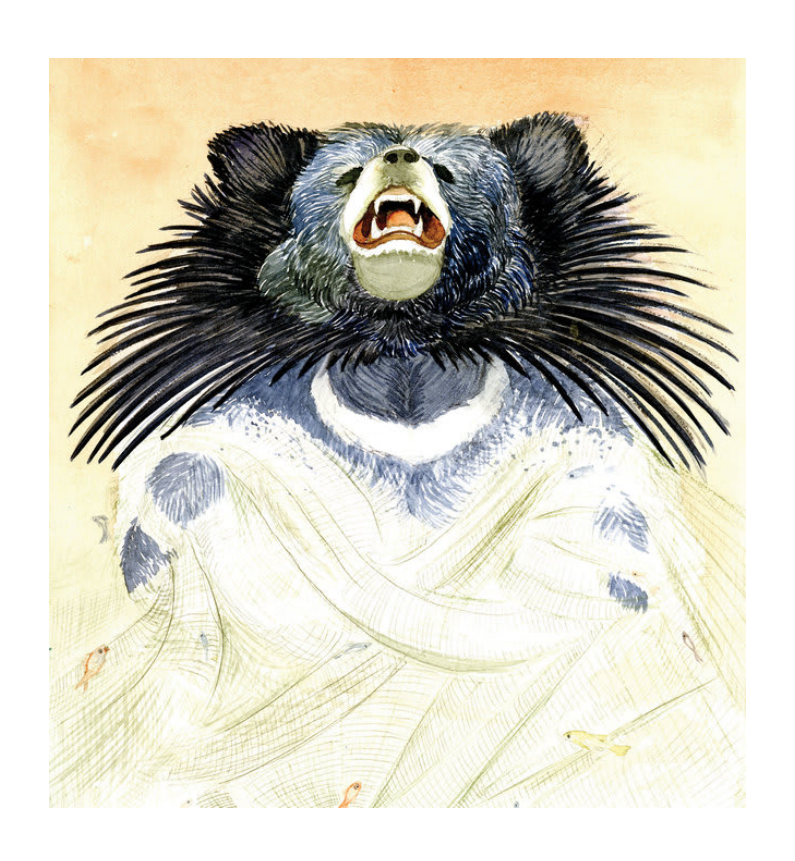
But the fish were clever. They cut the net.