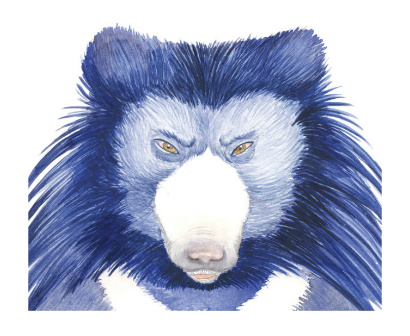
Bear was angry!