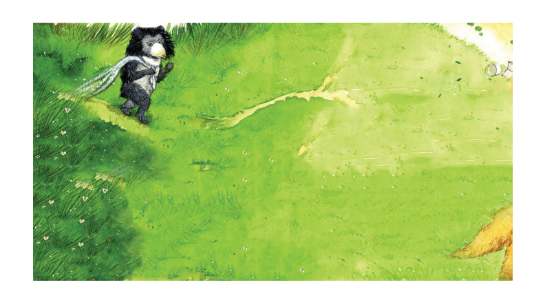
...and came back with his net!