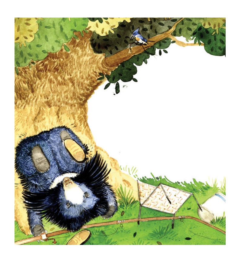
"Oh it must be a big fish!" He pulled harder, but the fishing rod broke.