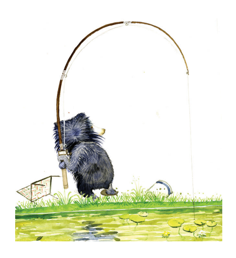
"I caught a fish!" yelled Bear. He pulled the rod but it was stuck.