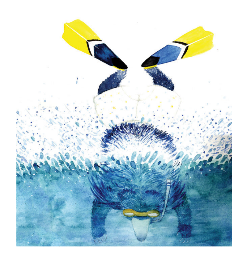
He jumped into the lake.