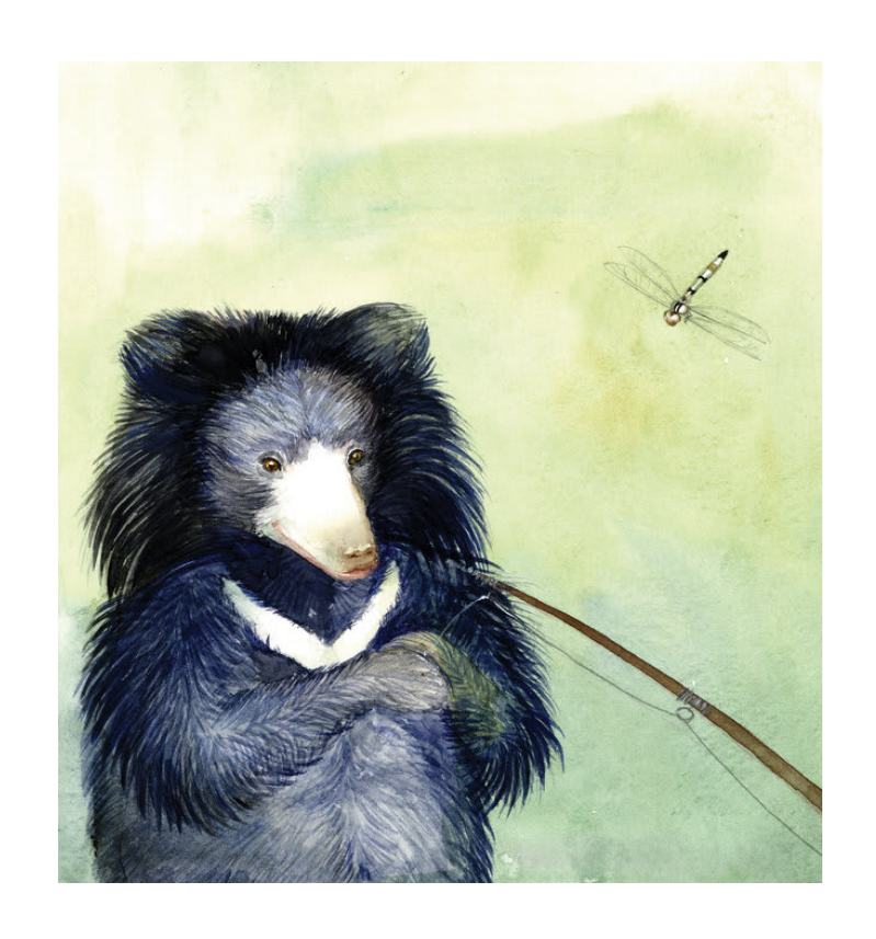
He put some bait on his fishing rod.