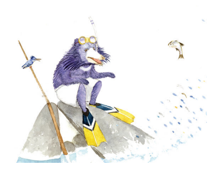
Bear decided not to catch the fish. Now, Bear goes to the lake and plays with his new friends.