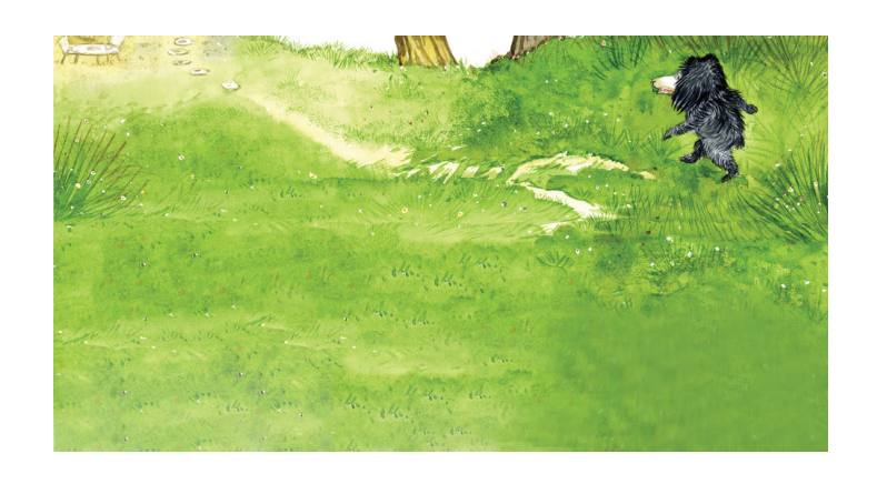
Bear went home...