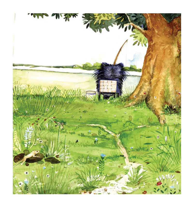
Then, he dropped the line into the water and waited for the fish to bite.