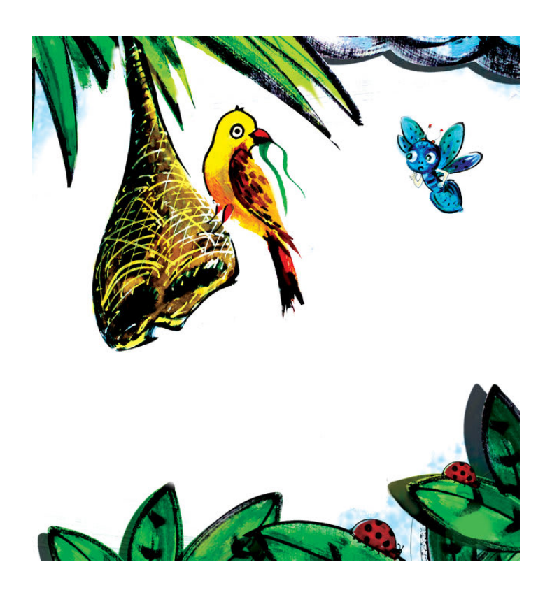
The weaver-bird makes a nest with her beak. She sways in her nest like a dancing queen!