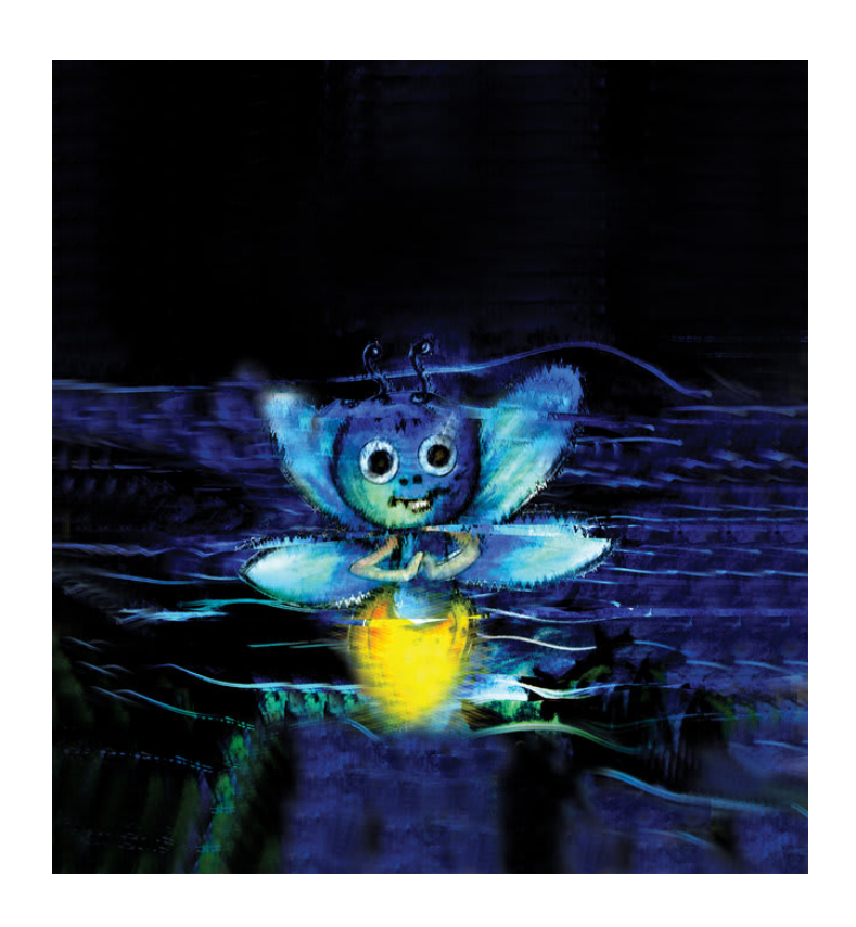
The firefly hovers over the waters dark. And sees her reflection like the stars!