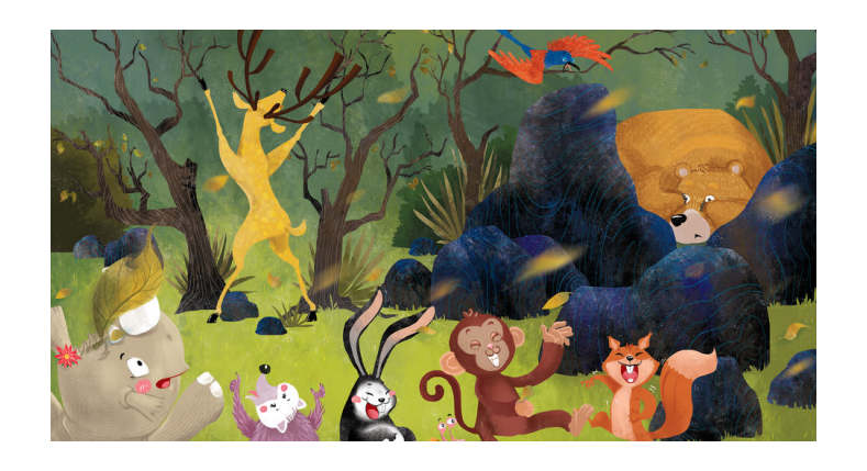
Silly Deer hides among the leafless trees. Giant Bear tries to hide behind the rocks.

Rhino laughs out loud. "I can see where you both are hiding!"