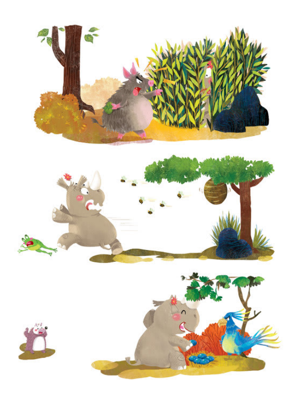
Soon, Rhino has searched for Gecko everywhere . Soon, her feet have worn out!