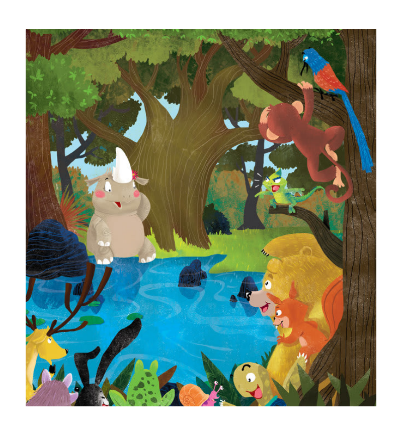
Rhino is very shy. She only plays by herself around the lake. Gecko decides to play a trick on her. He asks all the other animals to join him.