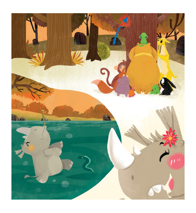
Rhino laughs. She no longer feels shy. "Now it's my turn to hide and all of you have to find me. I already know where I'll hide!"