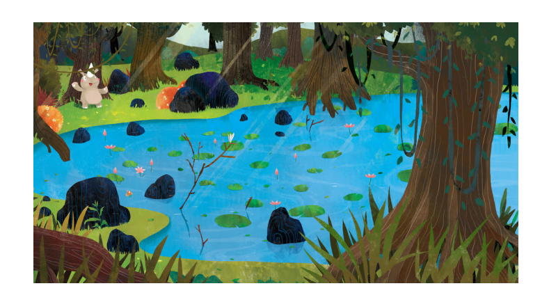
Rhino starts counting. "Five... Ten... Fifteen..." When she's done counting to one hundred, she opens hereyes. "Where is everyone?" she wonders. "How will I find them now?"