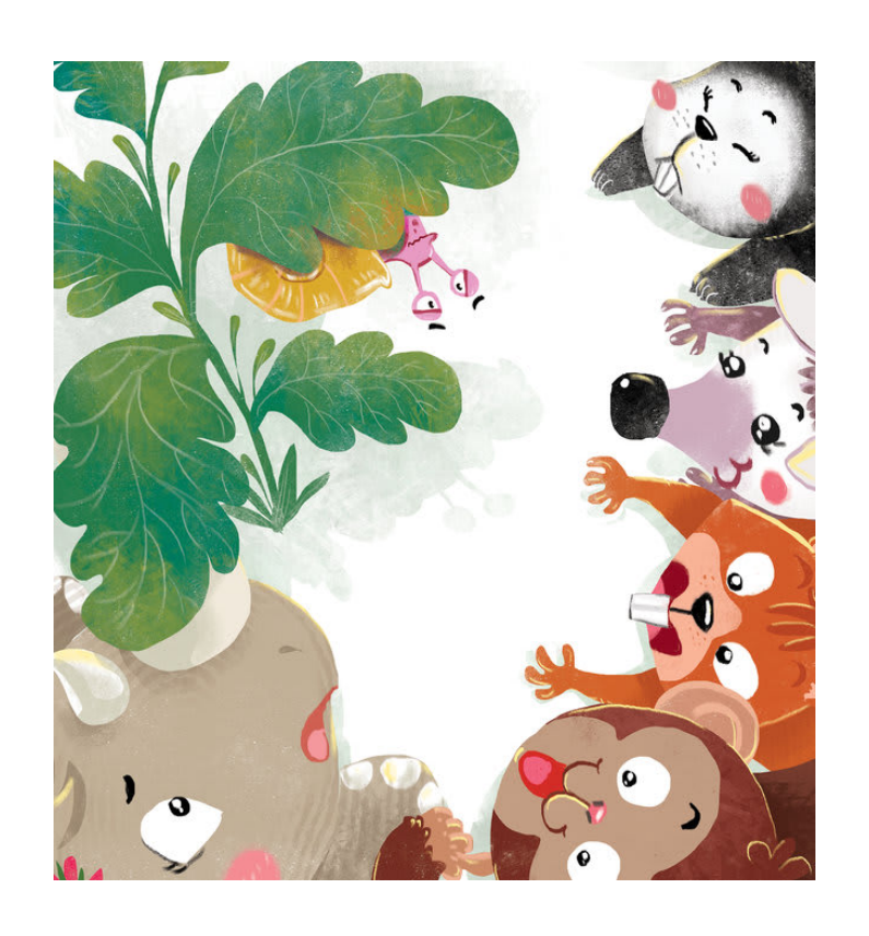
Snail is slowly crawling under a leaf.