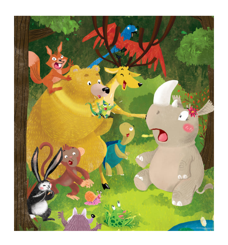
"Rhino!" Gecko calls. "Do you want to play hide-and-seek with us? We will decide who hides first with rock-paper-scissors."