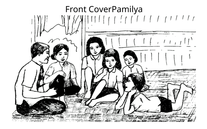
Stage 1, Decodable KalanguyaCommunity Living