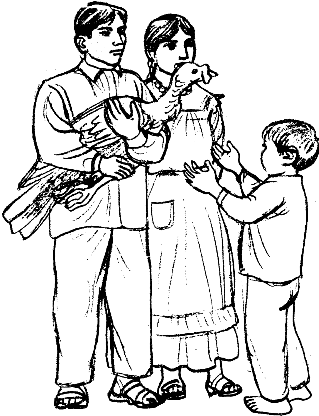
Hi Ama han hi Ina